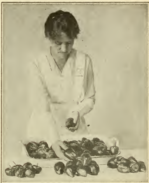
FIG. 1.—Sorting pimientos according to size and maturity before washing.

In a general way the best soil to use is one made up of one-third by bulk of garden soil, one-third of well-rotted manure, and one-third of coarse-grained sand, but the best proportion of each will vary with its character. If the soil is heavy and compact, use less soil and more sand; if it is sandy, use more soil and less sand. If the manure is heavy and poorly rotted, take pains to make it as light as possible and use a larger proportion. It is important that the ingredients be well mixed, which can best be accomplished by throw-