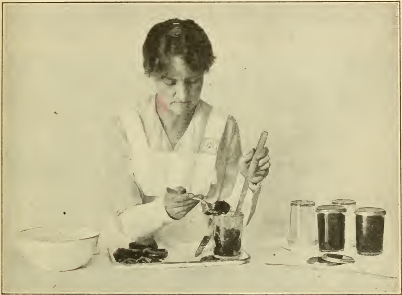
FIG. 3.—Packing pimientos.

The fruits of the mild-flavored varieties of Spanish peppers (used in canned pimientos) differ from the ordinary sweet bell pepper in that they have a much thicker meat, a very tough skin, and are smooth in contour, being comparatively free from ridges. These peppers upon being heated develop a juice which, when mixed with