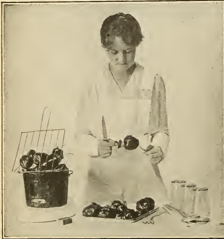
FIG. 2.—Seeding, coring, and peeling roasted pi-mientos before packing.

ing them into a conical heap, shoveling this over, and then passing it through a coarse sieve of about a half-inch mesh. Carefully level about 2 to 3 inches of this soil in a shallow box and water as thoroughly as possible without making it actually muddy. Let it stand for at least an hour and then add about one-half inch of fresh soil, and in this plant the seed either in drills about one-fourth inch deep or scatter over the surface and evenly cover with from one-fourth to one-half inch of the fresh earth. If the box is to be exposed to the sun, it is well to cover it with a paper, but care must be taken to remove this before the young plants appear, which they should do in from 7 to 12 days. The box should be kept where the temperature can be held as uniformly as possible at 60° to 80° F. It might run higher in midday, but germination will be checked in proportion as it runs lower.