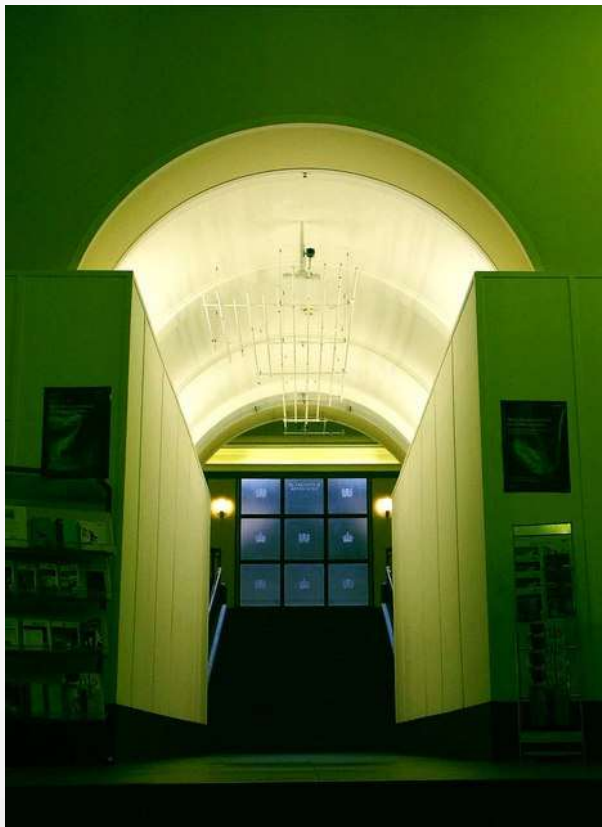
National Library of Scotland front lobby, 2007