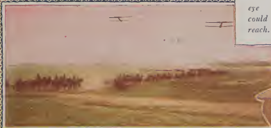
As far as the eye could reach.