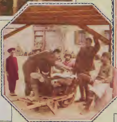
The barber of Seville.