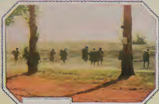
Forward! Ever forward!