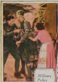
Military Police have no heart!