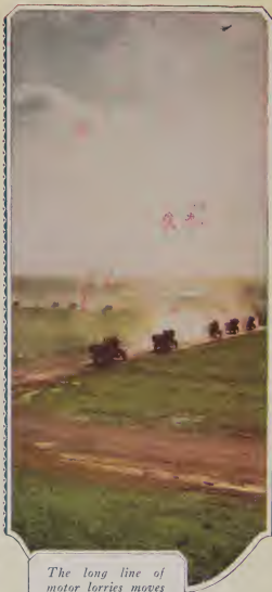
The long line of motor lorries moves forward