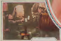
Fun in a wine-cellar