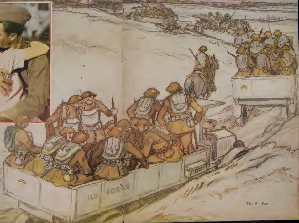
The Big Parade