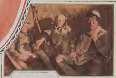
Detained in a shell-hole