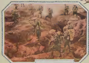
The new attack!