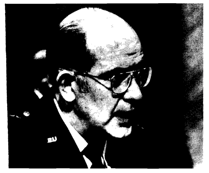
Air Force Lt. Gen. Lew Allen Jr., director of the National Security Agency, testifies Oct. 29 before the Senate Select Intelligence Committee.

Established in 1952 by executive order, the NSA, according to Gen. Allen, has been delegated responsibility for