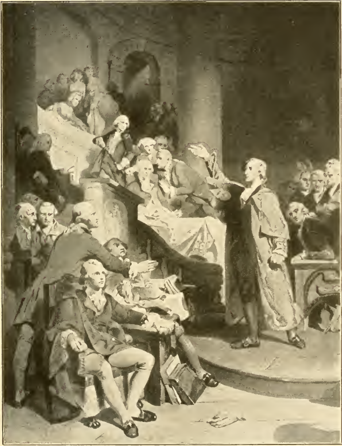
Patrick Henry before the House of Burgesses