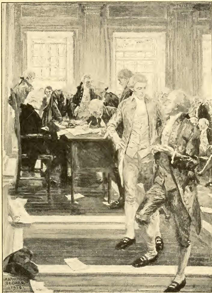
The signing of the Declaration of Independence, July 4, 1776, at Philadelphia