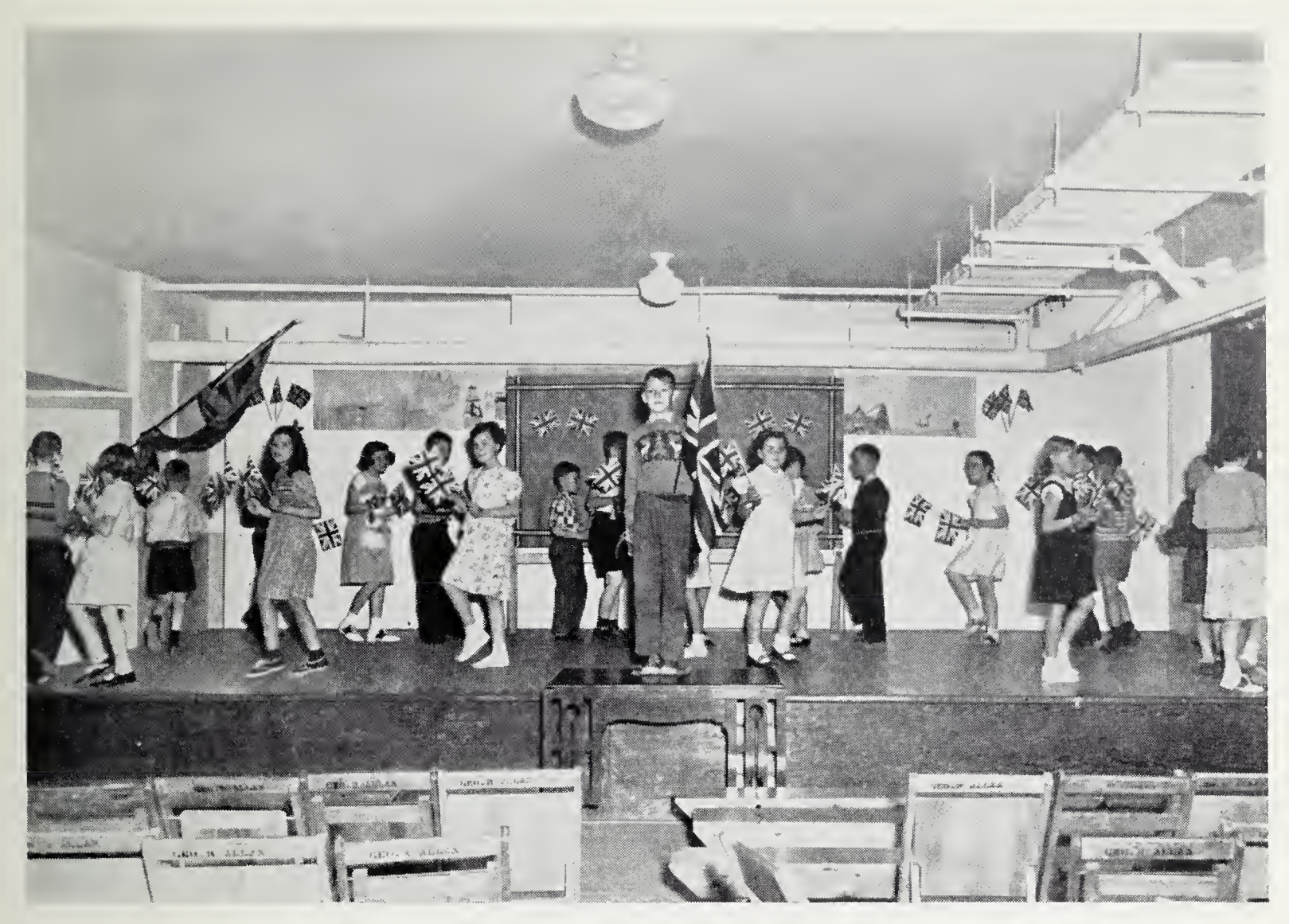
Grade II. Flag Drill.