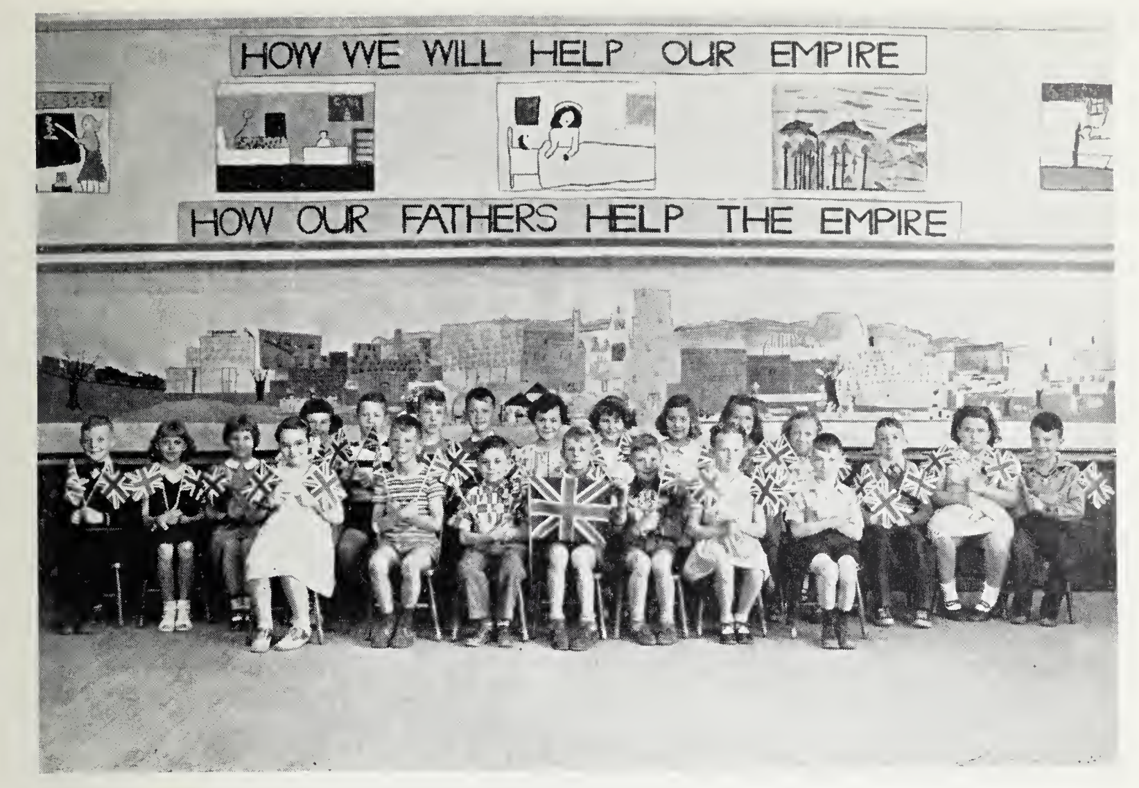
Ungraded Primary Class. "A Free Neighbourhood in the British Commonwealth of Nations."