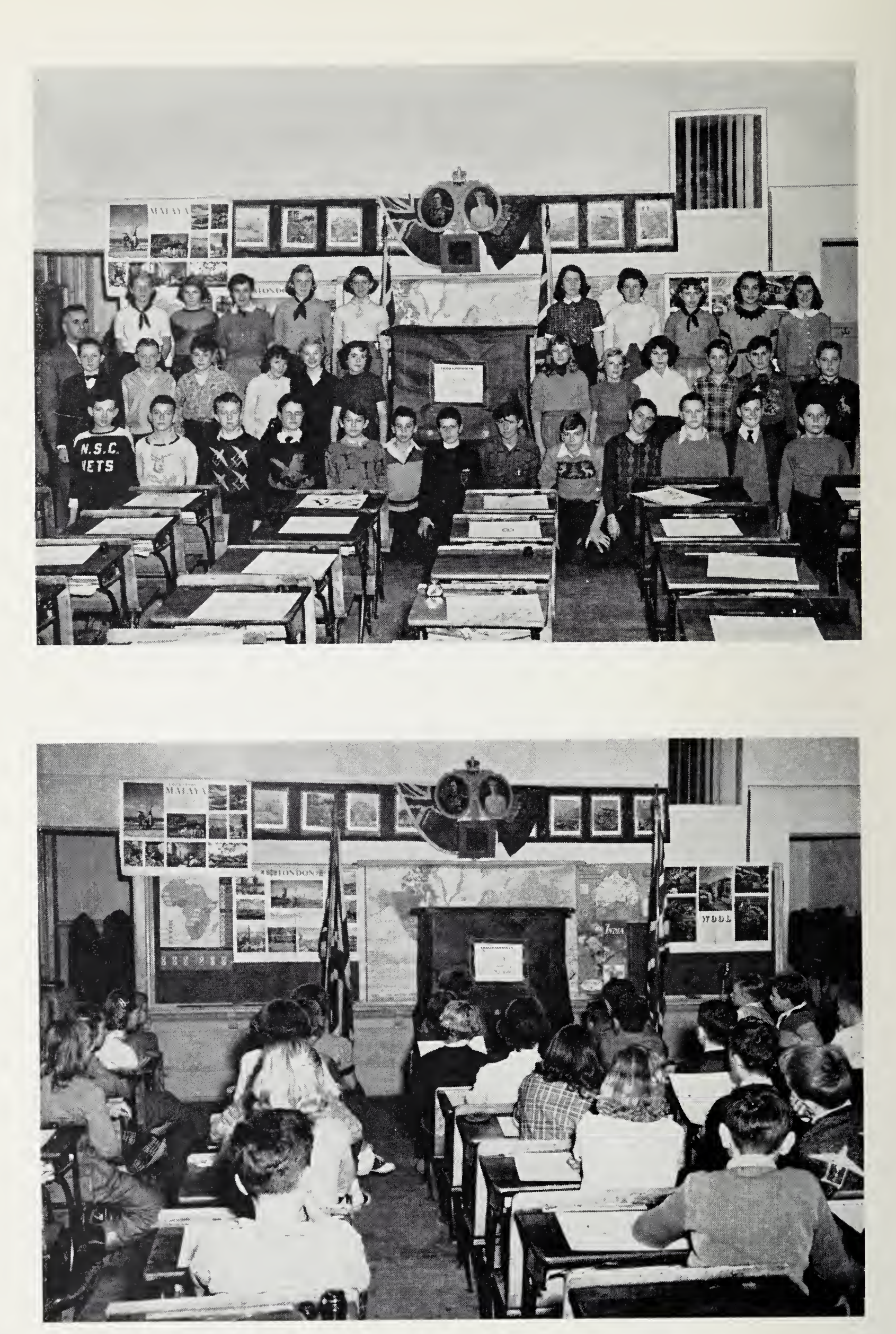
Grade VII. "The British Commonwealth Calling the World."