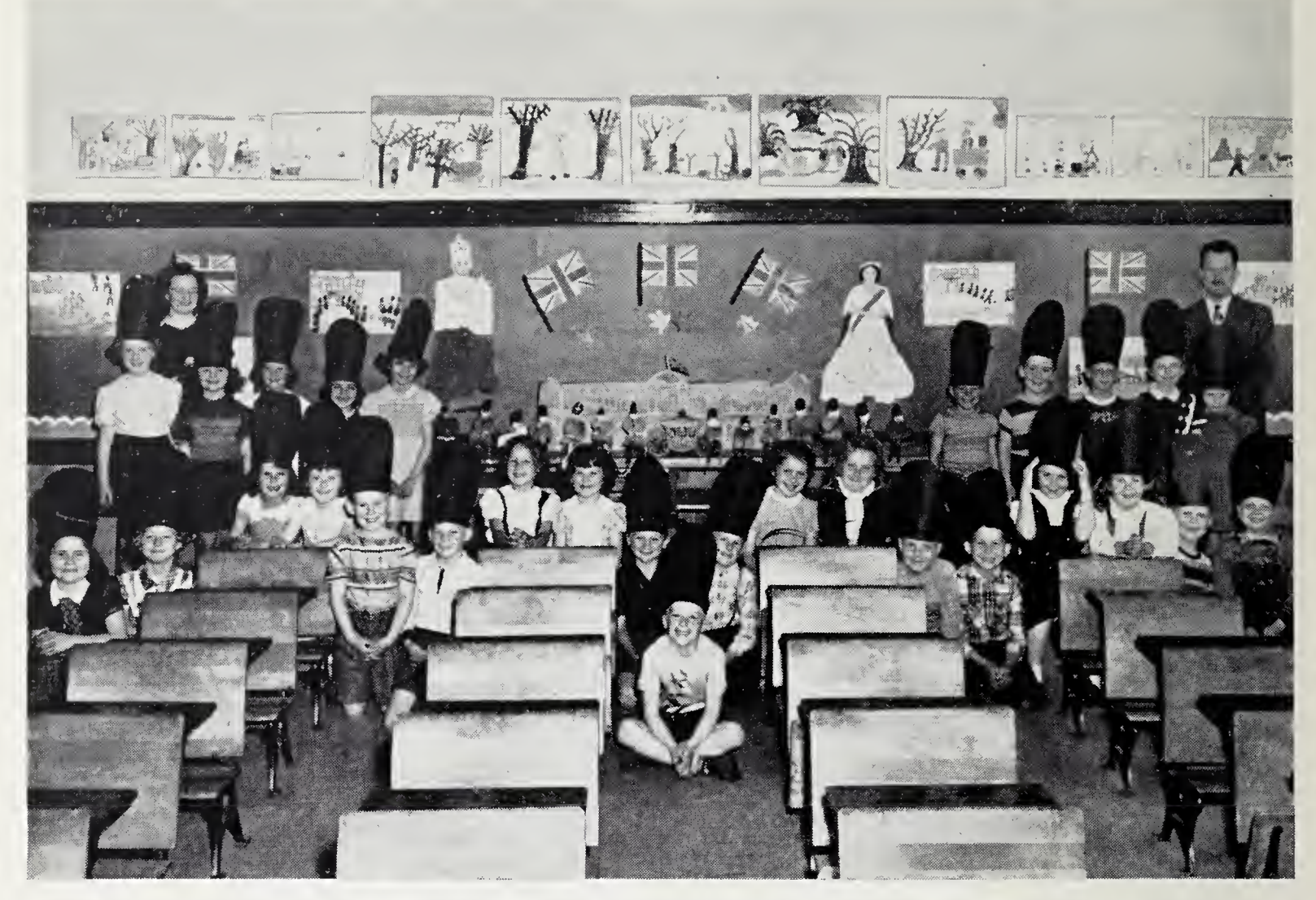
Grade I. Choral Speaking Choir.