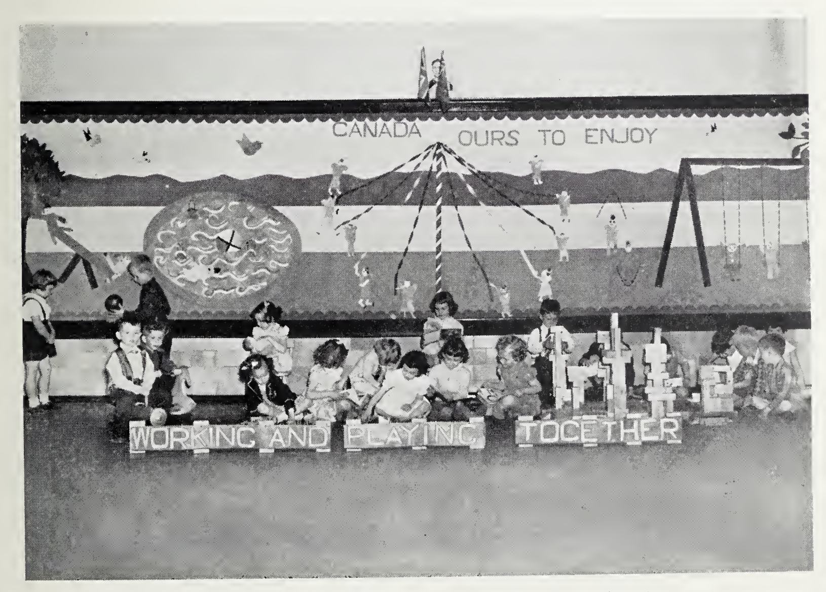
Kindergarten. "Good Citizens at Work and Play."