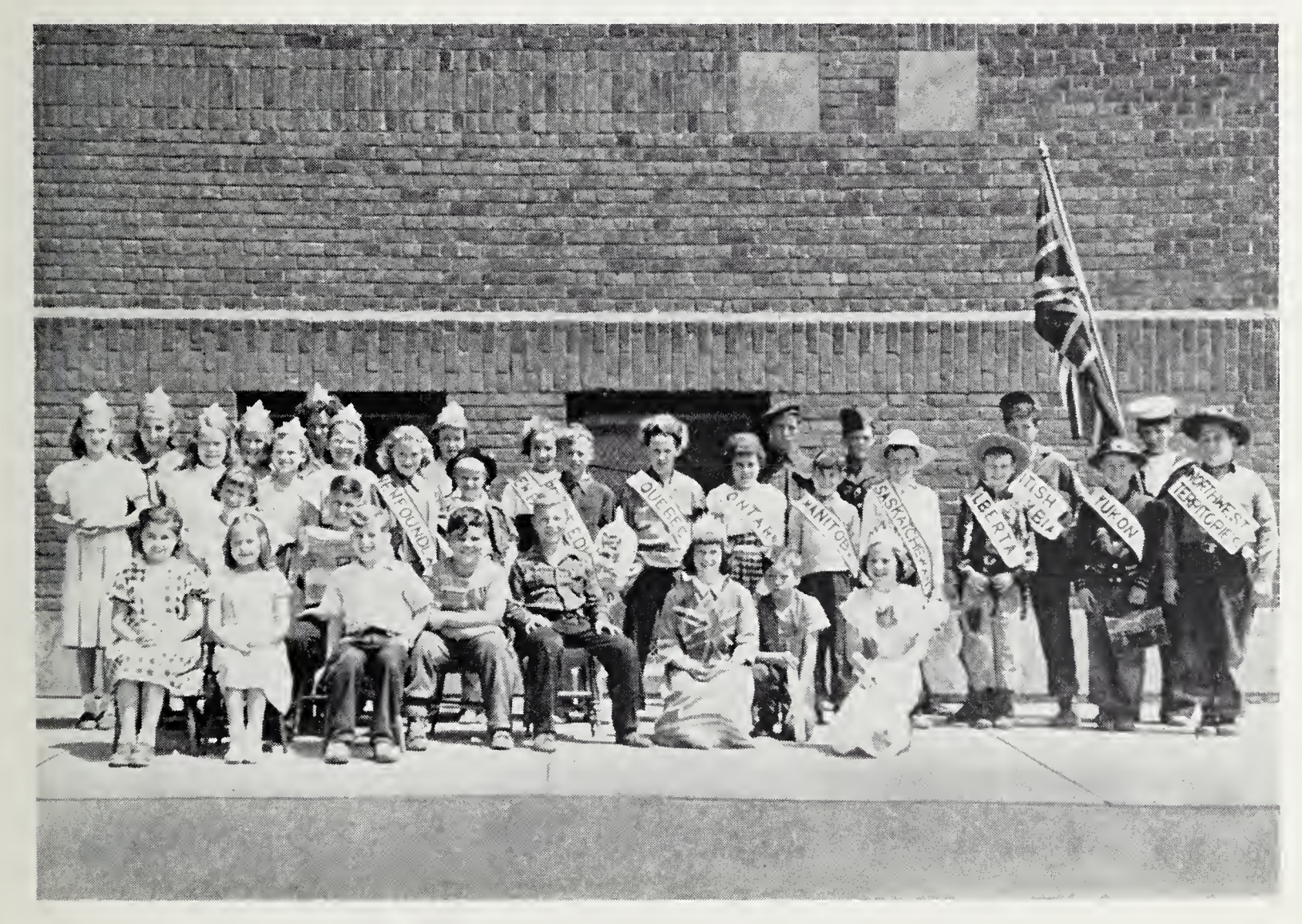
Junior Grades. "Canada's Gift to the Empire."