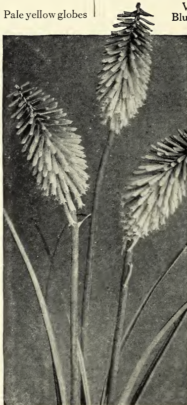
Tritoma, Royal Standard

VINCA minor alba. White Periwinkle. This variety of Vinca is just like the well-known blue-flowering Periwinkle, except that it has white flowers. It is very attractive when used as a ground-cover in groups between the blue-flowering variety. 35 cts. each, $3 for 10, $25 per 100.