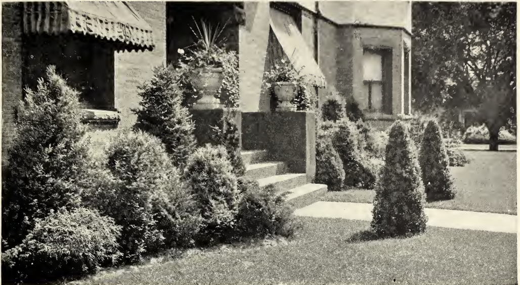
Effect obtained by planting B. & A. Evergreens