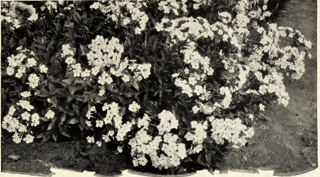
Phlox, Arendsi Hybrids

Papaver orientale , Mahogany. Darkest of the Oriental Poppies. The large flowers are deep carmine-purple—almost like the color of mahogany wood. A very odd variety. 2½ ft. May, June. 50 cts. each, $4.50 for 10.