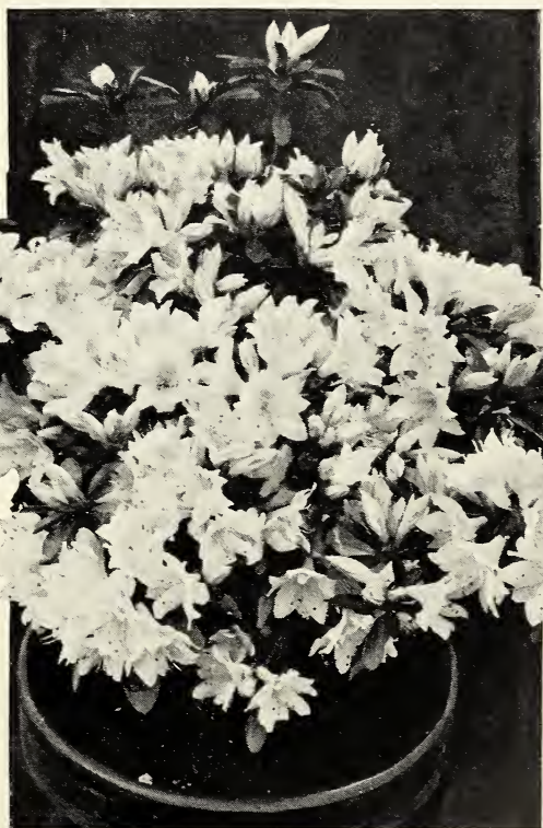
Japanese Kurume Azalea

For a list of varieties, sizes, and prices we refer you to our Evergreen Catalogue .