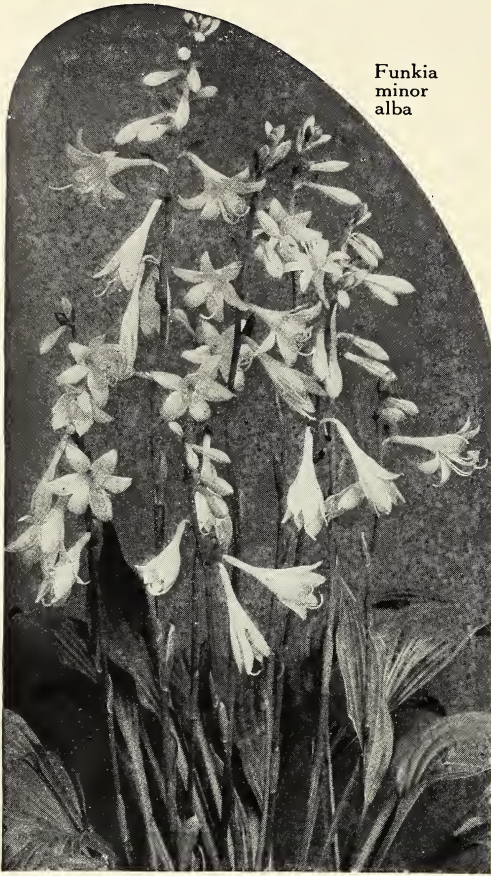
Funkia minor alba