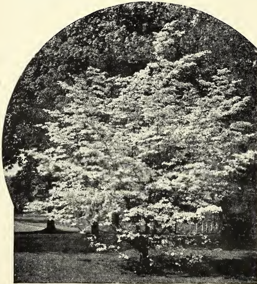
Cornus florida rubra

CORNUS florida rubra. Red-flowering Dogwood. Like the white variety, it is a shrub or sometimes a small tree with wavy foliage, glaucous underneath. On account of its pinkish red flowers, it is indeed a real acquisition for specimen planting or in groups. 5 to 6 ft., $12.50 each.