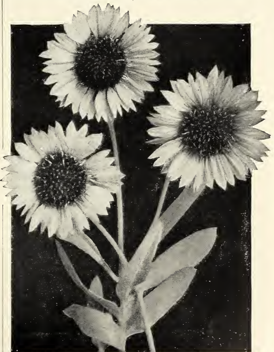
Gaillardia, Tangerine. See page 4

H. Hybrids. Similar to H. niger . Robust growers. Flowers in various colors. $1 each, $9 for 10.