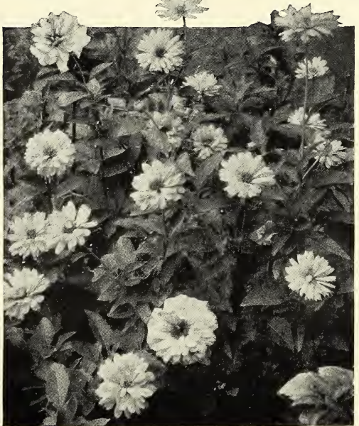
Helioopsis scabra formosa. See page 5

IBERIS, Snowflake. Candytuft. The most beautiful of all Iberis. Forms large cushions with an abundance of wonderful, pure white flower-heads. Indispensable for the rock-garden and a wonderful border plant. There is no better Iberis on the market. 2 ft. April, May. 50 cts. each, $4.50 for 10, $40 per 100.