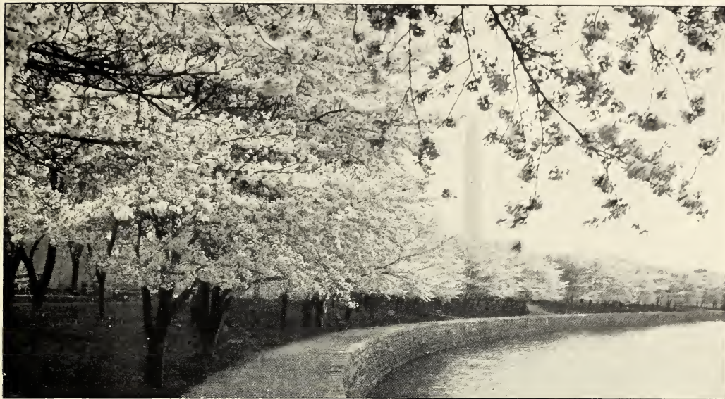
Japanese Flowering Cherries (Prunus)