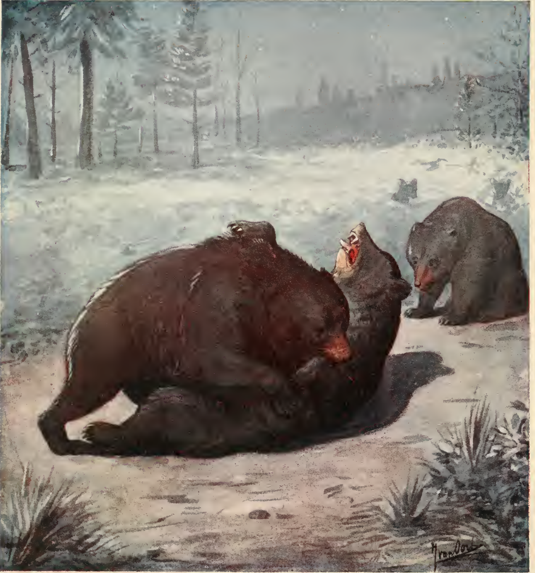
FROM THE MOMENT I THREW MYSELF ON HIM HE NEVER HAD TIME TO BREATHE.