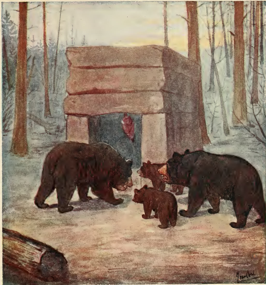
IT WAS EVIDENTLY A TRAP.