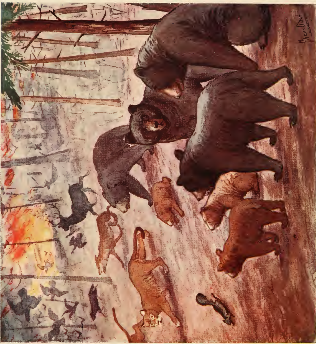
THE FATHER BEAR ASKED MY FATHER IF WE WERE NOT GOING TOO.