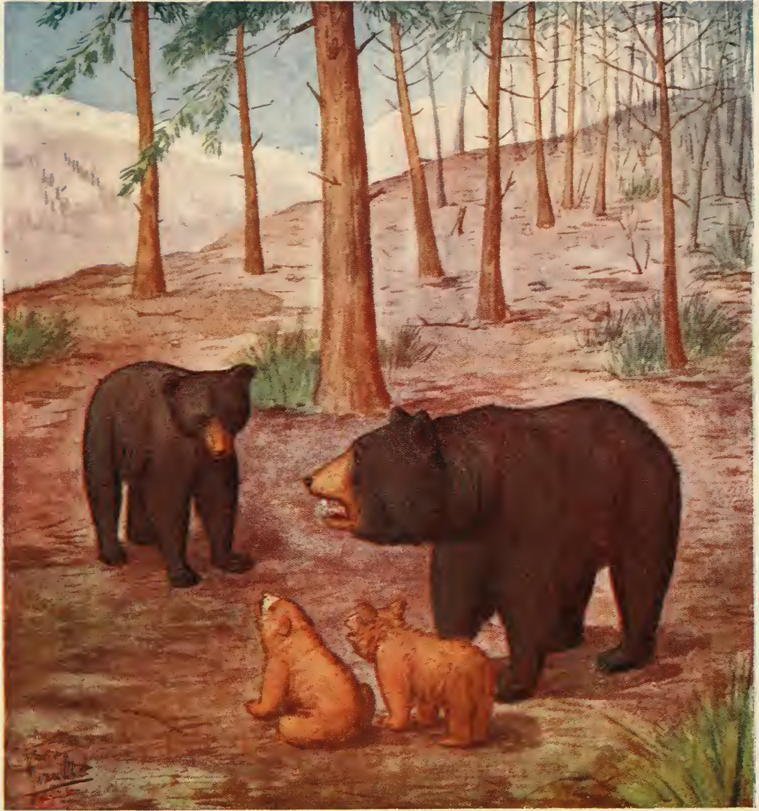
AS I APPEARED THE YOUNG ONES RAN AND SNUGGLED UP TO HER.