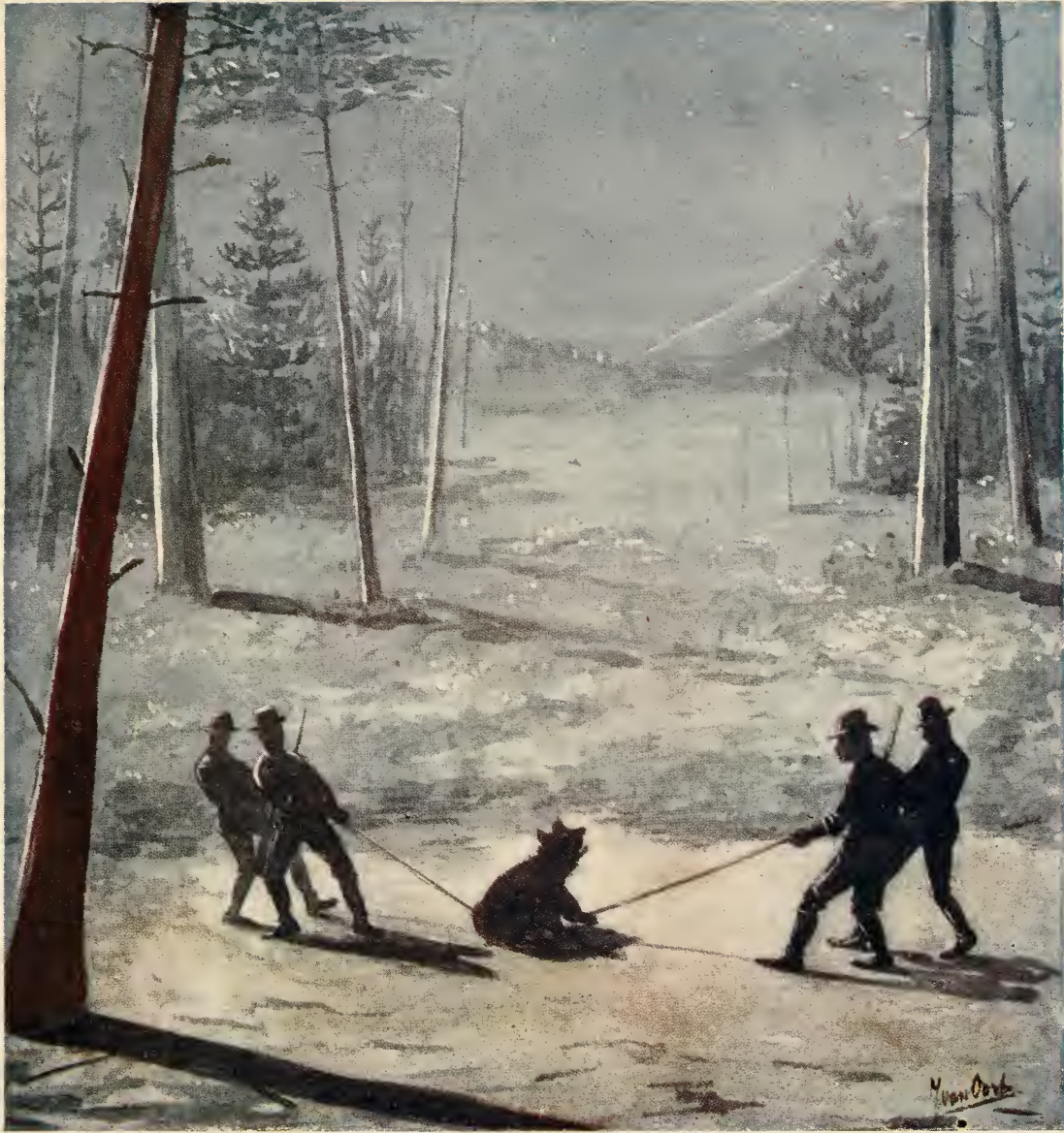
SLOWLY, YARD BY YARD, SHE WAS BEING DRAGGED AWAY FROM US.

11 12 13 14 15 16 17 18 19 20 21 22 23 24 25 26 27 28 29 30 31 32 33 34 35 36 37 38 39 40 41 42 43 44 45 46 47 48 49 50 51 52 53 54 55 56 57 58 59 60 61 62 63 64 65 66 67 68 69 70 71 72 73 74 75 76 77 78 79 80 81 82 83 84 85 86 87 88 89 90 91 92 93 94 95 96 97 98 99 100