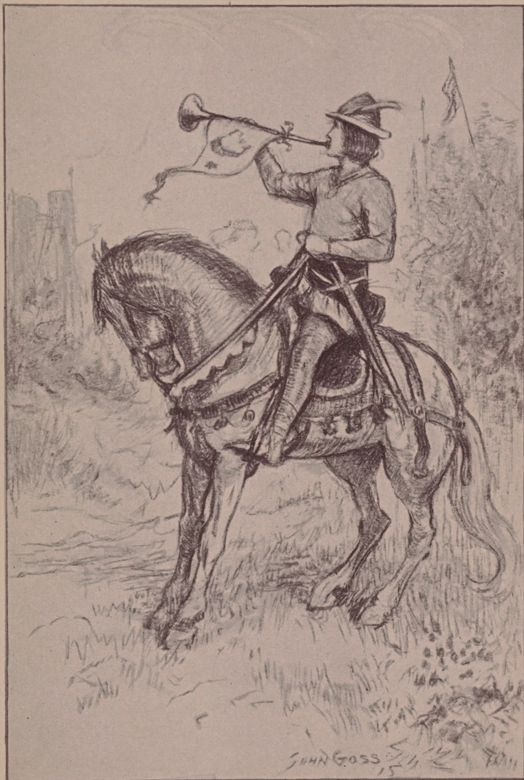
“BLOWING SHORT, SHARP BLASTS ON A TRUMPET.”