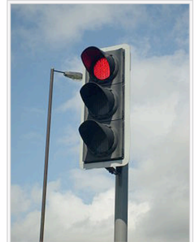
An LED traffic light in Portsmouth, England .

The first electric traffic light was developed in 1912 by Lester Wire , an American policeman of Salt Lake City, Utah , who also used red-green lights. [7] On 5 August 1914, the American Traffic Signal Company installed a traffic signal system on the corner of East 105th Street and Euclid Avenue in Cleveland, Ohio . [8][9] It had two colors, red and green, and a buzzer , based on the design of James Hoge , to provide a warning for color changes. The design by James Hoge [10] allowed police and fire stations to control the signals in case of emergency . The first four-way, three-color traffic light was created by police officer William Potts in Detroit, Michigan in 1920. [11]