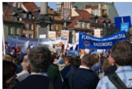
Platforma Obywatelska gathered the most supporters, demanding new parliamentary elections.

No less than three major political demonstrations took place in Warsaw, the capital of Poland on Saturday, October 7. In total, more than 20,000 people flooded the streets and squares of the city to express either their dissatisfaction with or support for Jarosław Kaczyński's government, marred by a political corruption scandal and inability to