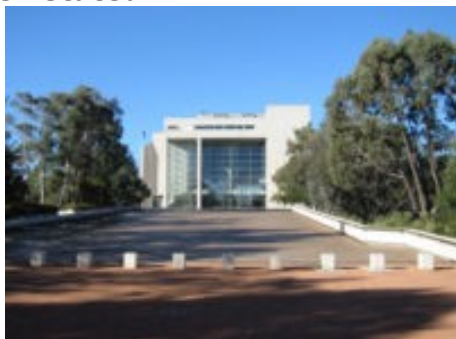
Short-term prisoners were reinstated the right to vote at federal elections by the High Court of Australia today

The High Court of Australia has overturned legislation enacted by the Howard government last year which banned all gaol inmates from voting at federal elections. The court ruled by majority that the previous legislation which banned only those serving sentences longer than three years would remain.