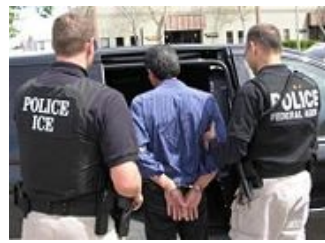
Undated photo of federal officials making an arrest.

Roughly 160 Illegal immigrants were arrested when federal authorities raided a chicken plant in Fairfield, Ohio. US Immigration and Customs Enforcement confirms a Search warrant was conducted Tuesday, however, they made no arrests.