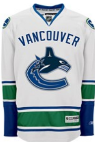
The Vancouver Canucks new away jersey

The Vancouver Canucks, hockey team to Vancouver, British Columbia, unveiled its new home and away uniforms today. Keeping the trademark Orca, the jersey has remixed the colors as well as adding a green stripe for both the home and away uniforms. This is the 5th jersey the team has gone through since 1970 when the team was founded.