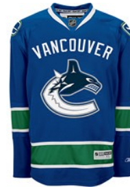
The Vancouver Canucks new home jersey