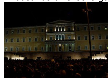
Protest in front of the parliament building

Thousands of Greeks gathered last night in Syntagma square in front of the parliament building in Athens to protest over the political