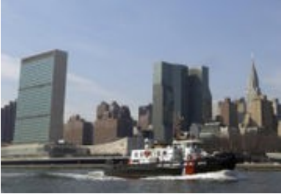
The United Nations Headquarters building.

were not in danger saying, "There is no immediate risk or danger." However, the U.N. Monitoring, Verification and Inspection Commission (UNMOVIC) building was evacuated, according to federal authorities.