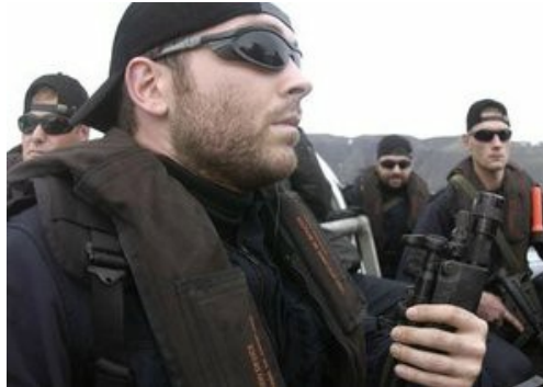
Members of a Canadian naval boarding party during a sovereignty exercise in the Canadian Arctic.

submarines passing though Canadian waters without obtaining the permission of -- or even notifying -- the Canadian government."