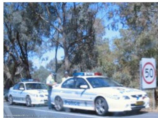
A pair of NSW Police Highway patrol vehicles near Albury

In an attempt to keep the number of deaths on NSW roads at a minimum police will target speeding, seatbelt, helmet and drink driving offences. According to the New South Wales Roads and Traffic Authority, 495 people have died on NSW roads between January 1 and December 11. This figure will surely climb over the holiday period.