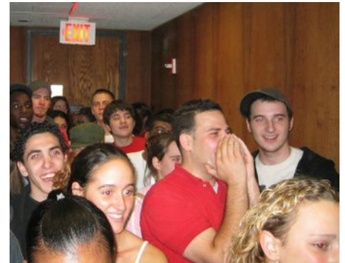
Southern end of the hall