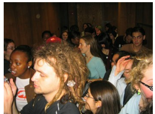
Northern end of the hall

The HAB office of Public Affairs responded to inquires by the Mid-Hudson News, saying,