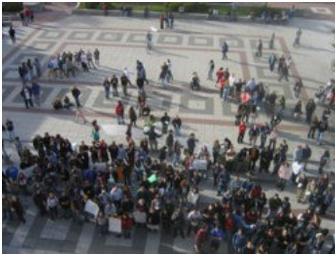
Students gather at Student Union Building west concourse.

from the rooftop to rally the gathering on the concourse below. University police dispersed student leaders from the roof which was followed by more than 100 students storming the Haggerty Administration Building (HAB).