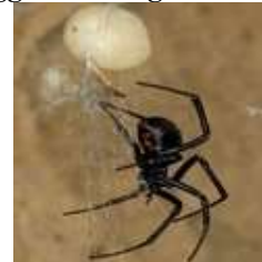
Black widow spider (Lactrodectus hesperus) and egg sac.