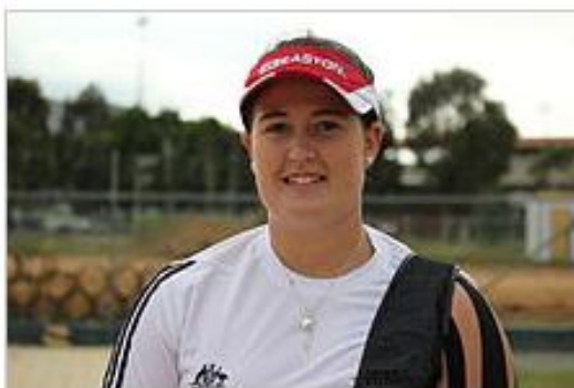
Ingleby at the Championships

When including an image on Wikinews, the photographer must always be credited. This is done by {{image source|PHOTOGRAPHER}} in the image description. The text on the right renders the properly formatted image on the right.