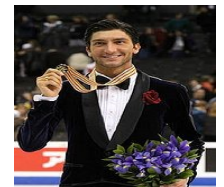
Evan Lysacek holds his gold medal during the men's medals ceremony at the 2009 World Figure Skating Championships.

Residents of the Chicago suburb of Naperville, Illinois celebrated Evan Lysacek Day last Friday. Held in honor of the gold medalist in figure skating at the 2010 Vancouver