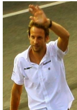
Jenson Button at Singapore.

McLaren driver Jenson Button won yesterday's FIA Formula One 2010 Qantas Australian Grand Prix on the Melbourne Grand Prix Circuit at Albert Park, Melbourne, Australia. Button placed fourth behind both Red Bull cars and Alonso's Ferrari, but took