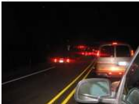
Line jumpers driving on wrong side of road, who were later pulled over by the police.

The obvious express routes slowed to a crawl. Some drivers reported easy travel on rural roads, while others encountered heavy traffic on two-lane highways. Constantly during the evacuation on two-lane highways, people would take over the other lanes, causing some head-on collisions. Even when the line jumpers didn't get in a wreck, they still slowed the flow of traffic because they had to merge back into the right lane at some point. The general attitude towards these cheaters was very hostile. Curses and hand signals were exchanged. To stop the cheaters, cars would swerve in front of those who tried to pass or not let them merge back in line, often causing an accident, or at least causing a backup in the lane of oncoming traffic. Sometimes blockers would occupy the shoulder as well as the lane to stop them cutting back into the line.