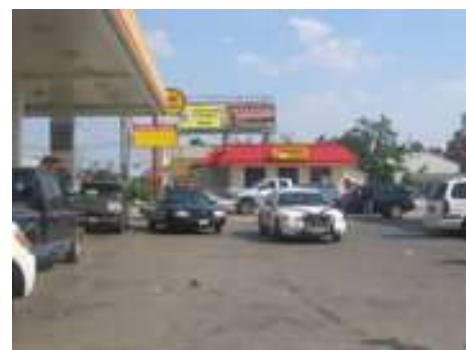
Police supervised 2 hour wait in line at gas station.

Before Hurricane Rita arrived, cars idling for hours in traffic jams near Houston began running out of gas, stranding evacuees in their cars.