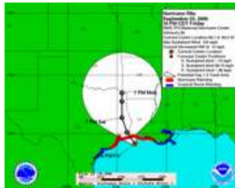
Path forecast 5 hours before landfall.

Rita is expected to produce rainfall accumulations of 8-12 inches, with the storm slowing down and producing a total of as much as 25 inches across eastern Texas and western Louisiana. Bursts of tropical storm winds and rainfall amounts of 3-5 inches are possible in New Orleans.