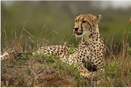
Female cheetah

According to the study's authors, the habitat preservation strategy that can be so effective in other species does not work on cheetahs because of their wide range. About 77% of wild cheetah's ranges are outside protected areas. According to Cheetah Conservation Project Zimbabwe, Zimbabwe's cheetah population dwindled from an estimated 1,500 in 1999 to 150–170 in 2013–2015, a roughly 85% decline. The group based its survey on such resources as photographs, tourist sightings, safari guides, cattle herders, and village chiefs.