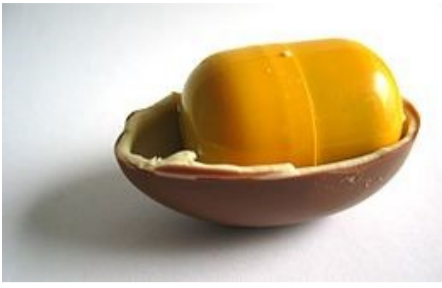
A halved Kinder Surprise chocolate egg, revealing a plastic cannister containing a toy.

In 1974, Kinder Surprise was launched with plastic toys, which are sold within the eggs to surprise children. Due to this, the sale of Kinder eggs is prohibited in the US. A 1938 US law prohibits the sale of food containing objects in its interior. It is also prohibited in Chile, due to an obesity-reduction law brought in last year. Last year a three-year-old girl died in France, swallowing the plastic toy.