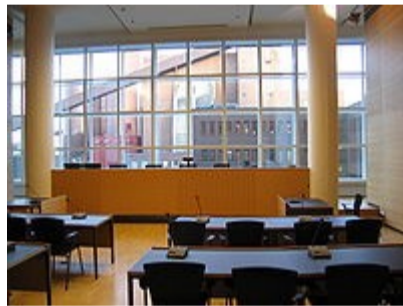
A courtroom at the Helsinki District Court, from file.