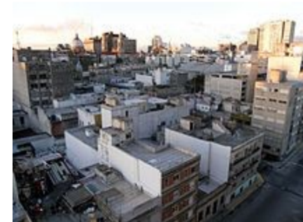
Modern-day Montevideo, from file.

Hardline rule led to protests in 1984, eventually resulting in a fresh democratic election. This was won by