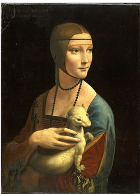
Lady with an Ermine Image: Leonardo da Vinci.

Poland yesterday announced the purchase of the Czartoryski art collection for about €100million (US$105m; £85m). It is worth an estimated €2billion.