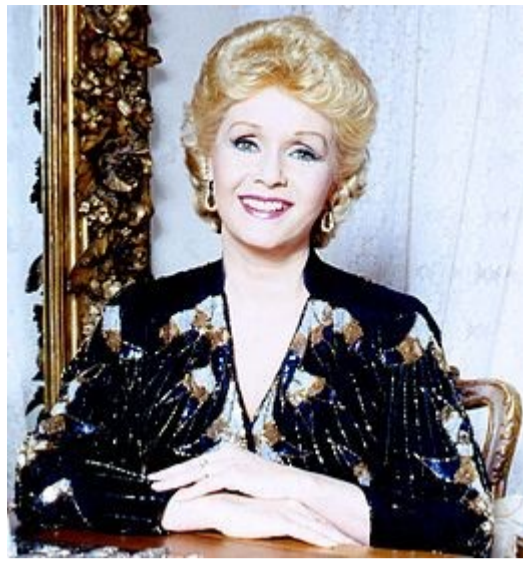
Debbie Reynolds at home in 1987.

Reynolds' credits include lead roles in films Singin' in the Rain , Bundle of Joy , and The Unsinkable Molly Brown , the last of which earned her an Academy Award nomination. She worked to preserve Hollywood history and memorabilia for posterity and, like Carrie Fisher, as an advocate for mental health awareness.