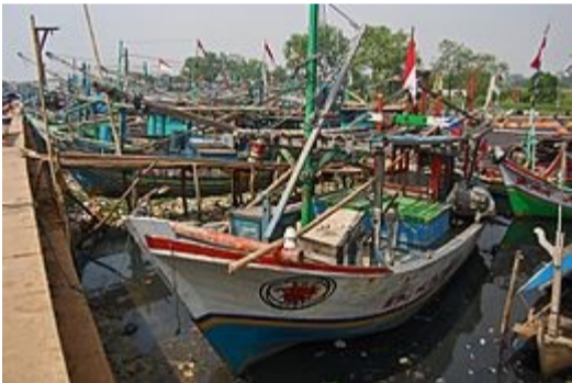
Fishing boats at Muara Angke port, from file.

The Zahro Express caught fire shortly after leaving Muara Angke port in Jakarta. It was heading to Tidung Island, in the Kepulauan Seribu chain. Police said the fire began in the engine area.