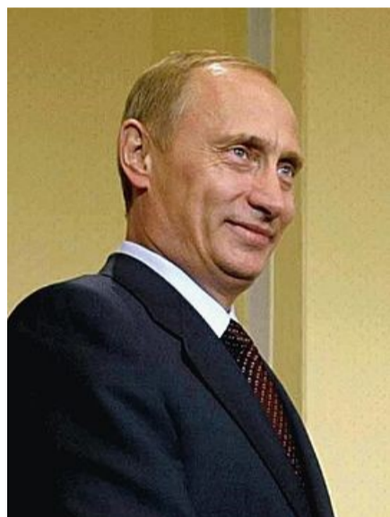
File photo of Vladimir Putin, 2003.

CIA would later name the Russian government responsible. One U.S. intelligence official told Reuters this asymmetrical release of information is why the CIA concluded the goal of the hack was to help Trump win the election rather than simply to disrupt the U.S. electoral process. "Putin believed he would be much friendlier to Russia, especially on the matter of economic sanctions," said another. The U.S. State Department issued a statement saying the expulsions were also in retaliation for harsh treatment of U.S. diplomats in Russia, citing police stops, assaults, and the public disclosure of their personal information on television.