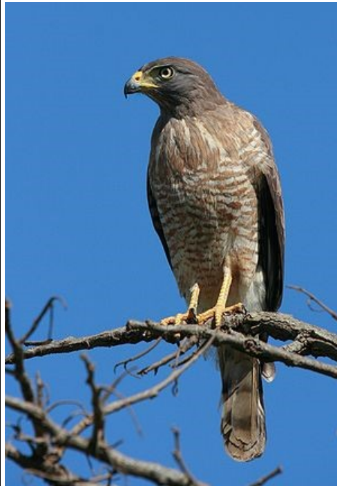
A Roadside Hawk perched in a tree in Goiás, Brazil.