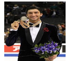
Evan Lysacek holds his gold medal during the men's medals ceremony at the 2009 World Figure Skating Championships.

Residents of the Chicago suburb of Naperville, Illinois celebrated Evan Lysacek Day last Friday. Held in honor of the gold