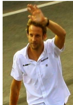
Jenson Button at Singapore.

McLaren driver Jenson Button won yesterday's FIA Formula One 2010 Qantas Australian Grand Prix on the Melbourne Grand Prix Circuit at Albert Park, Melbourne, Australia. Button placed fourth behind both Red Bull cars and Alonso's Ferrari, but took