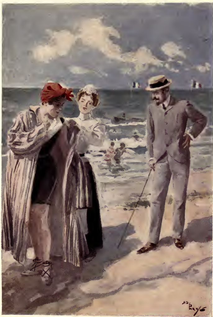
He had an eye, this Monsieur Diderot, and her contours satisfied it.