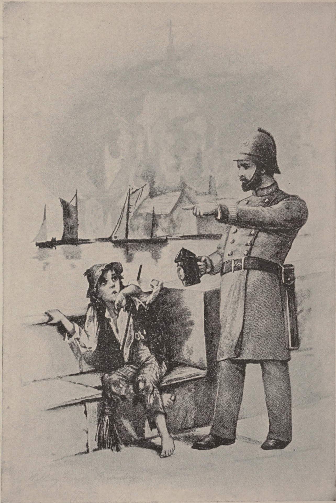
JO AND THE POLICEMAN. "I'm always a moving on."