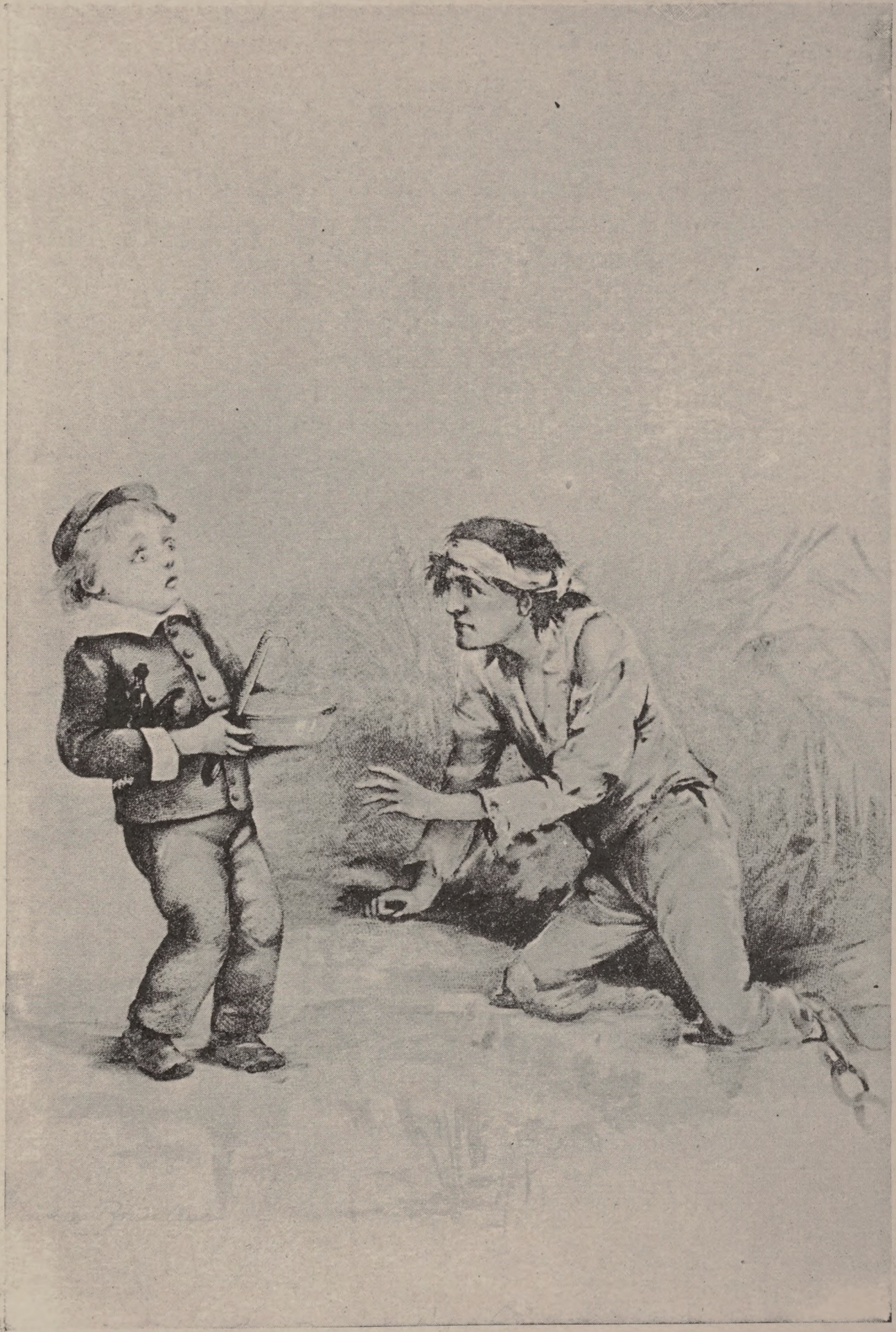
PIP AND THE CONVICT.