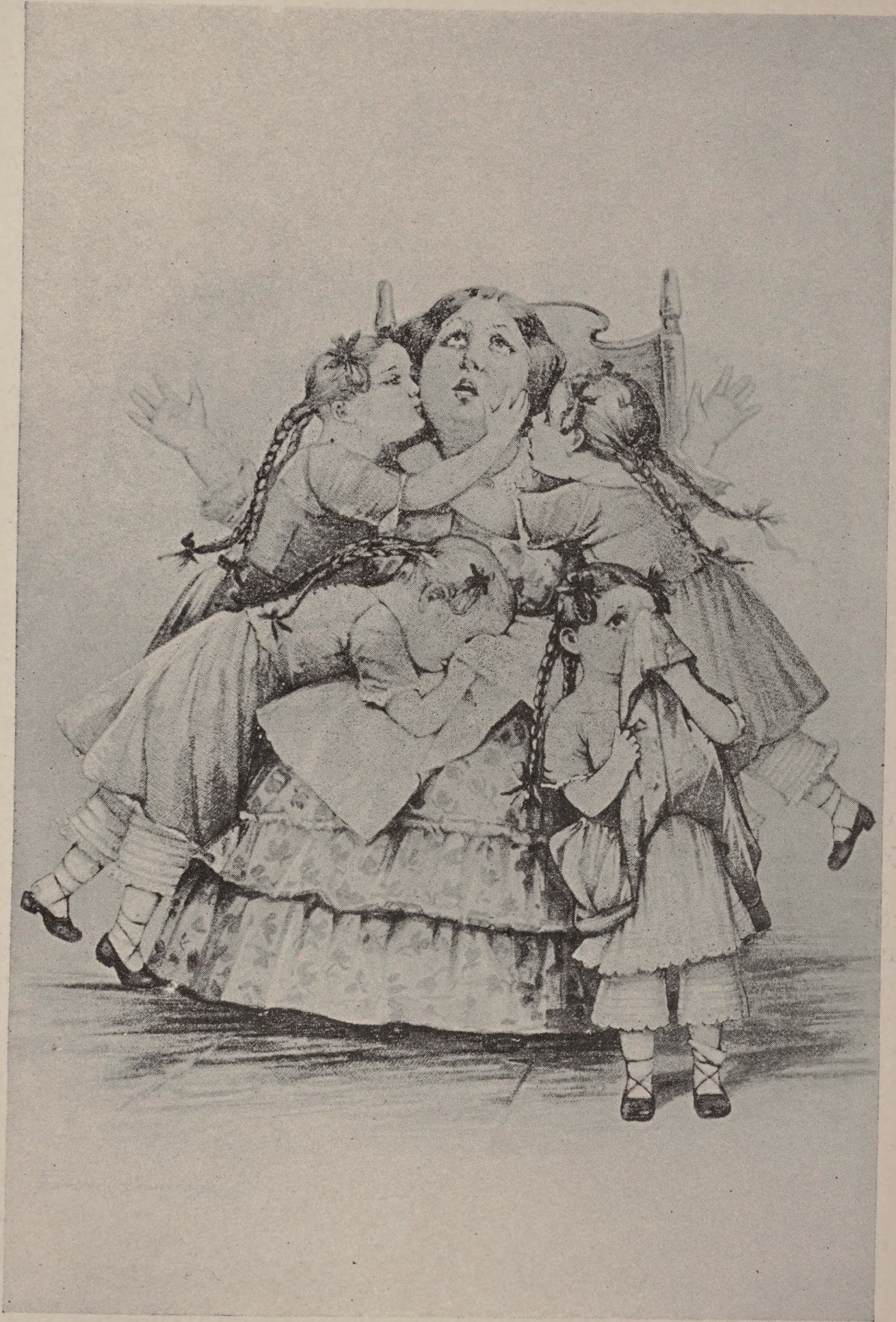
THE LITTLE KENWIGS. "They are so beautiful."