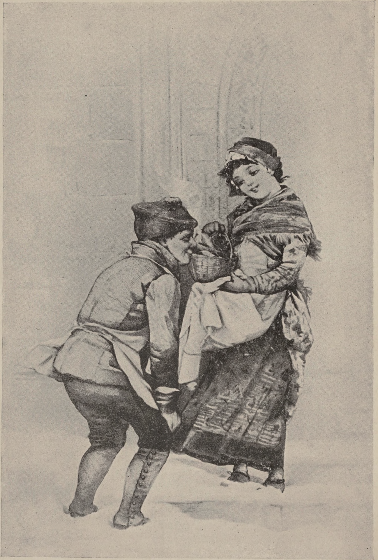
TROTTY VECK'S DINNER.

"Toby took a sniff at the edge of the basket."