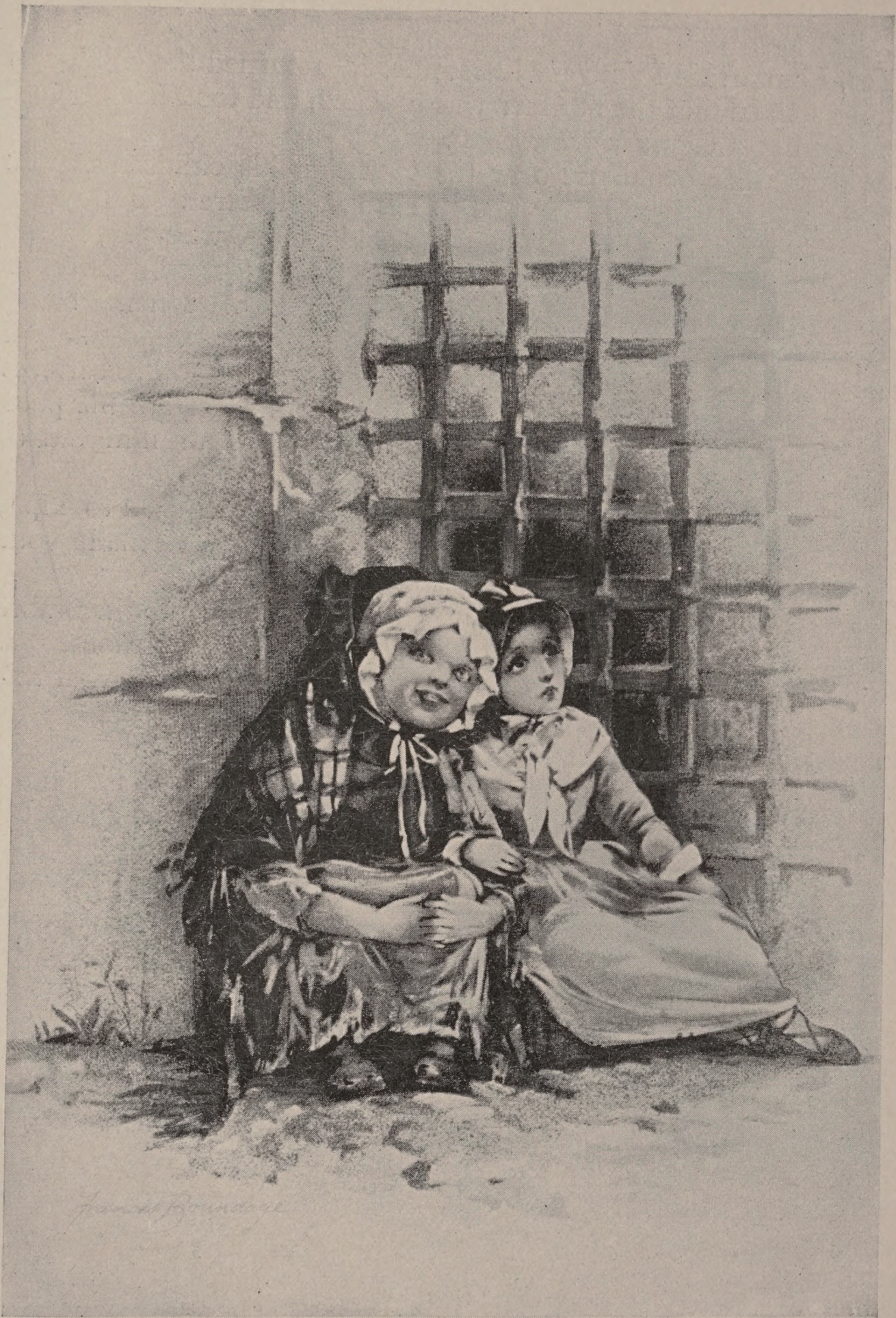
LITTLE DORRIT AND MAGGIE. "She has never grown older since."