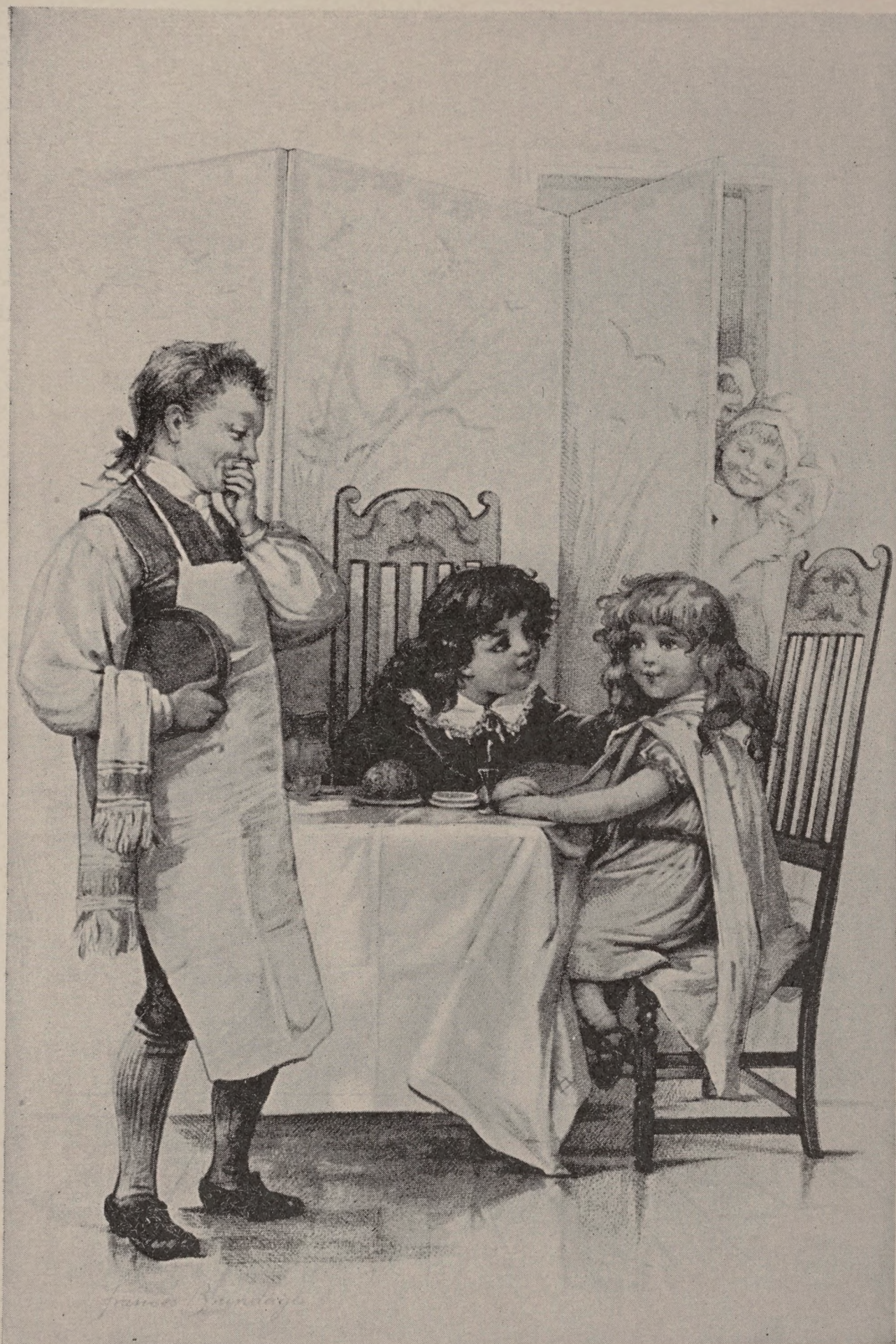
AT THE "HOLLY TREE" INN. "They consulted me at breakfast."