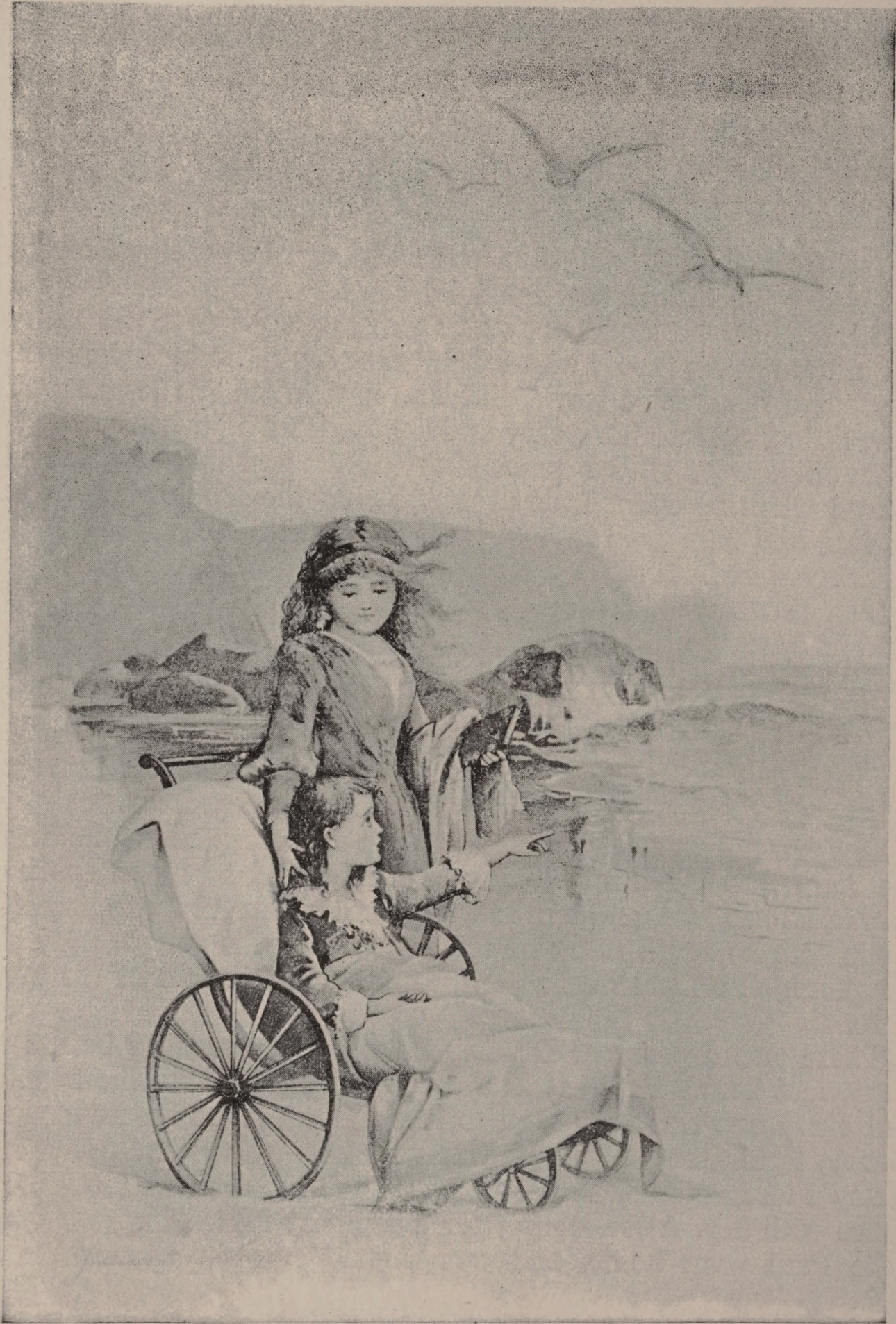
LITTLE PAUL AND FLORENCE. "A little carriage was got for him."