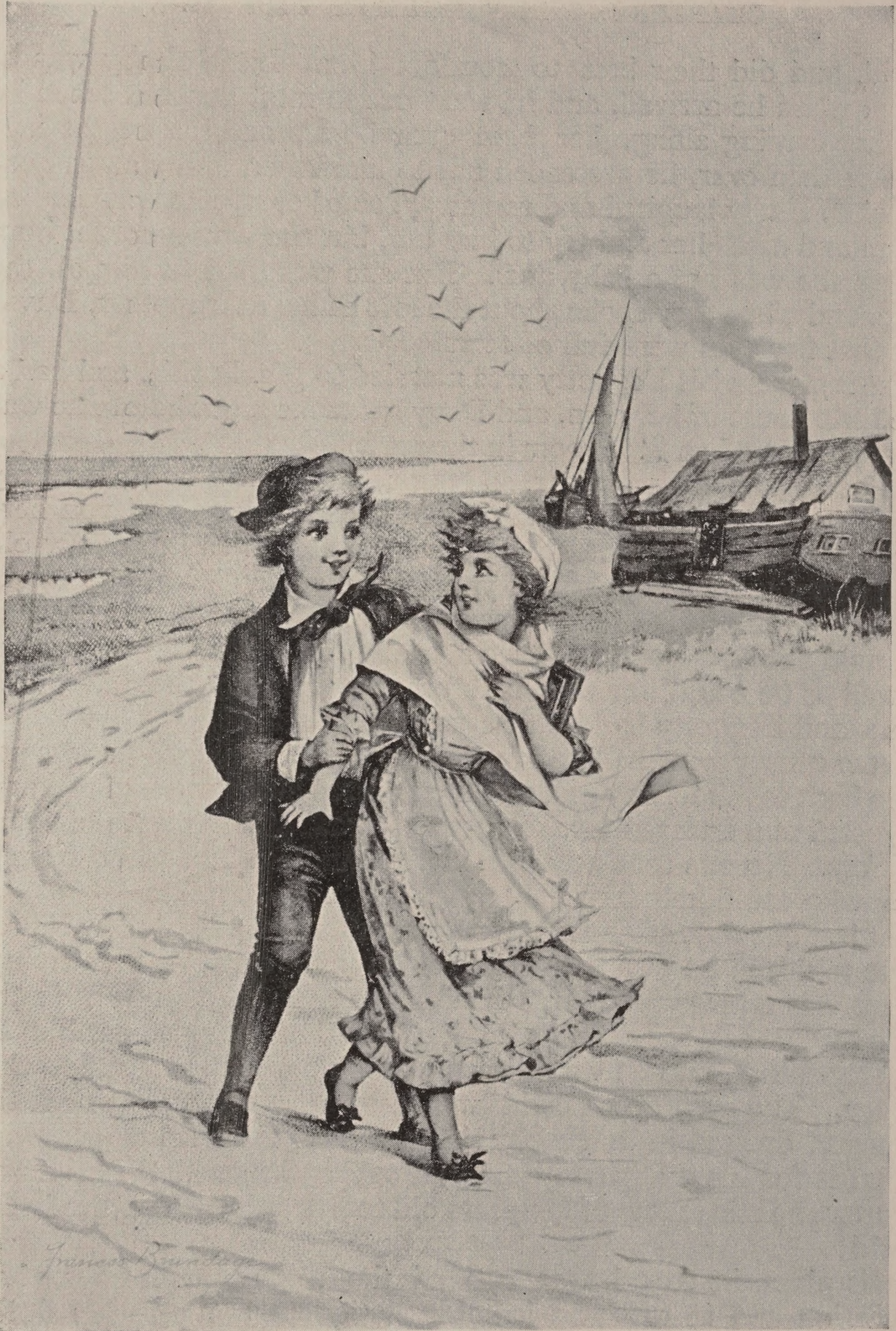
DAVID AND LITTLE EM'LY.