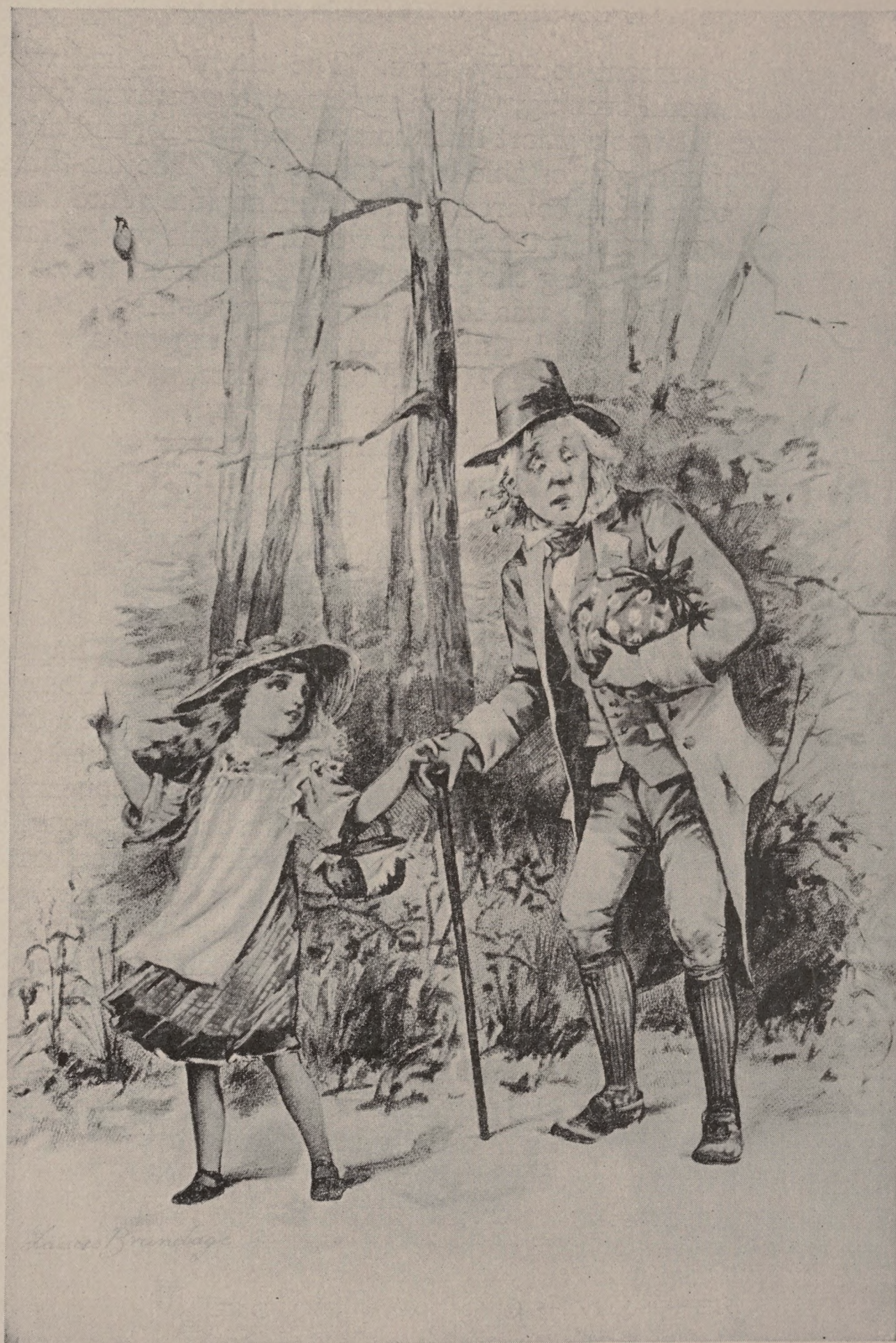
LITTLE NELL AND HER GRANDFATHER. “We will travel afoot through the fields.”