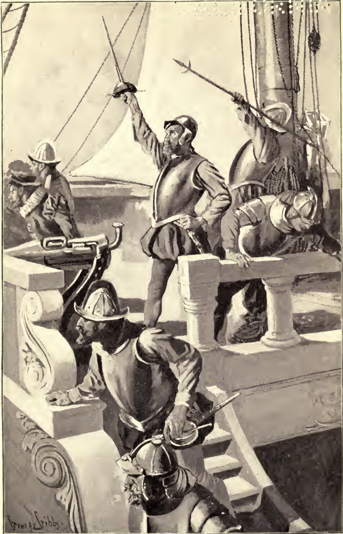
“Swords flashed in the sun.”