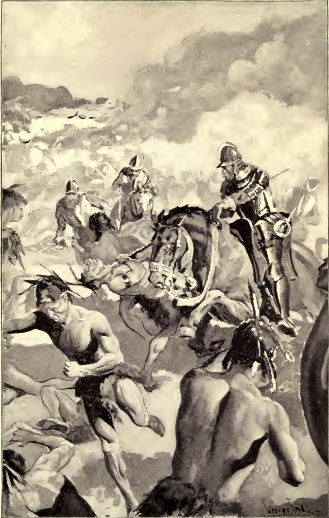
“Back and forth they charged.”