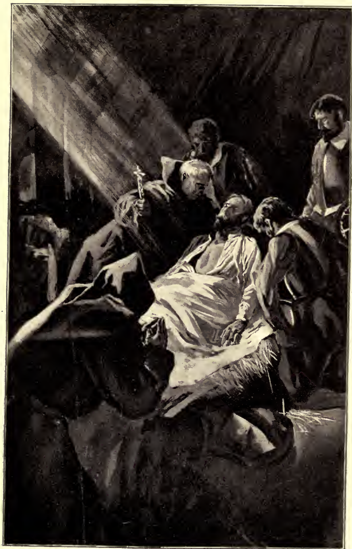
Death of the Adelantado.