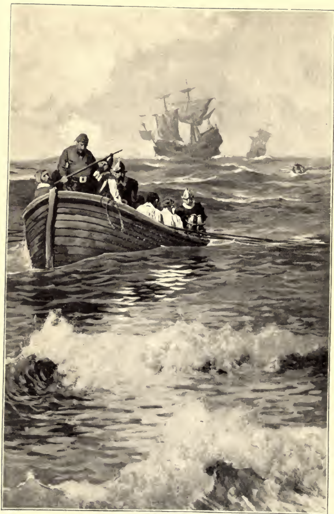
“The caravels had arrived.”