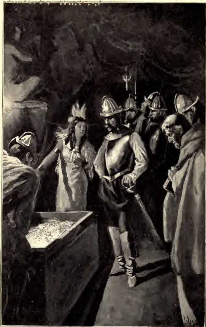
The Lady of Cofachiqui.