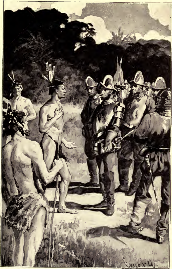
De Soto and Vitachuco.