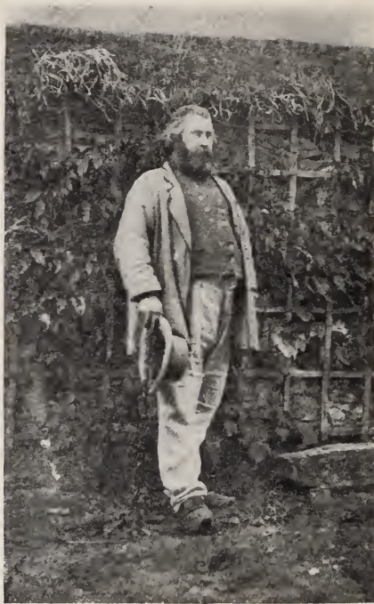
MILLET IN HIS GARDEN