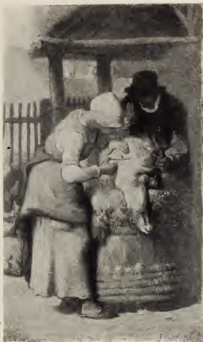
18. SHEARING SHEEP

Before an open, thatched shed, under which hay is stacked, a young woman is shearing a sheep; the sheep lies on the bottom of an inverted tub, its legs firmly held by an old man; the young woman is working cautiously, but has already cut the fleece from the neck and shoulders of the sheep; the man is dressed in blue, with a large hat pulled down over his eyes; the young woman wears a white cap and waist, with a buff-gray sleeveless jacket, and light blue over-sleeves, a red skirt turned up to her waist, showing the drab lining, and a violet-gray underskirt; on the ground behind her lies the sheep whose turn comes next, its legs already tied; the rest of the flock press against the picket fence which separates them from the shearing-place; in the background is a large stone barn, behind which are poplar trees.