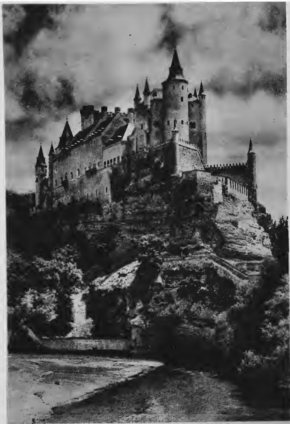
Romantic Towers of the Past—The Alcazar in Segovia.