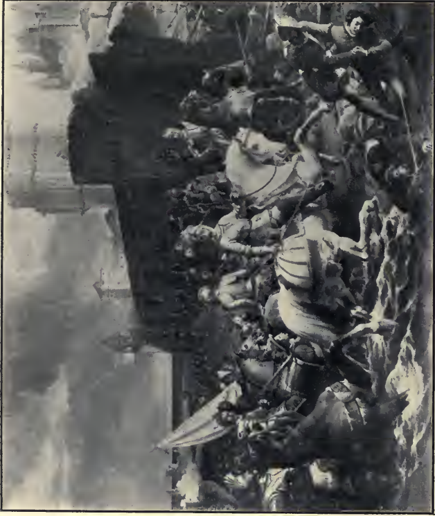
THE DUKE OF GUISE CAPTURES CALAIS. Painting by Picot; Gallery of Versailles.