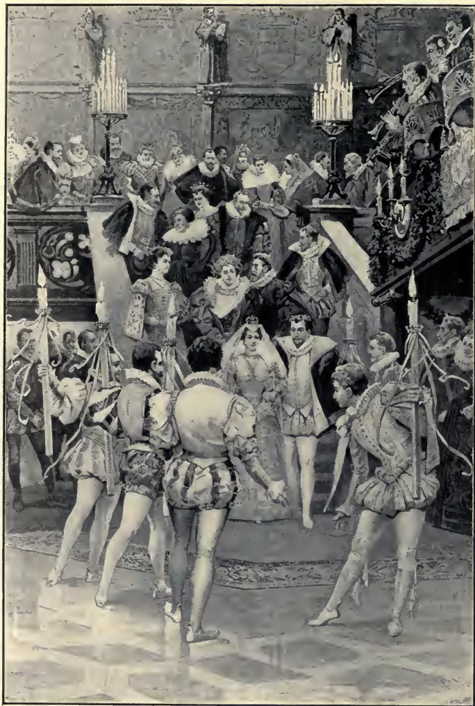
FESTIVITIES AT THE MARRIAGE OF WILLIAM OF ORANGE AND THE PRINCESS ANNA OF SAXONY