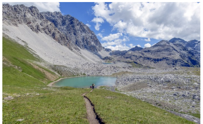
A path near Pfäffikersee.

The External Relations, Public Policy and General Partnerships programme aims to advance the themes of digital and open knowledge in society and politics at the national and international levels while helping Wikimedia CH become a recognised player within the Wikimedia Movement on themes concerning our vision and strategic impact directions. We will participate in working groups and coalitions to advance digital and open-source themes in society and politics while supporting civic action groups with our own knowledge and expertise, as well as that of relevant partners.