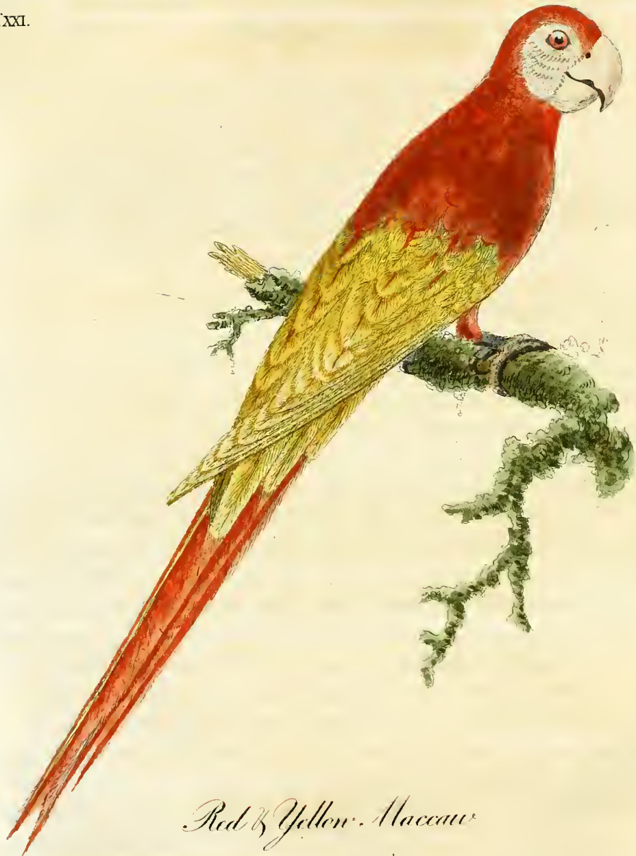
Red & Yellow Macaw