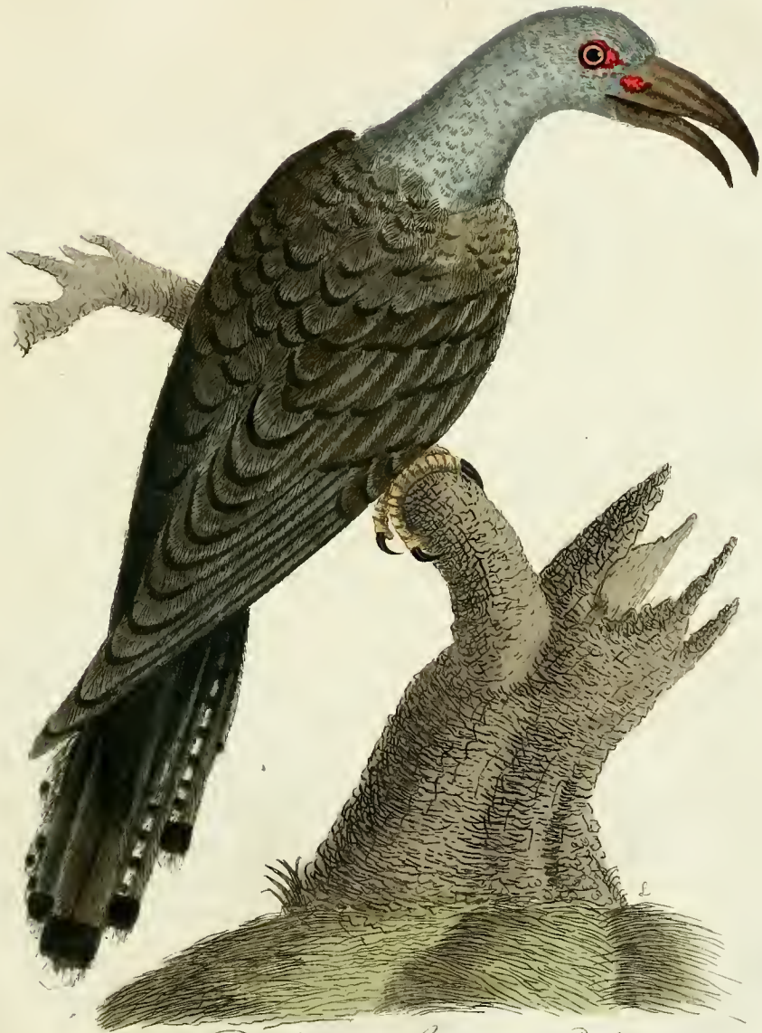
New Holland Channel-Bill.