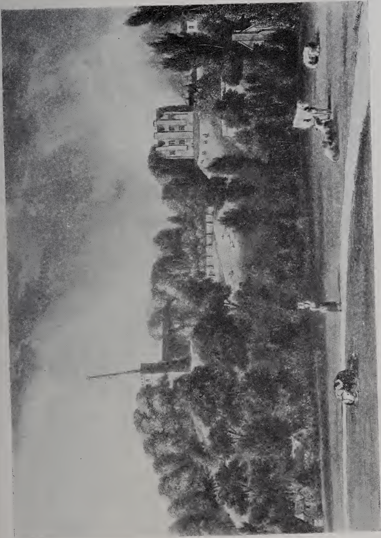
ACKERMANN'S HARROW SCHOOL, 1816