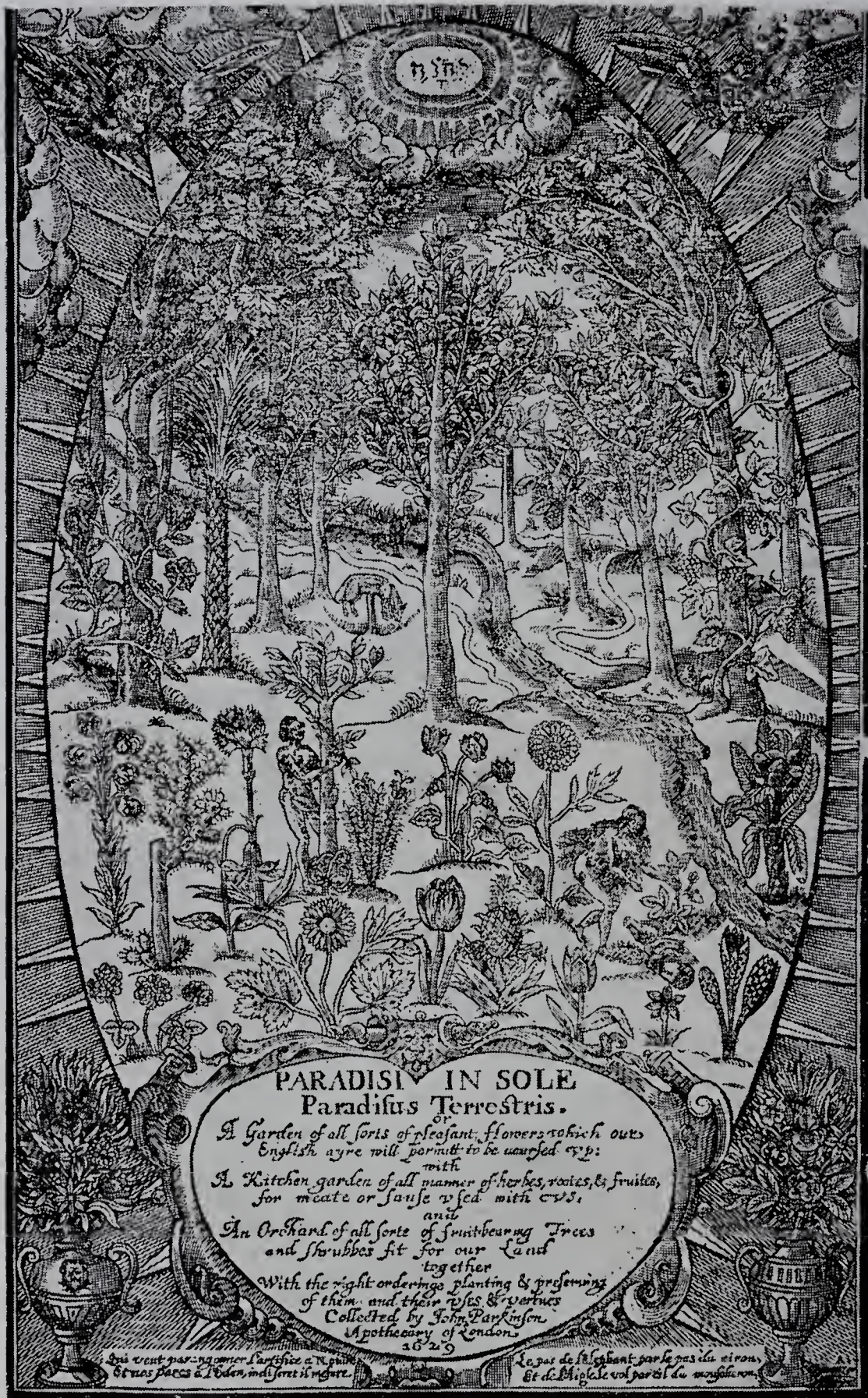
PARKINSON'S PARADISI, 1629