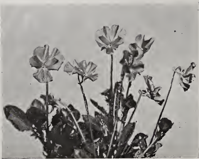
Viola Cornuta, Jersey Gem