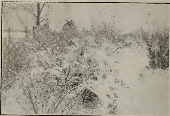
DECIDUOUS SHRUBS IN WINTER