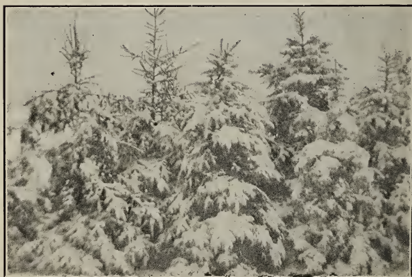
SHELTER--PLANTING OF EVERGREENS

BEDFORD GROWN TREES AND PLANTS SUCCEED EVERYWHERE