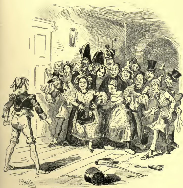
Lorrequer as Postillion.