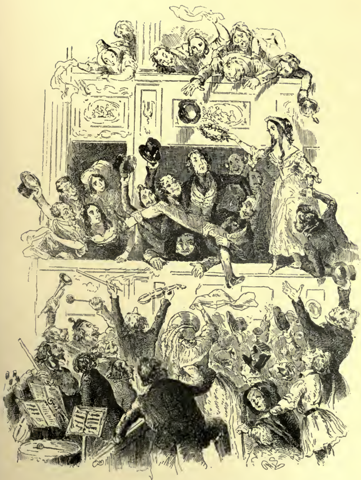
Lorrequer's début at Strasburg.