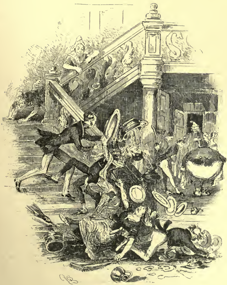
Arrival of the "Chargé d'Affaires."