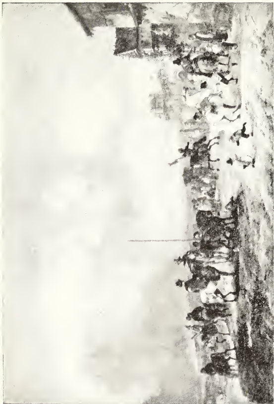
TILTING AT THE CAT (The Hermitage, St. Petersburg)