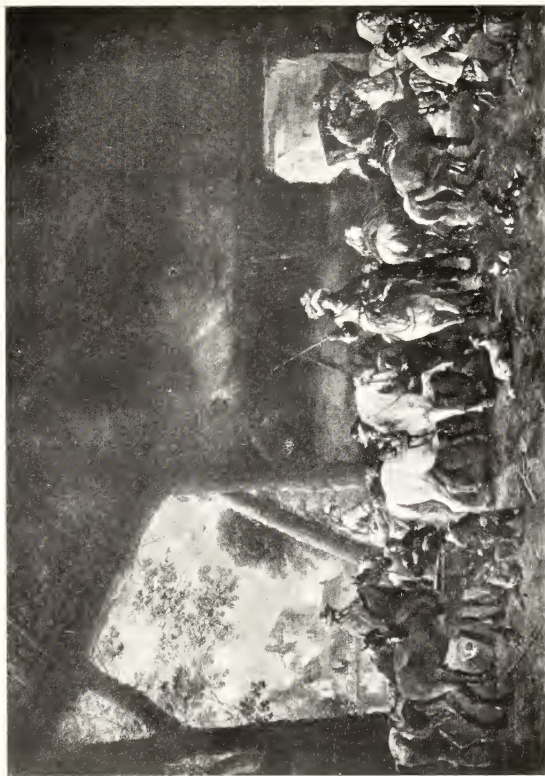
DEPARTURE FROM THE INN (Royal Gallery, The Hague)

DIE ABBREISE VON DER SCHENKE (Haag, Kgl. Gallerie) F. Hanfstaengl, Photo.