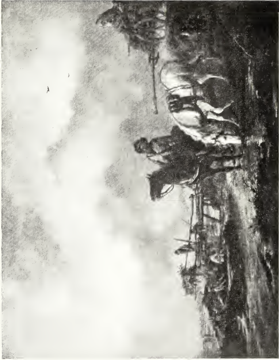
THE WAGGON ( Pinakothek, Munich )