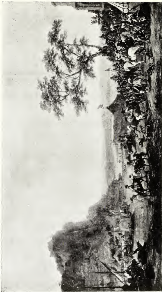
ENCAMPMENT AT RIVER ( Royal Gallery, Dresden )