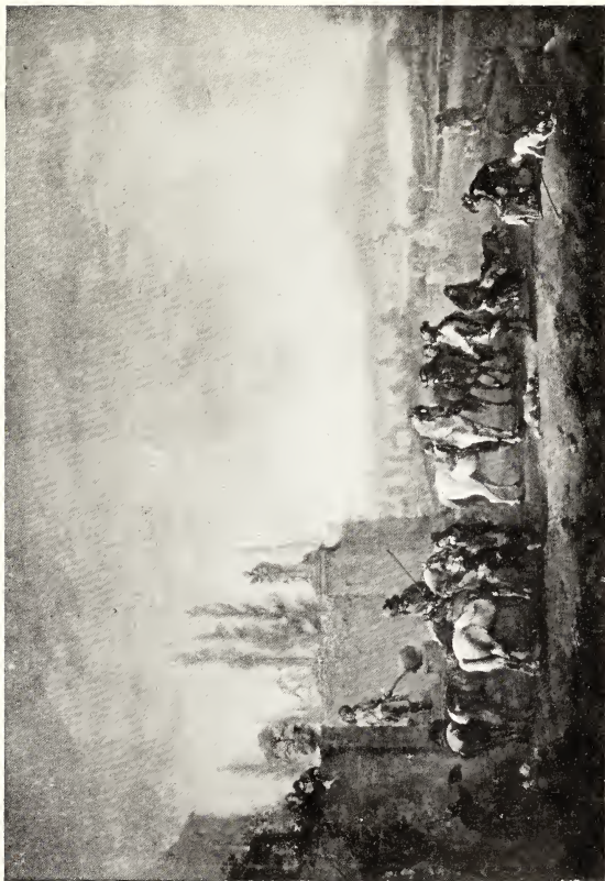
DEPARTURE FOR THE CHASE (Royal Gallery, Dresden)