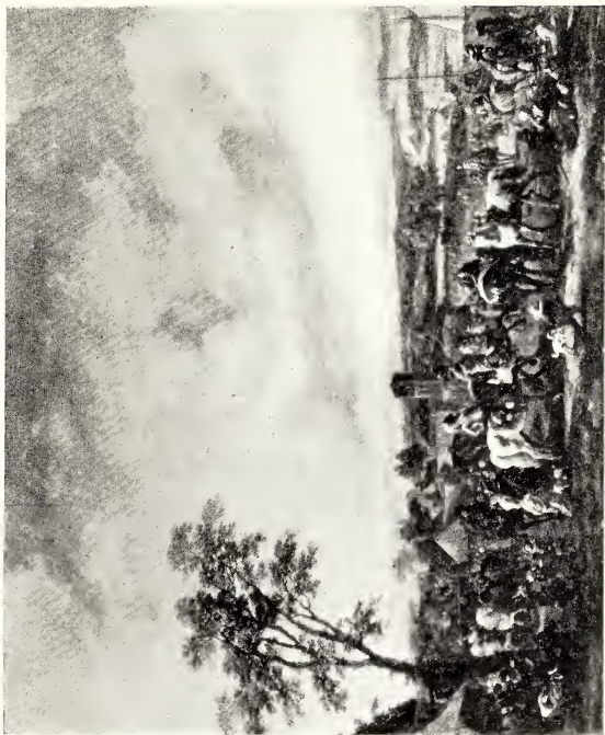
A HORSE FAIR ( Buckingham Palace, London )