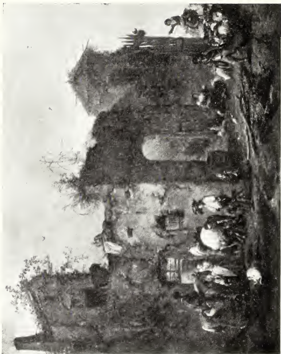
FARMYARD WITH SMITHY ( Dulwich Gallery )