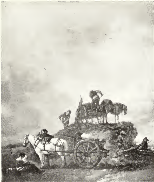
FARM LABOURERS IN THE FIELDS LABOUREURS AUX CHAMPS ( Dulwich Gallery ) ( Galerie, Dulwich )

LANDLEUTE AUF DEM FELDE ( Dulwich, Galerie )