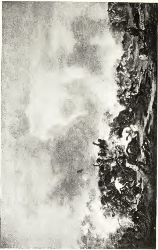
THE BATTLE OF NÖRDLINGEN, 1634 ( Pinakothek, Munich )