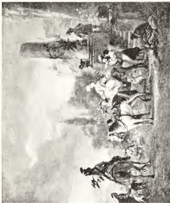
DEPARTURE FOR THE CHASE (Royal Gallery, Brussels)