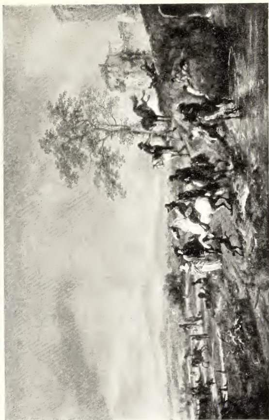
RIDING-SCHOOL AND HORSEPOUND (Imperial Gallery, Vienna)