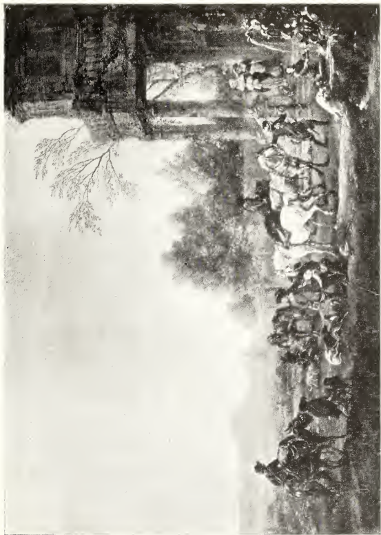
RETURN FROM THE CHASE ( Royal Gallery, Dresden )