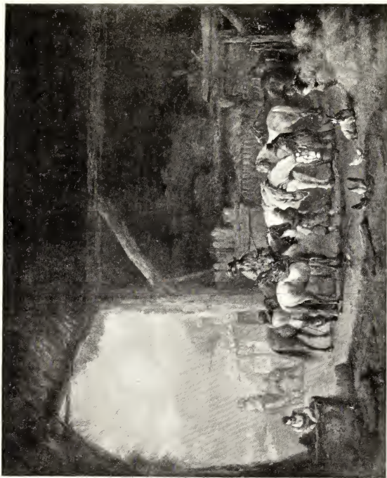
THE STABLE ( Pinakothek, Munich )