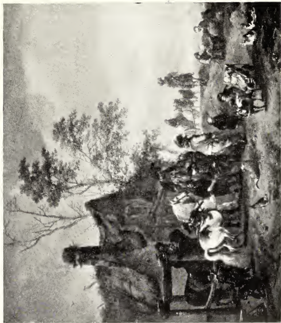
DAPPLE HORSE AT THE SMITHY (Royal Gallery, Cassel)