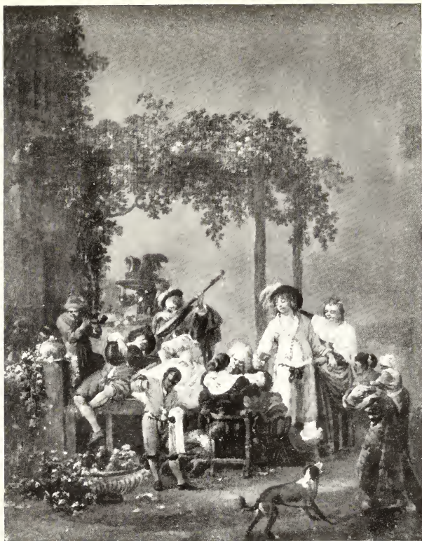
A MERRY COMPANY UNE JOYEUSE COMPAGNIE (The Hermitage, St. Petersburg) (L'Ermitage, Saint-Petersbourg) LUSTIGE GESELLSCHAFT (Petersburg, Eremitage)