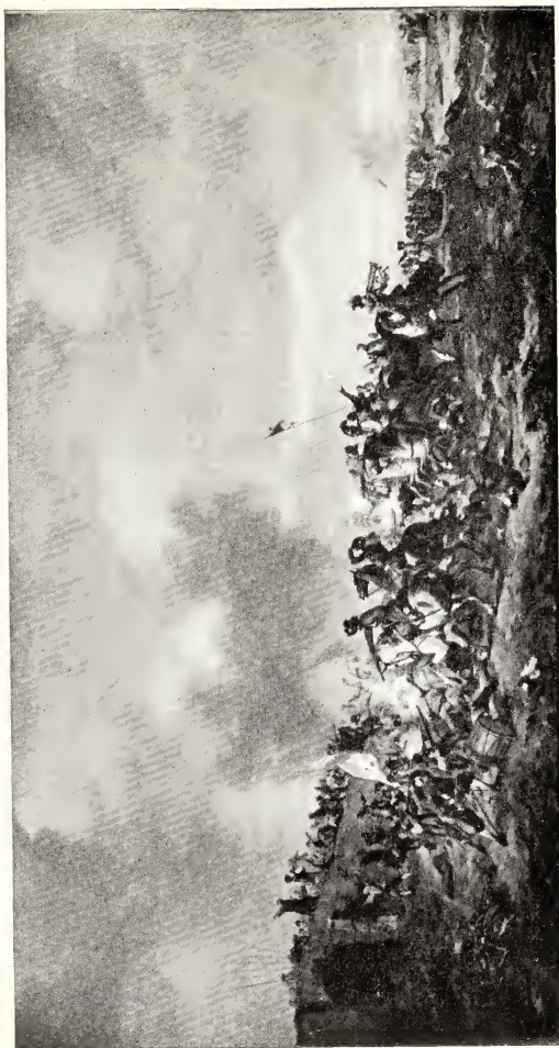
GREAT CAVALRY BATTLE (Royal Gallery, The Hague)