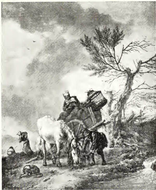
PEASANT GOING TO MARKET WITH OLD GREY HORSE ( Royal Gallery, Cassel )