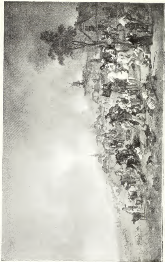
PLUNDERING OF A VILLAGE ( Pinakothek, Munich )