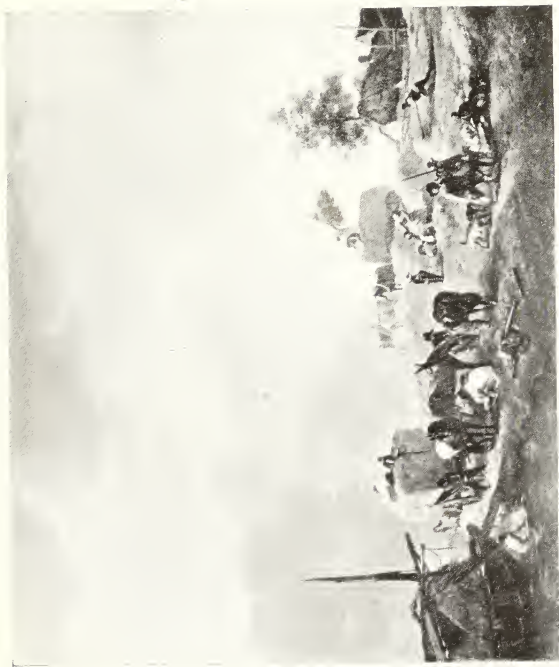
THE HAY HARVEST (Buckingham Palace, London)