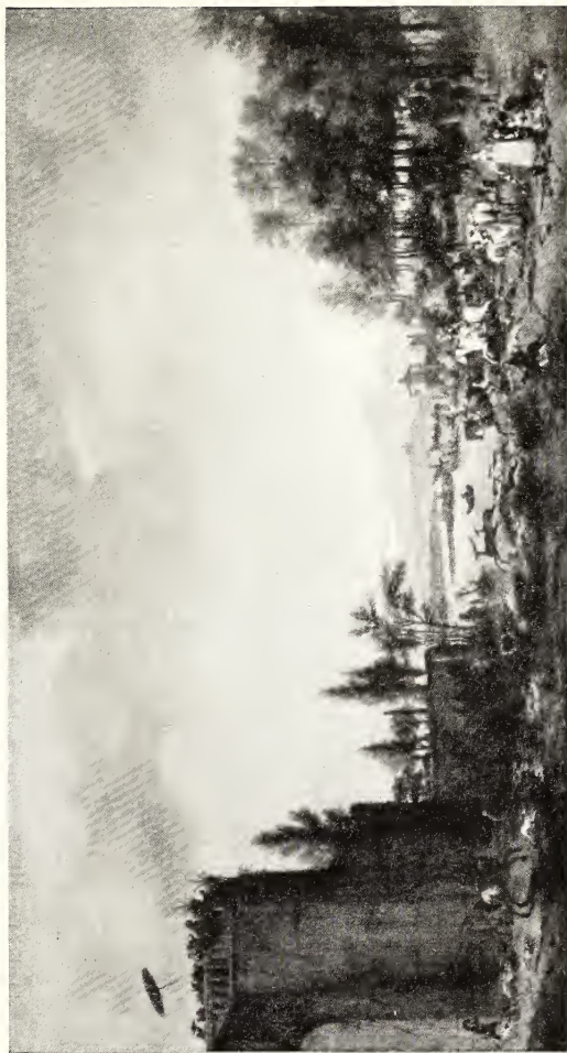
THE STAG HUNT (The Hermitage, St. Petersburg)