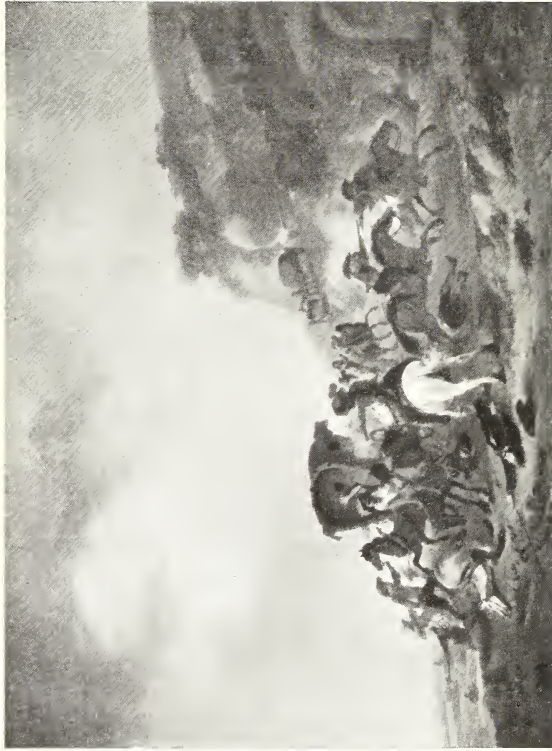
A MAIL COACH