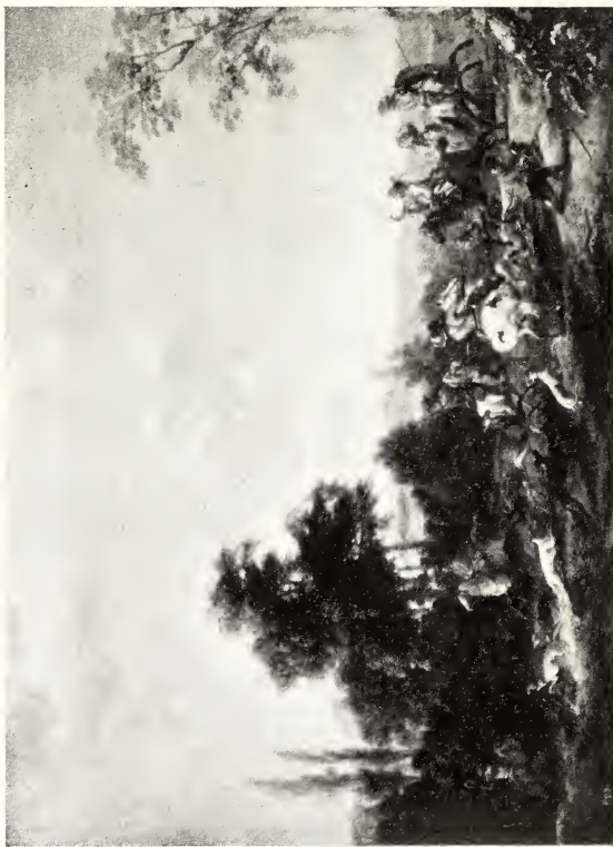
THE STAG HUNT (Royal Gallery, Cassel)