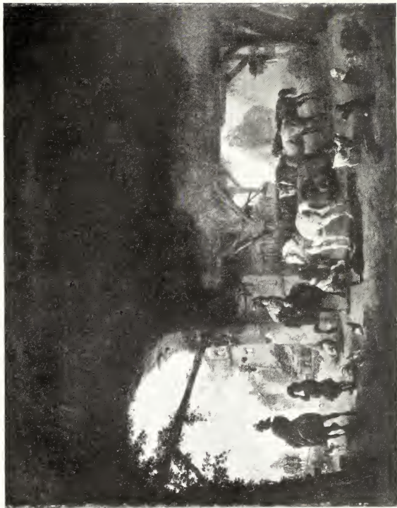
THE INN STABLE ( Royal Gallery, Dresden )