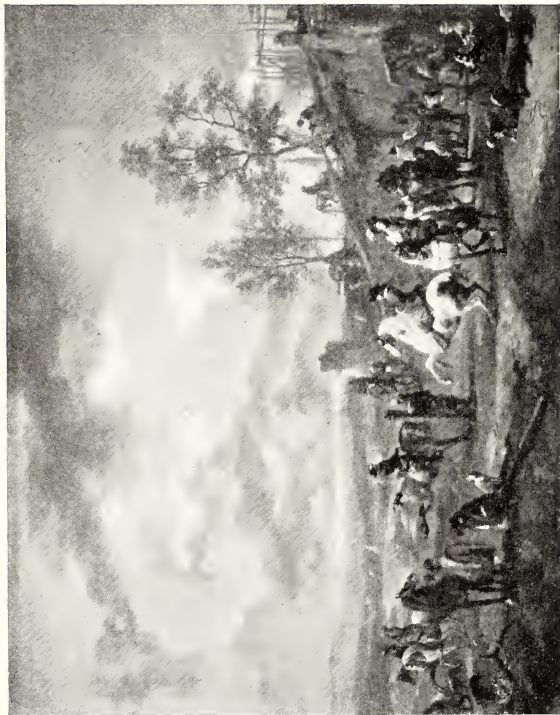
THE RIDING-SCHOOL BEFORE THE GATE MANÈGE EN FACE D'UNE PORTE ( Royal Gallery, Cassel ) ( Galerie royale, Cassel )

DIE REITSCHULE VOR DEM TORE ( Cassel, Kgl. Galerie )