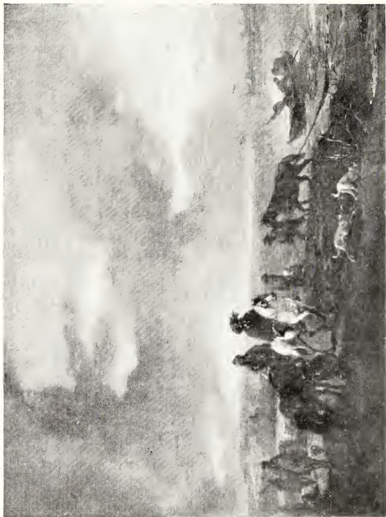
THE TRAVELLERS ( Pinakothek, Munich )