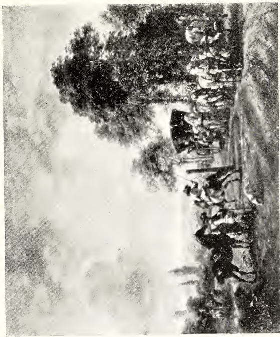
THE RIDING SCHOOL (Royal Gallery, The Hague)