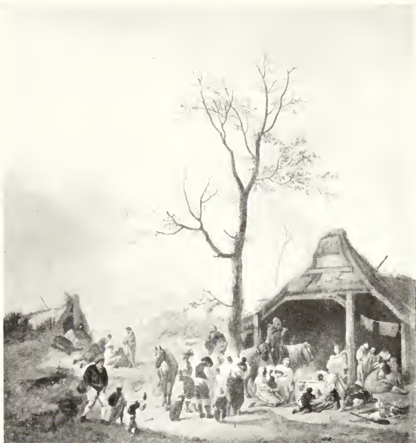
GIPSY ENCAMPMENT (Pinakothek, Munich)