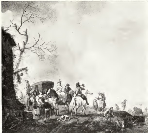
REST ON A HAWKING EXCURSION HALTE DE FAUCONNIERS (Buckingham Palace, London) (Palais Buckingham, Londres)

RUHEPAUSE AUF EINER FALKENJAGD (London, Buckinghampalast)