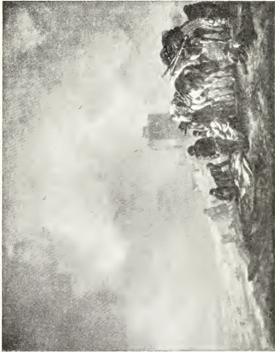
VUE ON THE COAST (Royal Gallery, Cassel)