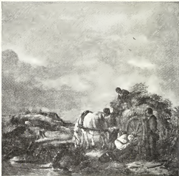
THE CORN HARVEST (Royal Gallery, Cassel)