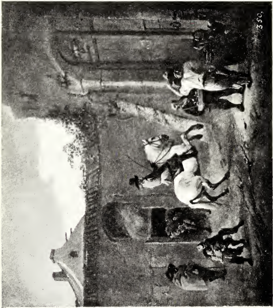
HORSEMAN IN YARD ( Royal Gallery, Dresden )