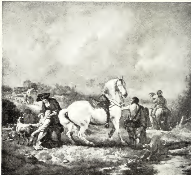
HUNTING EPISODE (Royal Gallery, Brussels)