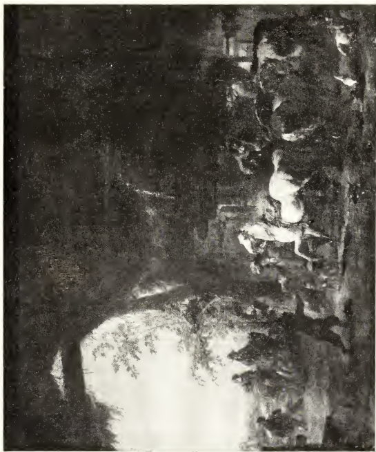
RIDING-SCHOOL IN A STABLE (Pinakothek, Munich)