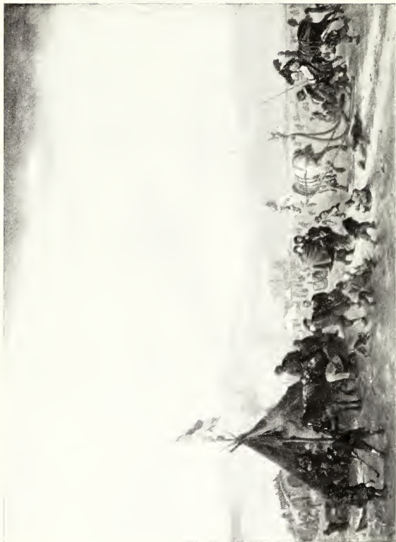
WINTER LANDSCAPE ( Pinakothek, Munich )