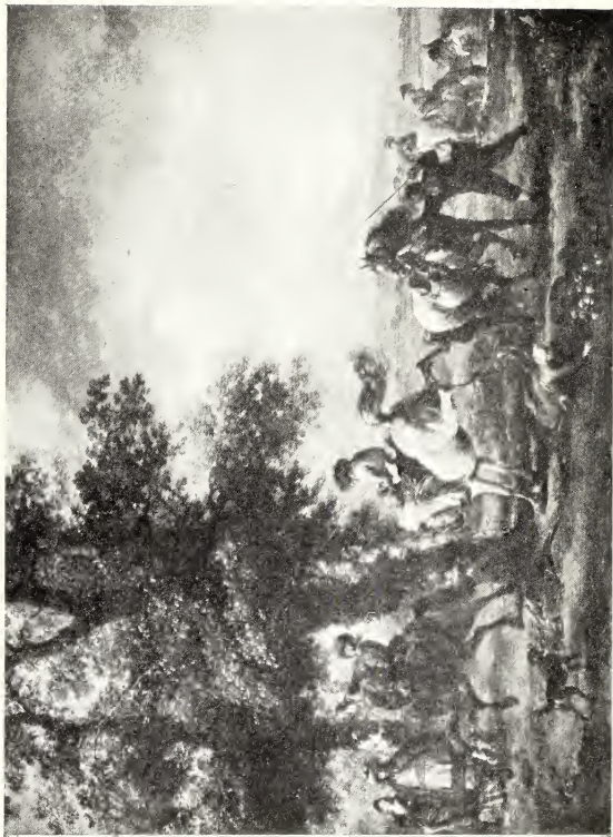
THE STARTLED HORSE (Royal Museum, Amsterdam)