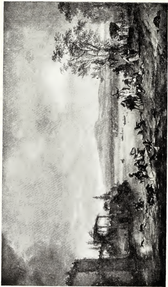
THE STAG HUNT ( Pinakothek, Munich )