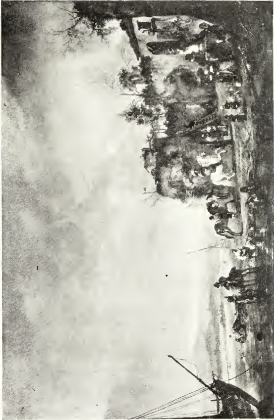
THE RIDING-SCHOOL (Royal Gallery, Berlin)