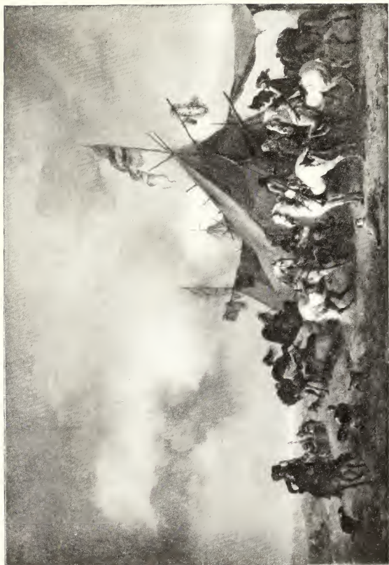
AN ENCAMPMENT (Royal Gallery, The Hague)

Ein Lager (Haag, Kgl. Galerie)