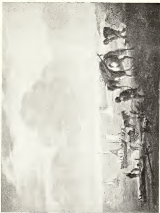
VIEW ON THE COAST ( Royal Gallery, Cassel )

STRANDBILD ( Cassel, Kgl. Galerie )