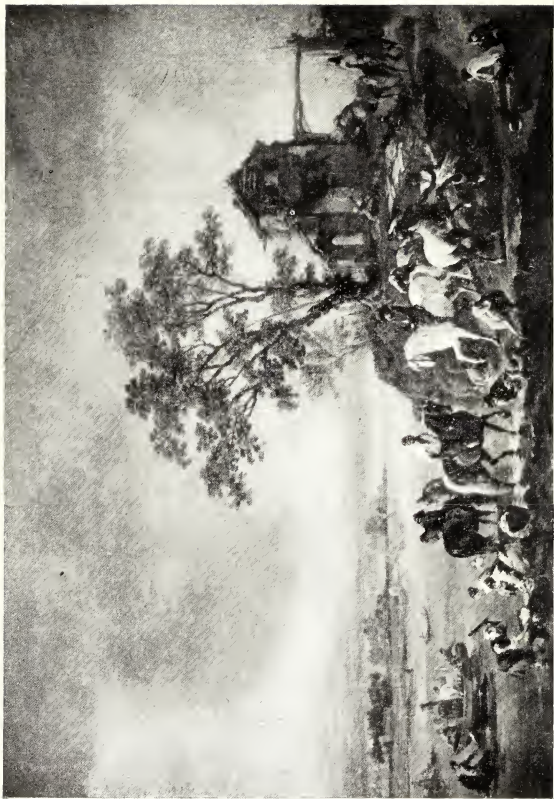
THE WATERING-PLACE (Royal Museum, Amsterdam)