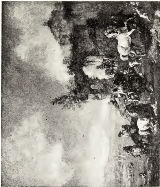
THE WATERING-PLACE ( Pinakothek, Munich )