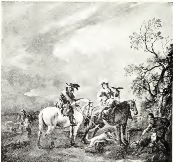
HALT AT THE WELL (Royal Gallery, Cassel)