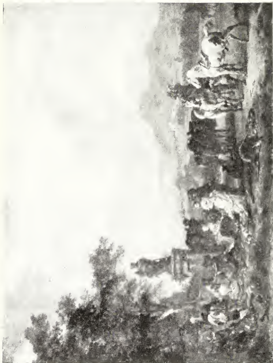
AFTER THE CHASE (Pinakothek, Munich)