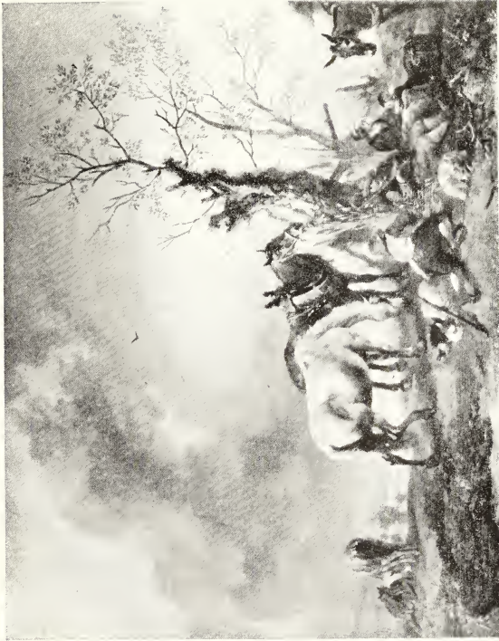
PEASANTS RESTING ( Royal Gallery, Cassel )

RUHENDE LANDLEUTE ( Cassel, Kgl. Galerie )