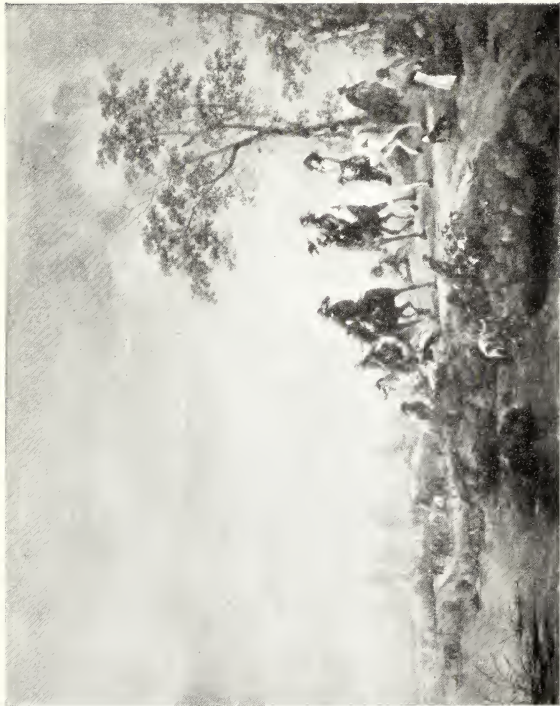
RETURN FROM HAWKING ( Royal Gallery, Cassel )