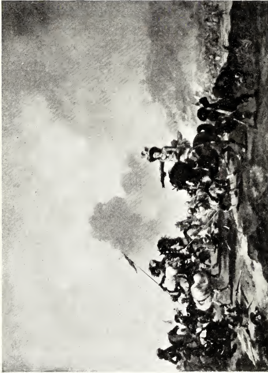
A BATTLE (Liechtenstein Gallery, Vienna)