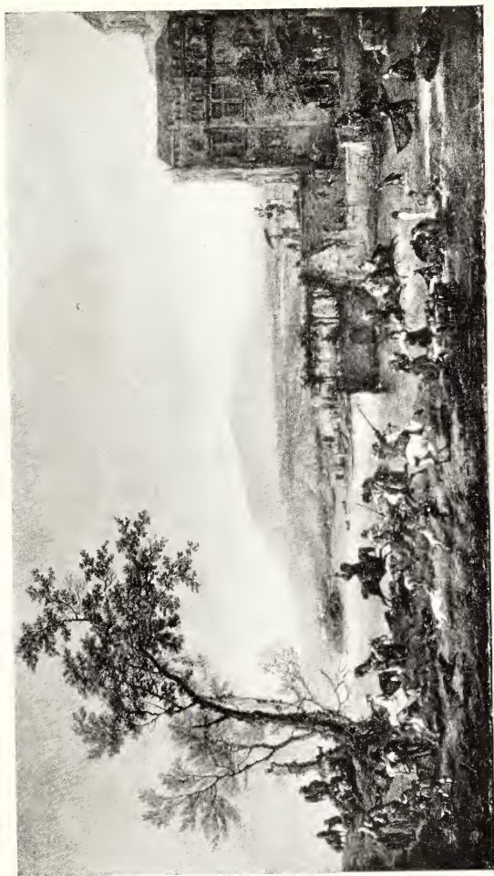
STAG HUNT AT RIVER ( Royal Gallery, Dresden )