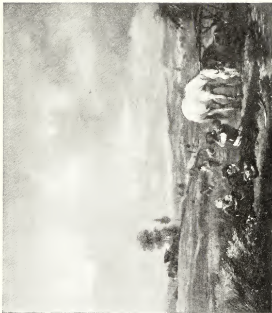
FARM LABOURERS' MIDDAY REST REPOS DE MIDI DES LABOUREURS (Royal Gallery, Cassel) (Galerie royale, Cassel)