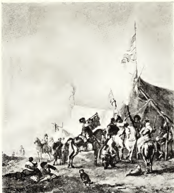
THE PISTOL SHOT LE COUP DE PISTOLET (Buckingham Palace, London) (Palais Buckingham, Londres) DER PISTOLENSCHUSS (London, Buckinghampalast)