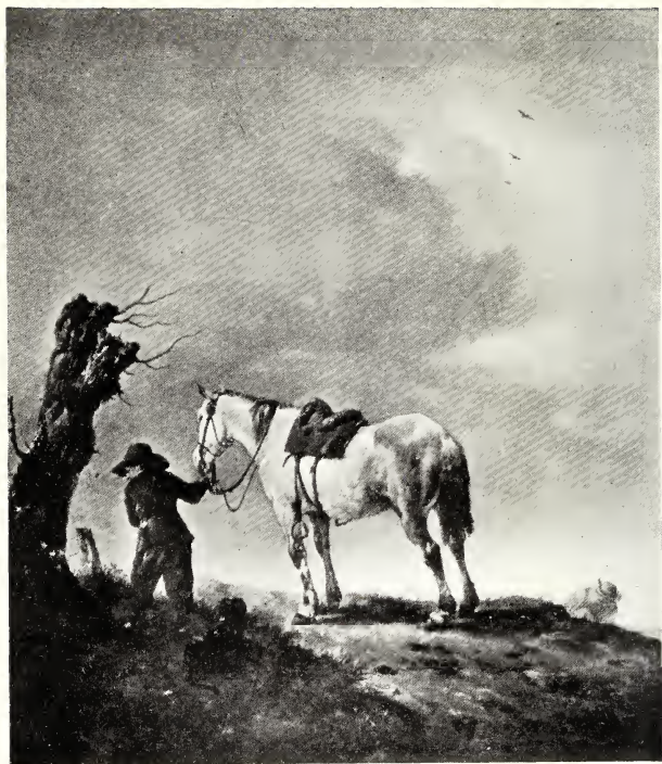
A HORSEMAN DISMOUNTED ( Royal Museum, Amsterdam )