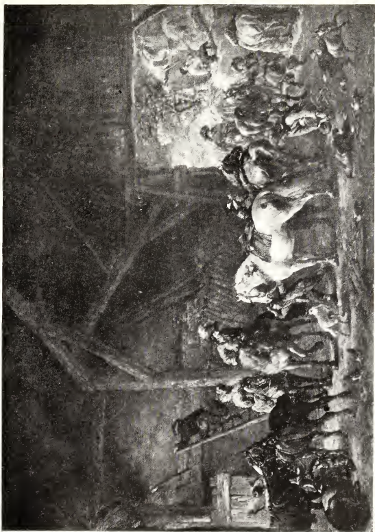
ARRIVAL AT THE INN (Royal Gallery, The Hague)