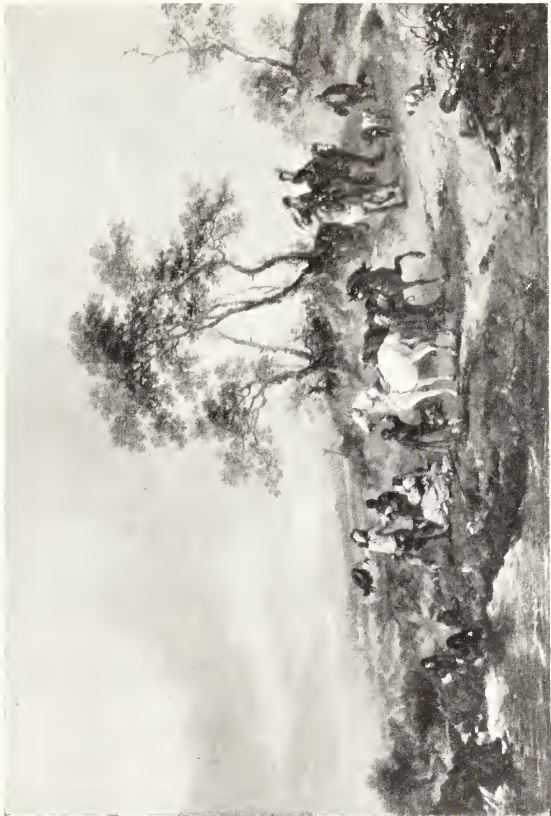
HALT OF A HAWKING PARTY ( Dutwich Gallery )