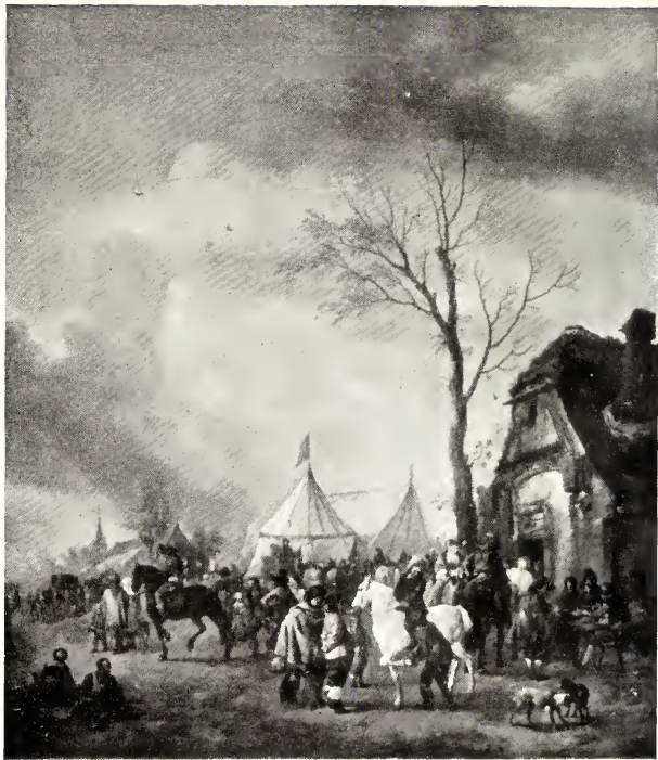
THE HORSE FAIR LE MARCHÉ AUX CHEVAUX (Earl of Northbrook, London) (Comte de Northbrook, Londres) DER PFERDEMARKT (London, Graf von Northbrook)