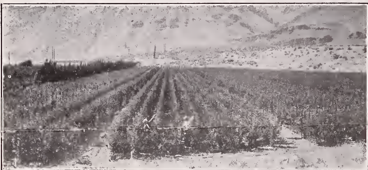
A field of several thousand Apple Trees in the C. & O. Nurseries. All standard varieties of apple, peach, pear, plum, prune and other deciduous fruit tree, shade trees, shrubbery and evergreens are grown.