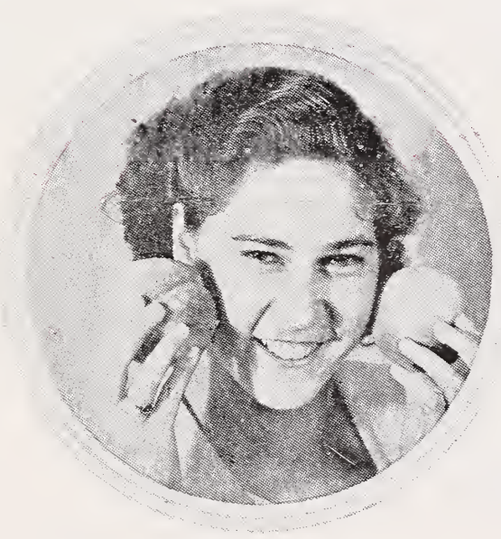
"THE SKIN YOU LOVE TO TOUCH" IS A NEW IDEA IN PEACHES

It is expected another few years will see the movement of sizeable quantities of Candoka Peaches to the principal consuming markets. This season, a number of leading markets received small sample shipments, and from all reports it seems the fruit is being received with much favor.—N. W. Daily Produce News.