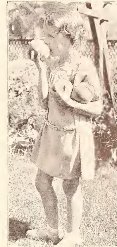
U-m-m They Are Good

J. C. PALUMBO FRUIT COMPANY, Packer's and Distributors, Payette, Idaho