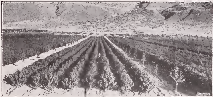
A field of Peach Trees in the C. & O. Nurseries. Note the long, straight rows and the uniform, thrifty, growth.

Our nursery was established in the Wenatchee Valley, Washington, in 1906, and since that time has supplied a very large part of the extensive plantings of fruit trees and other nursery stock which has been planted in Central Washington.