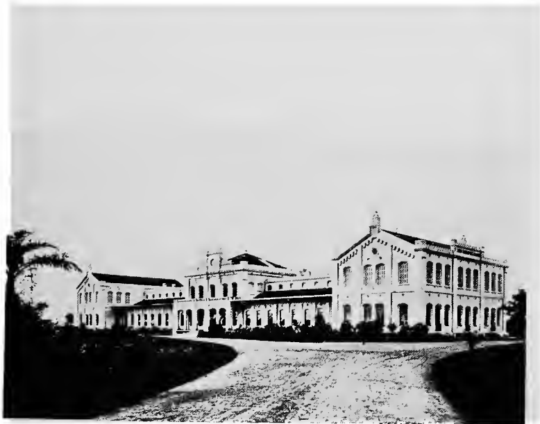
AN AGRICULTURAL COLLEGE, SAO PAULO