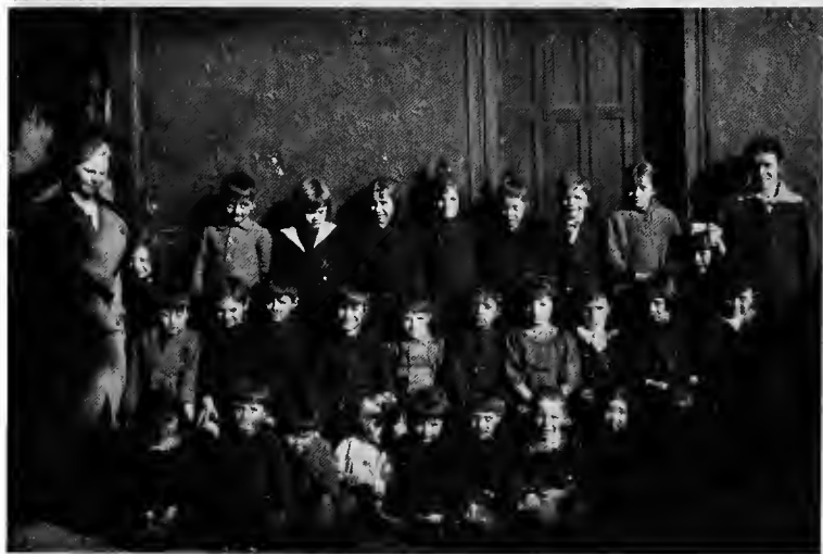
A CLASS IN AN AMERICAN GIRLS' SCHOOL IN SANTIAGO