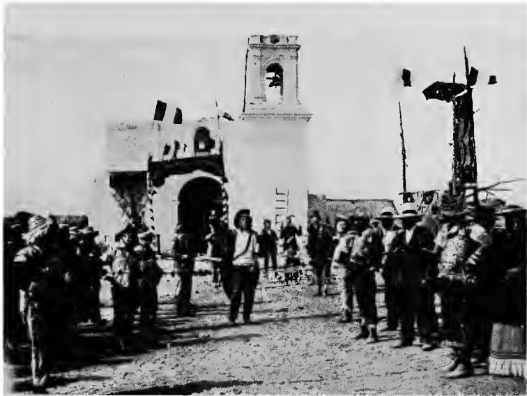
MASKED DANCERS AT CARMEN ALTO, PERU, DURING CARNIVAL