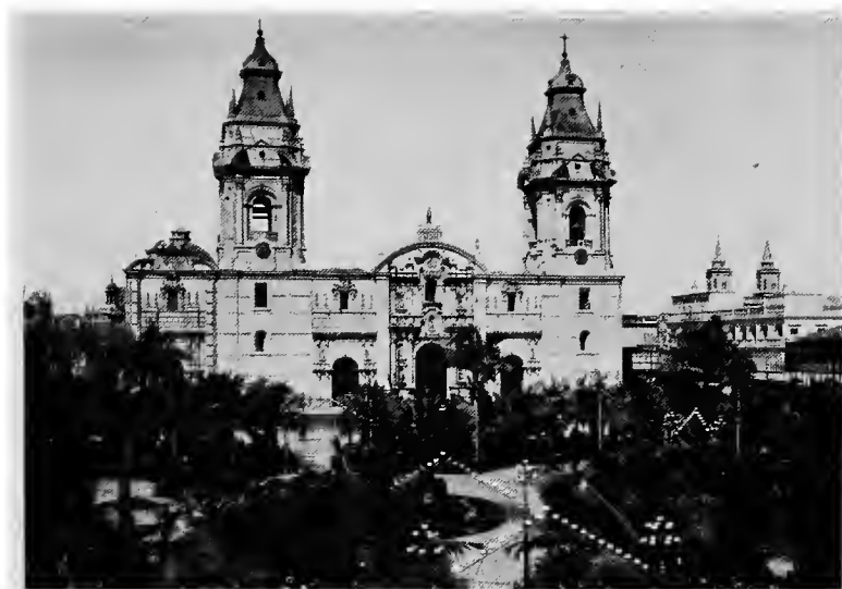
CATHEDRAL FROM PLAZA, LIMA