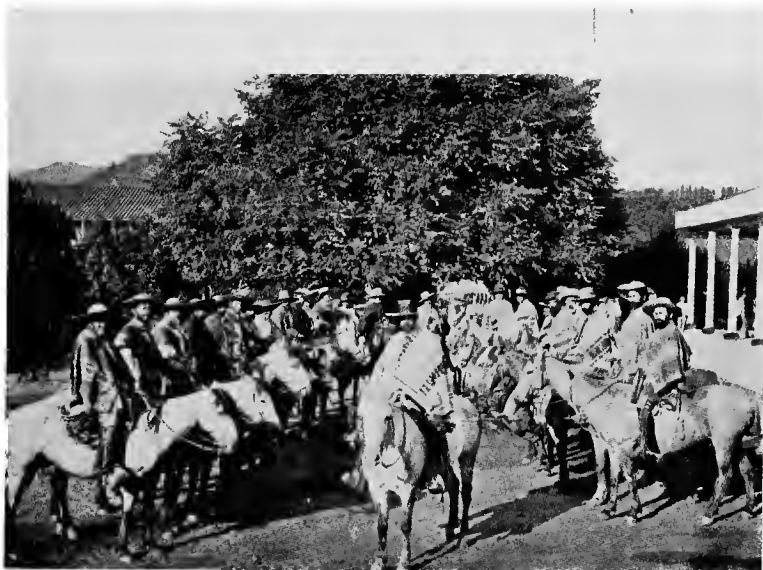
A FINE GROUP OF GAUCHOS AT A COUNTRY ESTATE