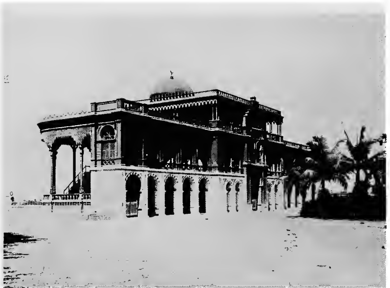
THE JOCKEY CLUB STAND, HIPPODROME, BUENOS AIRES