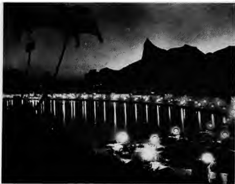
THE BEAUTIFUL BAY OF BOTAFOGA AND THE CITY OF RIO DE JANEIRO BY NIGHT SHOWING THE PEAK OF CORCOVADO IN THE DISTANCE AT AN ALTITUDE OF ABOUT THREE THOUSAND FEET