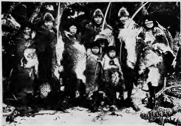
TYPES OF A PATAGONIAN INDIAN TRIBE OF SOUTHERN CHILE