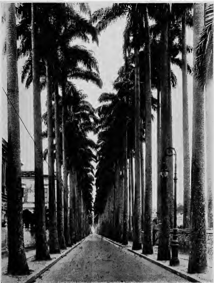
ONE OF THE BEAUTIFUL AVENUES OF ROYAL PALMS IN RIO DE JANEIRO