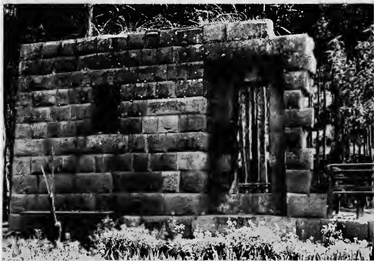
RUINS. PALACE OF THE INCA, CUZCO