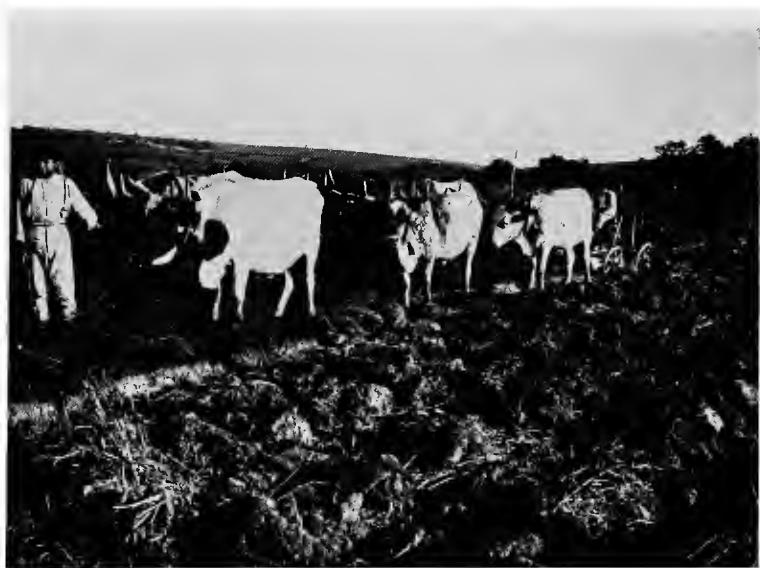
PRIMITIVE PLOWING IN CHILE