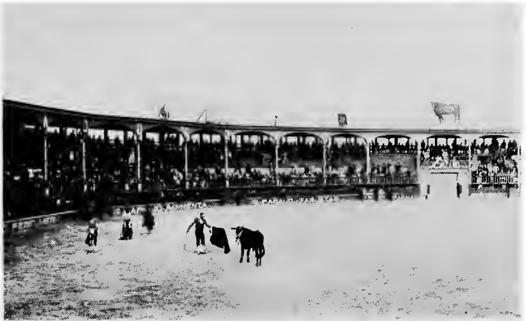
THE BULL RING, LIMA