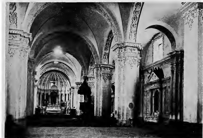
INTERIOR OF CATHEDRAL AREQUIPA