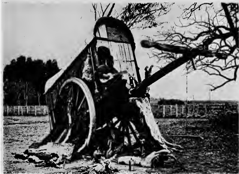
THE GAUCHO AS A WANDERING MINSTREL