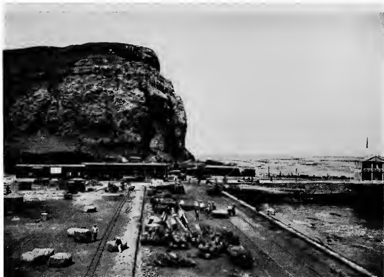
ARICA—THE TERMINUS OF THE NEW CHILEAN RAILROAD FROM LA PAZ