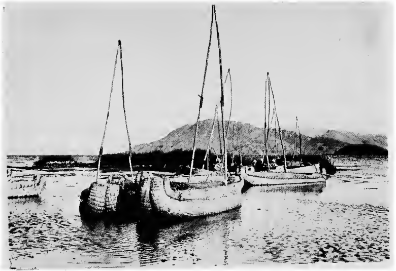
"LAS BALSAS" REED BOATS, LAKE TITICACA