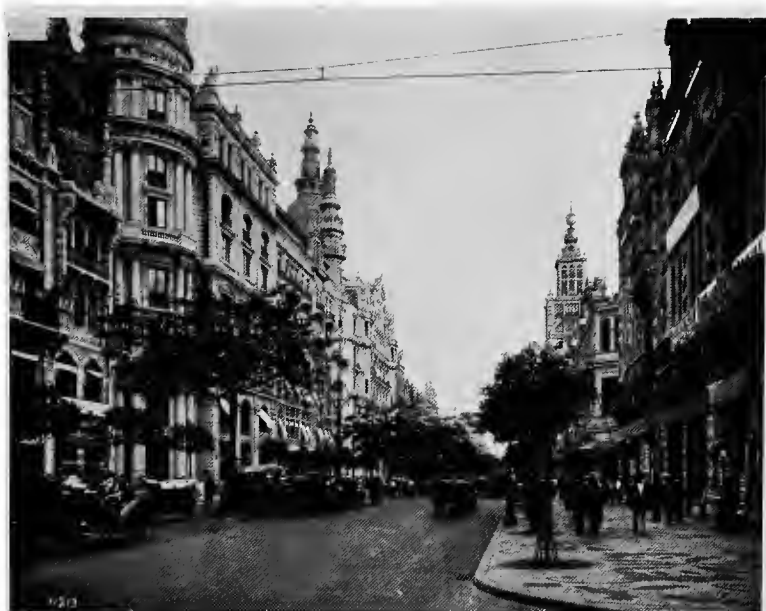
AVENIDA RIO BRANCO—RIO DE JANEIRO, BRAZIL A NOTABLE AVENUE IN SOUTH AMERICA