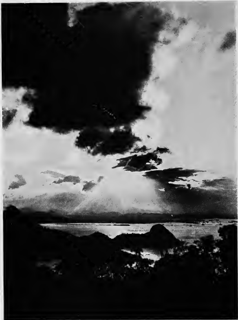
SUNSET AT RIO HARBOR