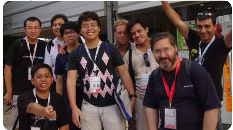
The WMPH Board with Wikimania participants

Wikimania 2011 Website: http://wikimania2011.wikimedia.org