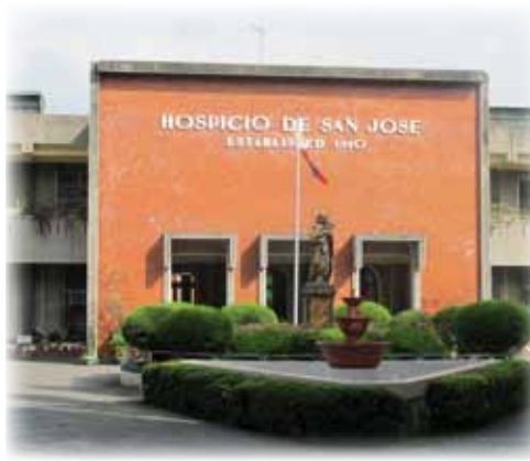
Hospicio De San Jose in San Miguel