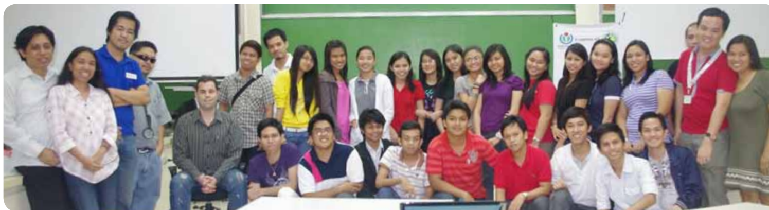
Organizers, panelists and participants of the WikiCon 2011.