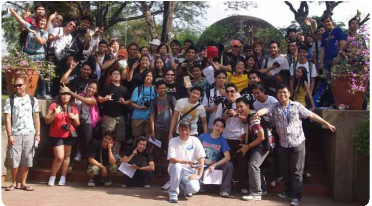
Participants of the Wikipedia Takes Manila at the Paco Park before they embark on the photo hunt.

In line with this, WMPH also celebrated a historic milestone for the Tagalog Wikipedia, which reached 50,000 articles on January 15.