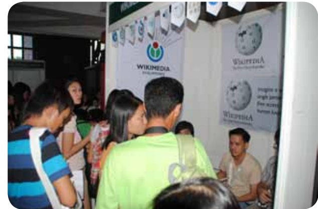
Youth Congress in Information Technology at the University of the Philippines - September 2010.