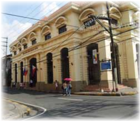
Bahay Tsinoy in Intramuros