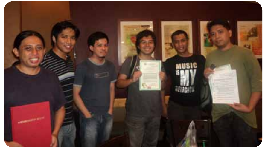
The WMPH Board of Trustees showing the WMPH's Certificate of Incorporation, By-laws and Membership Book during its first Board Meeting in May 1, 2010.

Wikimedia Philippines started with eleven members in 2010. The organization grew and by the end of 2011, it already has 48 approved members.