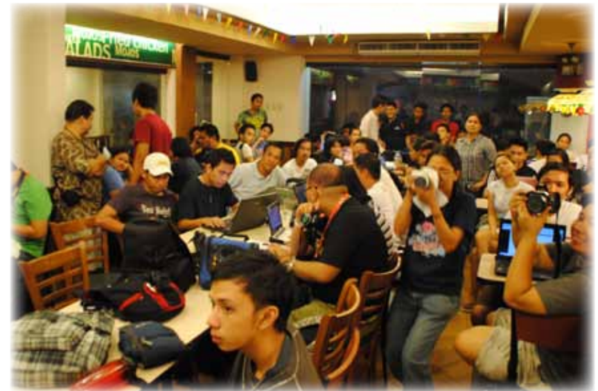
Awarding ceremony and dinner party at a pizza restaurant in Ermita