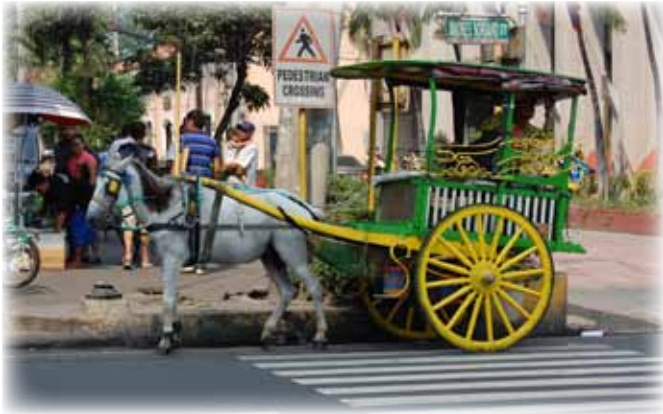
A calesa in Andres Soriano St., in Intramuros