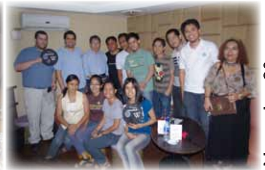
WMPH members and partners at a relaxed socializing activity