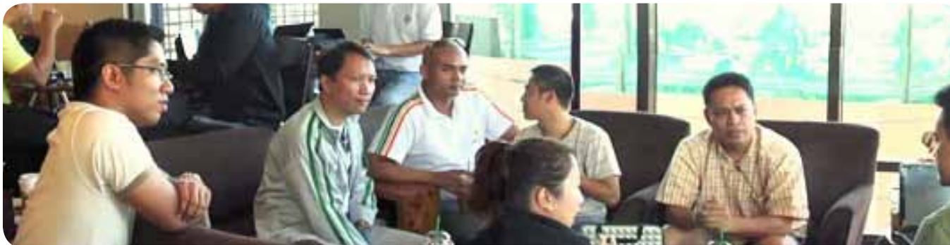
The February 19 Kapihan with people from PhilIT.Org