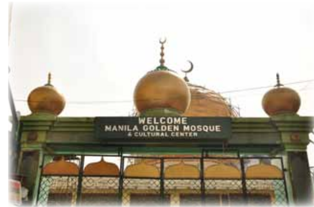
Masjid Al-Dahab in Quiapo