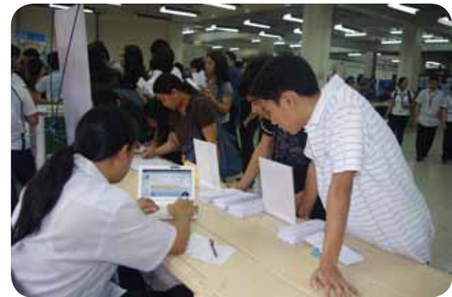
Wikipedia Roadshow at the Technological University of the Philippines - September 2010.