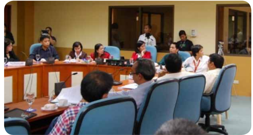
The Committee Hearing of the FOSS Bill.