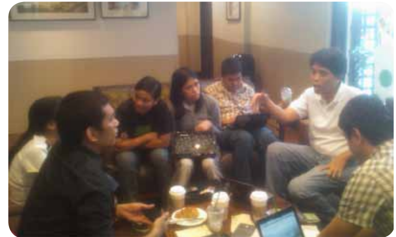
The August 27 Kapihan with people from CPU

http://www.micro.ph/one/first-wikipedia-kapihan-starbucks-drive-thru-the-fort-video-highlights