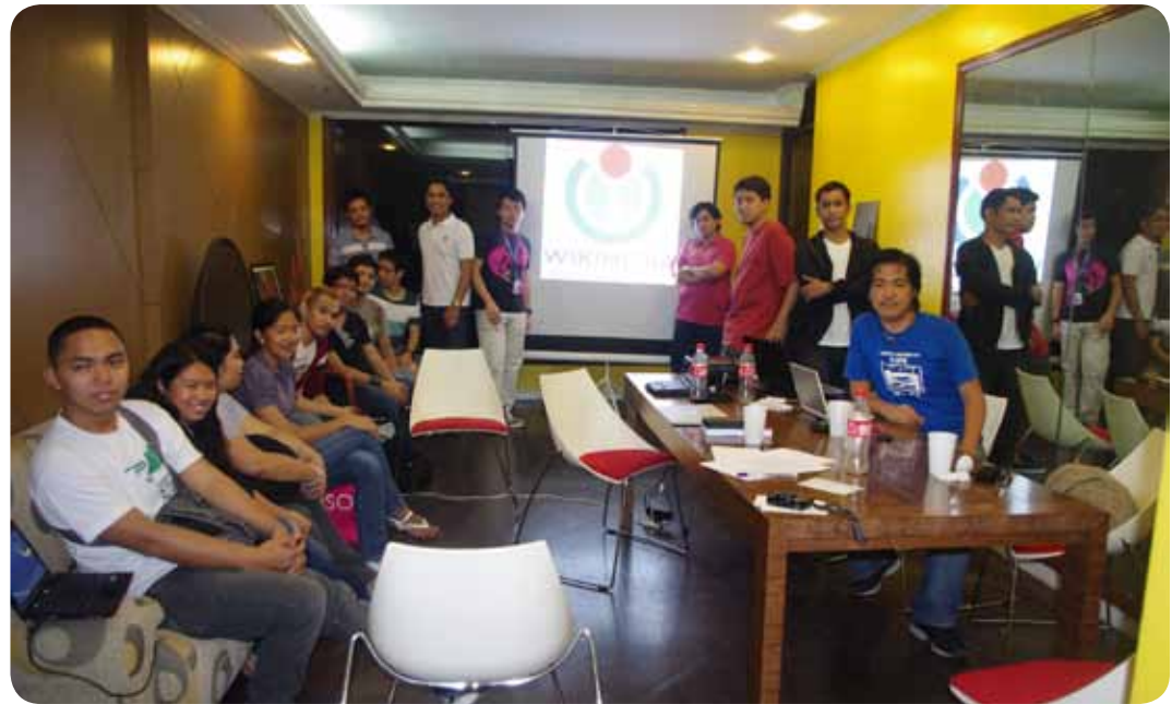
Attendees of the Annual Meeting on July 9