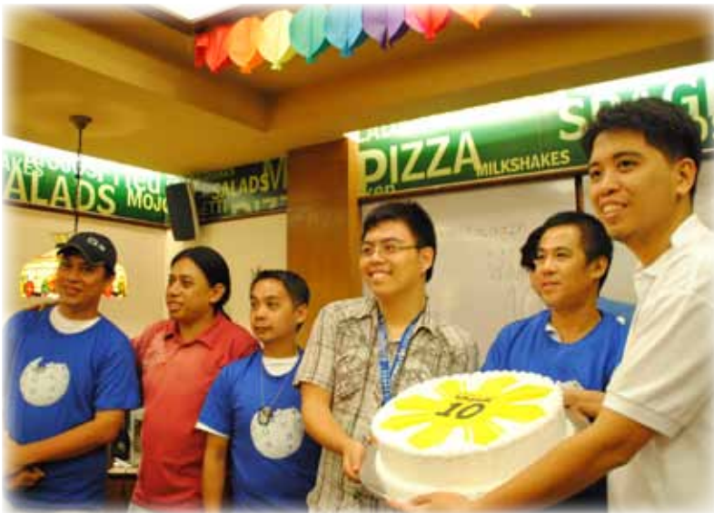
Organizers and contestants with the ceremonial Wikipedia 10 cake