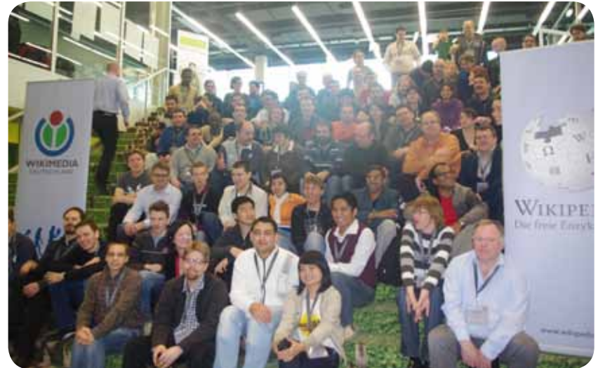
Attendees of the Chapter's Conference

http://meta.wikimedia.org/wiki/Wikimedia_Conference_2011