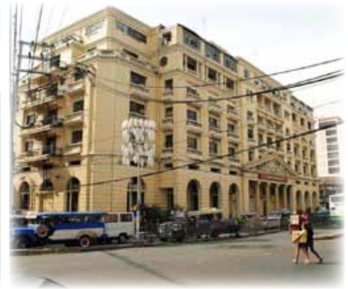
Roman Santos Building in Sta. Cruz