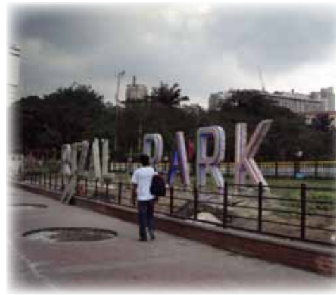
Rizal Park signage in Ermita