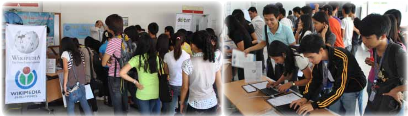
Students visiting the WMPH booth at the Software Freedom Day.

SFD is the international commemoration of Free/Open Source Software (FOSS), the free and high quality alternatives to proprietary software. This event, celebrated by almost thousands of organizations worldwide, is a day of reaching out to newcomers in the community by inspiring them with the value and quality of free software through a variety of activities such as presentations and discussions. This shares the Wikimedia Foundation's vision of spreading free and open sourced knowledge all over the world.