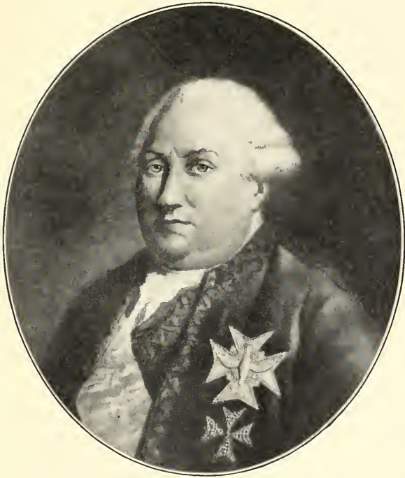
THE BAILLI DE SUFFREN (FROM THE PORTRAIT BY GÉRARD)