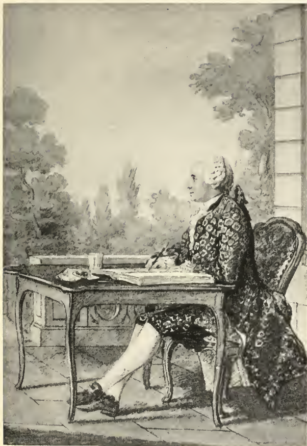
CARMONTELLE: BY HIMSELF

(FROM GRUYER'S "CHANTILLY: LES PORTRAITS DE CARMONTELLE," BY PERMISSION OF MM. PLON-NOURRIT ET CIE.)