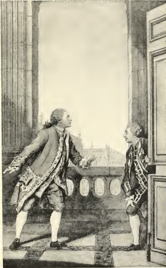
THE TWO GARRICKS: BY CARMONTELLE

(FROM GRUYER'S "CHANTILLY: LES PORTRAITS DE CARMONTELLE," BY PERMISSION OF MM. PLON-NOURRIT ET CIE.)