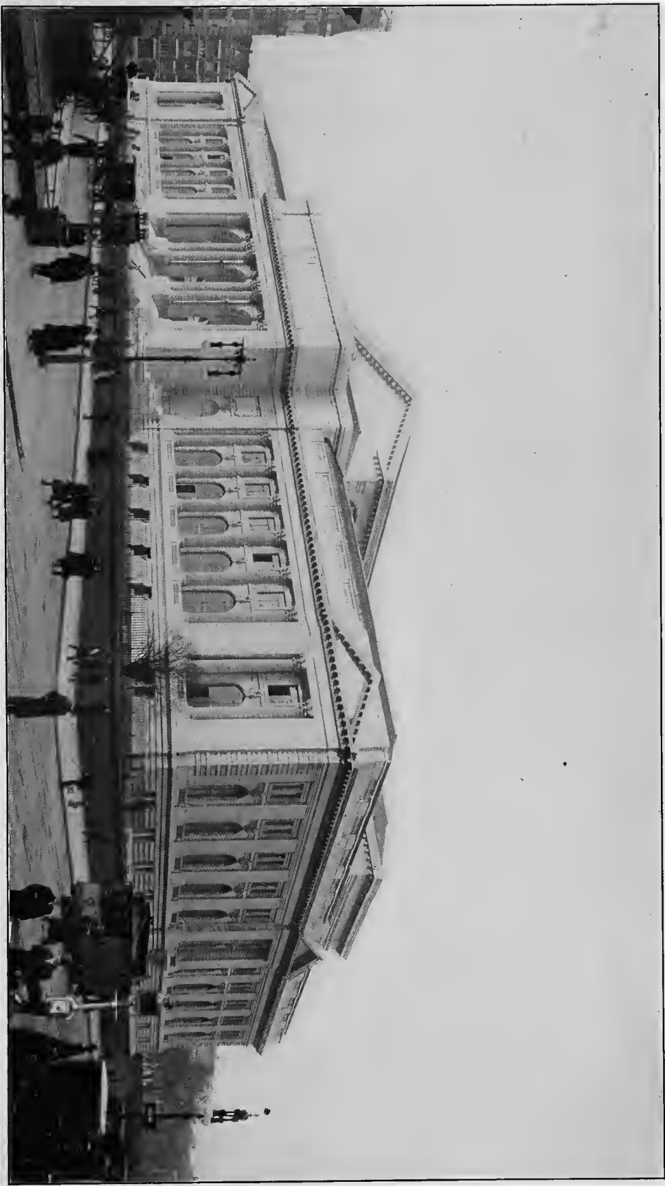
NEW CENTRAL BUILDING NEW YORK PUBLIC LIBRARY, FIFTH AVENUE AND FORTY-SECOND STREET.