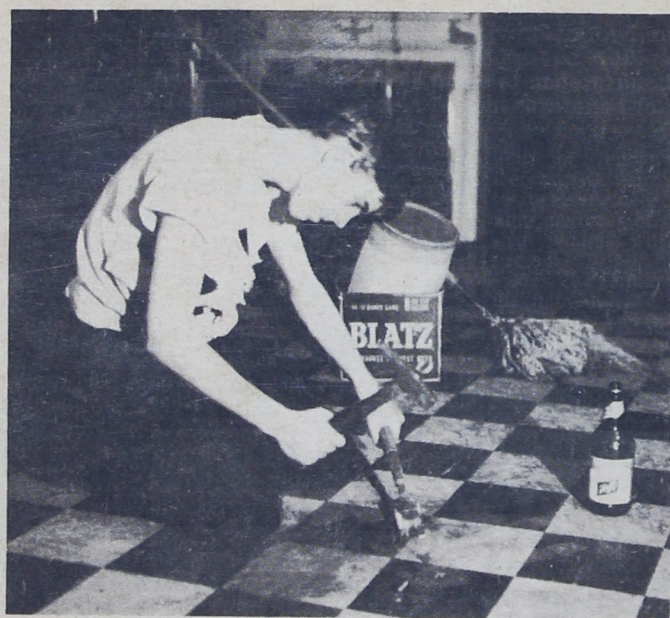
Loyola University's new ethyl-alcohol powered Atom Smasher pursues atoms in his relentless quest for scientific discovery.