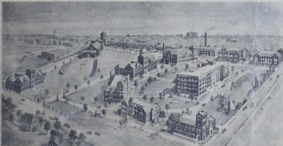
Artists' conception of the future campus of Loyola University, the extended Outer Drive, and Lake Mich.