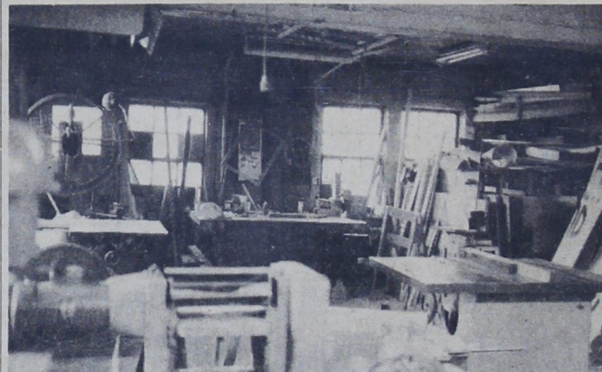
Pictured here is the new Arts and Crafts classroom located in the sub-basement of the Lake Shore power plant.