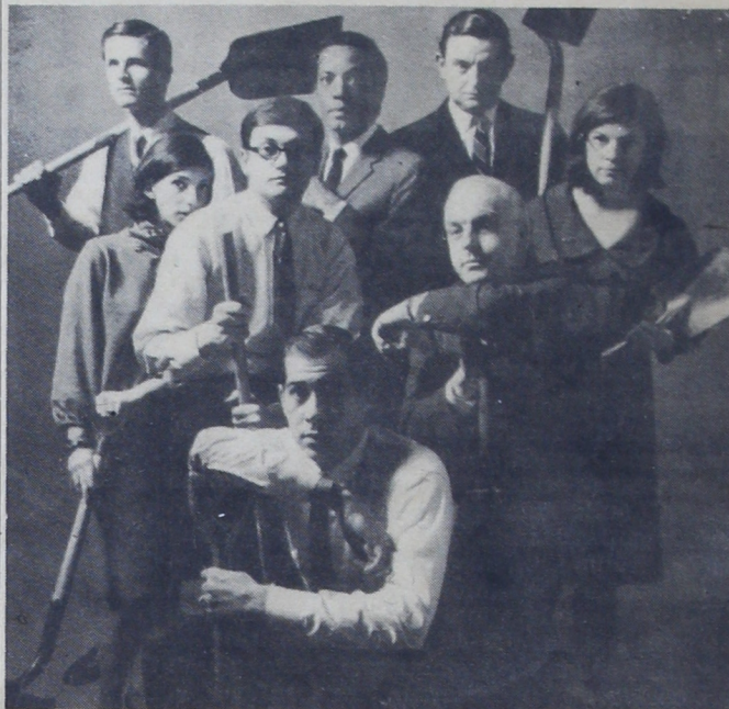
Members of Tri-Cycle, with shovels in hand, get ready to break ground for their memorial pyramid.