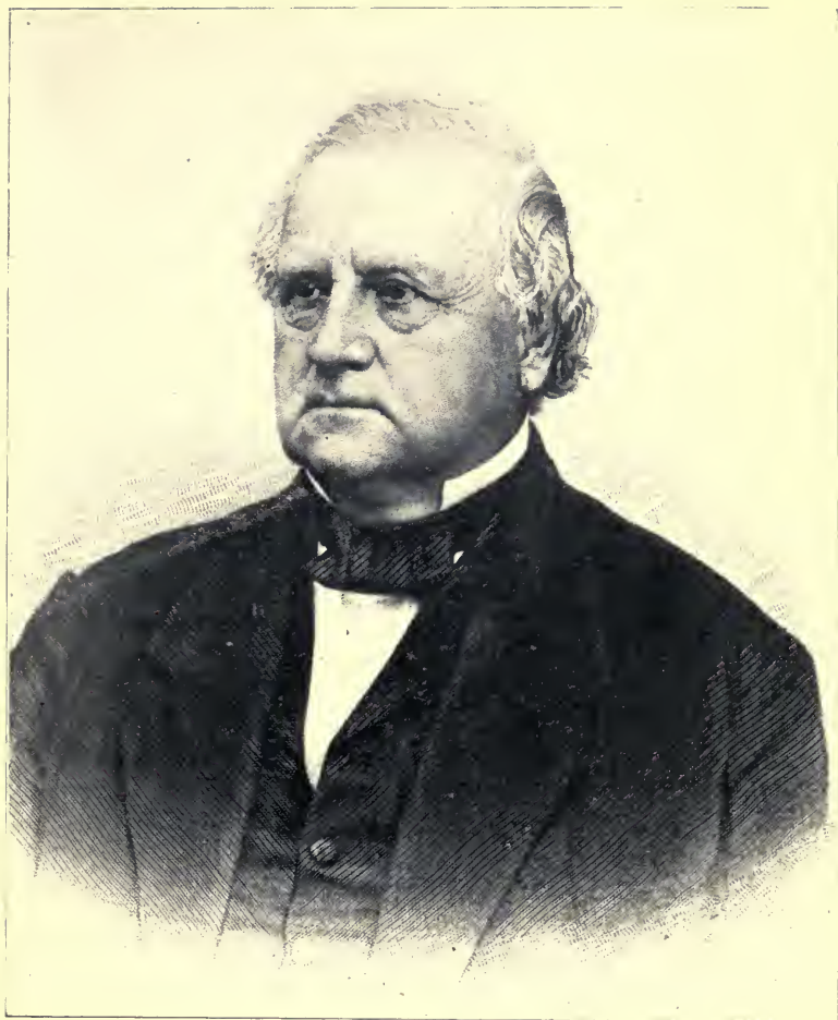
GOVERNOR EDWARD KENT.