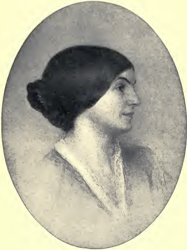
MRS. JAMES RUSSELL LOWELL.