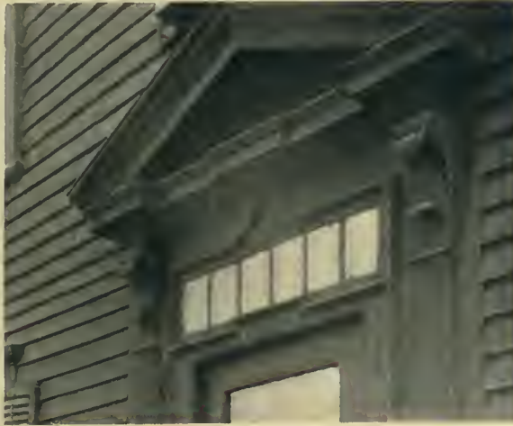
Detail of Doorway. CRAWFORD HOUSE, SOUTH MAIN STREET. Circa 1740.

in the community for that. The British were at Newport a large part of the time, and the whole colony was an armed camp. When once the struggle was over the town came into a period of great prosperity. Before the war it had been the smaller place, Newport the larger and more important as well as the more wealthy. Now the British occupation had ruined Newport and Providence forged ahead. The earlier trade, which had provided the wherewithal to build houses like the Crawford and the Arnold, was with the West Indies. Now the East Indies were levied upon, and the trade with them and China employed a fleet of ships and enriched many merchants, some of whom succeeded in