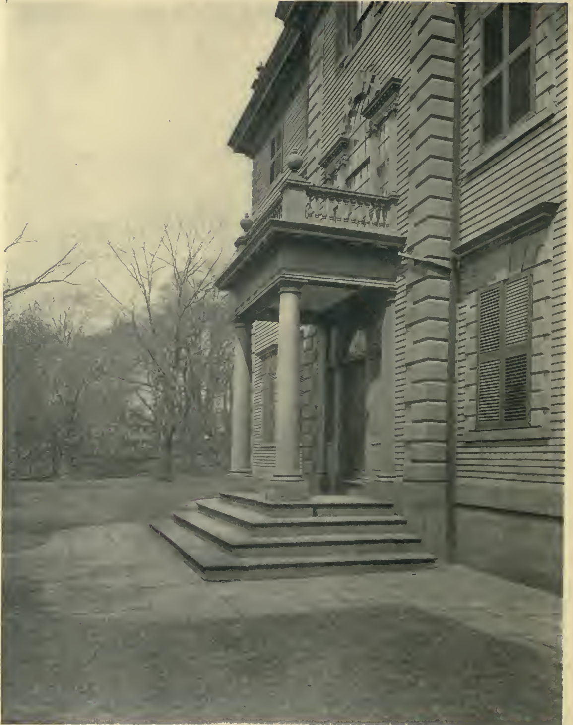
COLONEL JOSEPH NIGHTINGALE HOUSE.