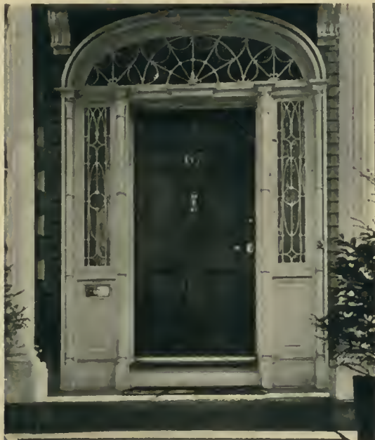
Doorway and Tracery. DODGE HOUSE, GEORGE STREET Providence, Rhode Island.

which we have been following, but, perhaps for that very reason, it is of great interest.