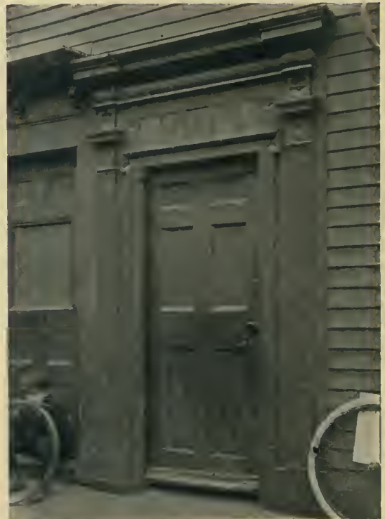
Doorway. CHRISTOPHER ARNOLD HOUSE. South Main Street. Providence, Rhode Island. (Illustration of full elevation at top of page four)