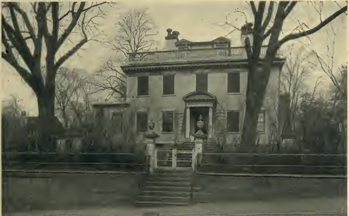
CAPTAIN GEORGE BENSON HOUSE. North Side of Angell Street. Now the Grosvenor House. Circa 1786.

About 1800—earlier in brick houses—a new