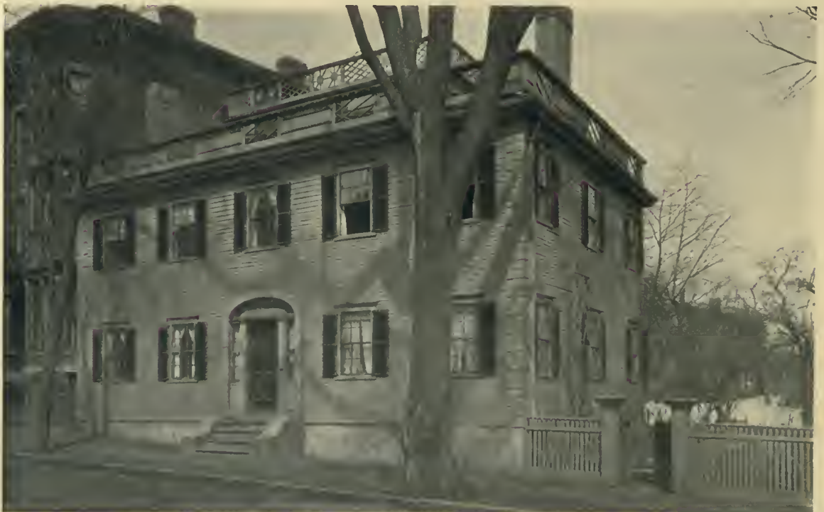
BOSWORTH HOUSE. East Side of Cooke Street. Circa 1820.