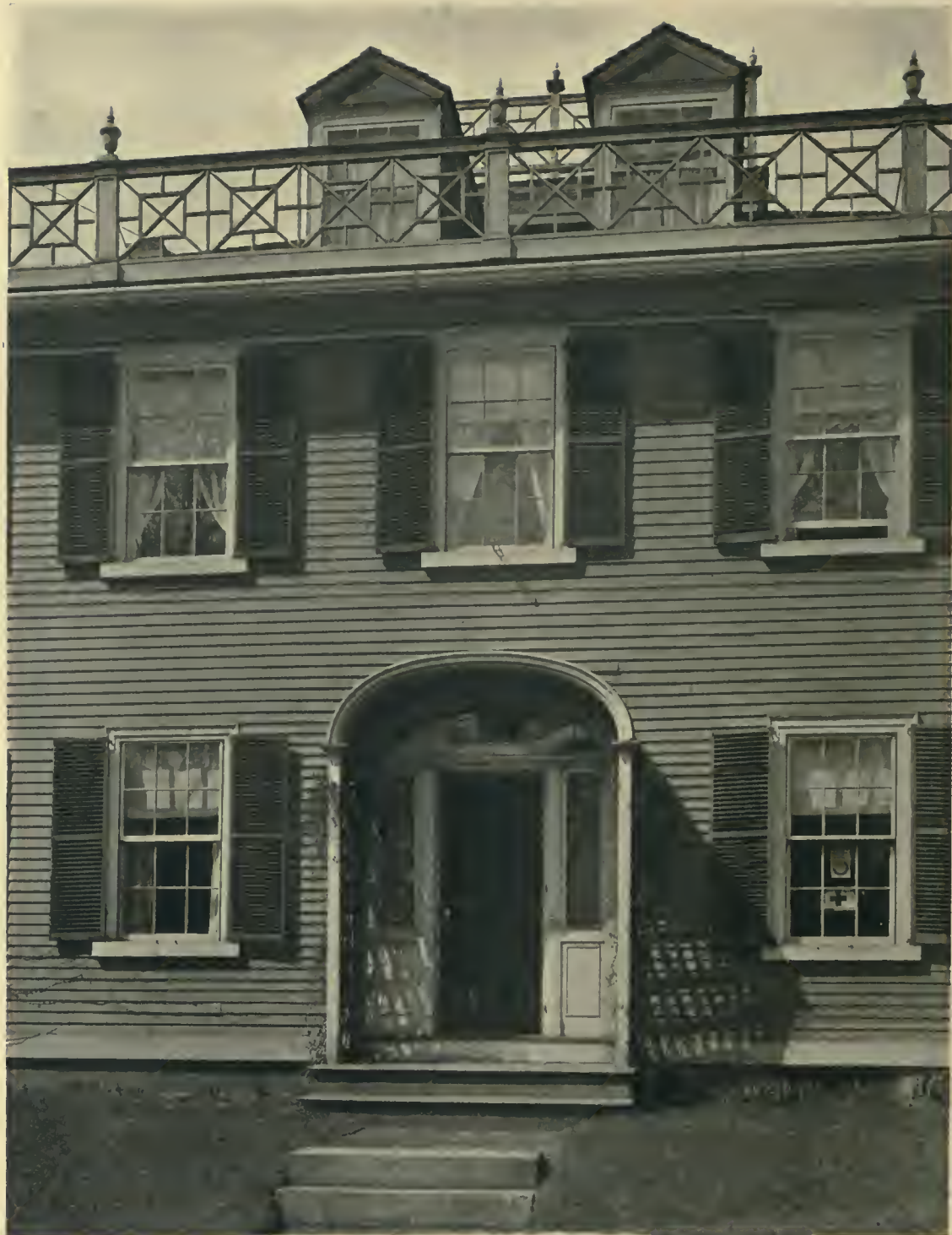
EBENEZER KNIGHT DEXTER HOUSE. North Side of Angell Street. Now the Diman House. Circa 1800.