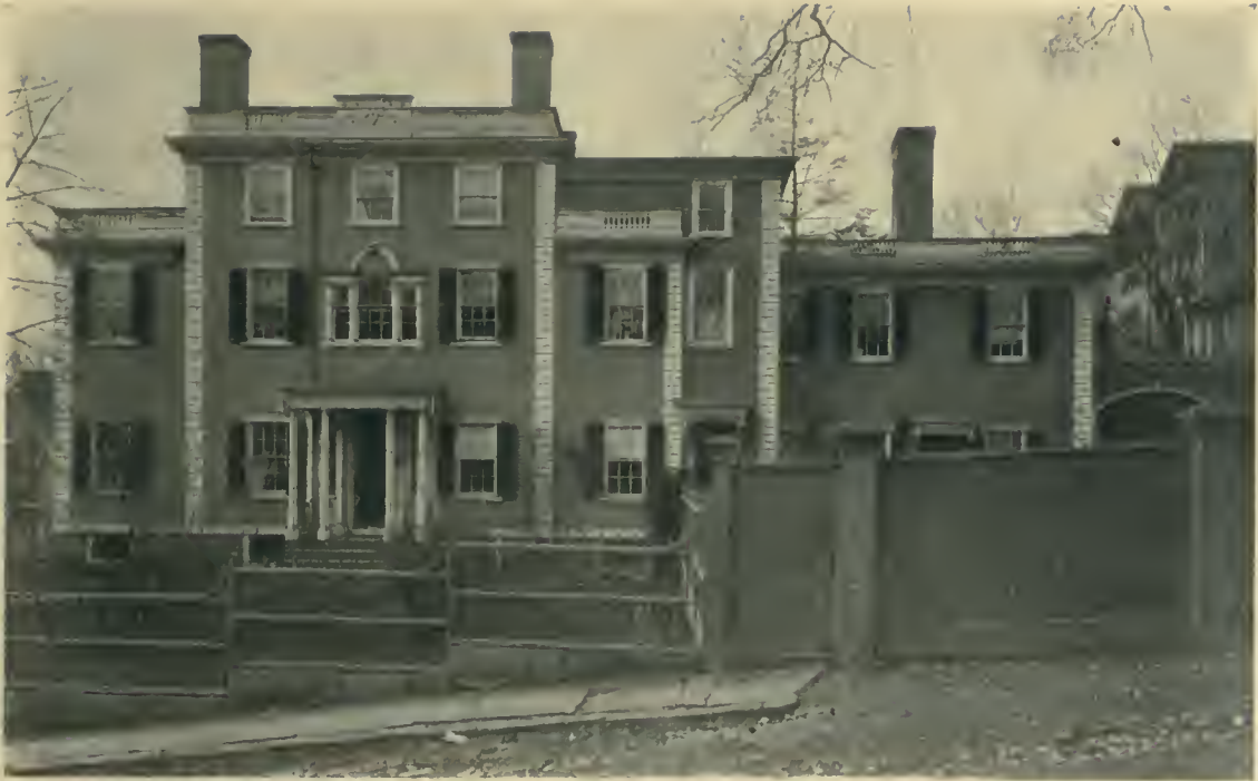
SULLIVAN DORR HOUSE, PROVIDENCE, RHODE ISLAND.