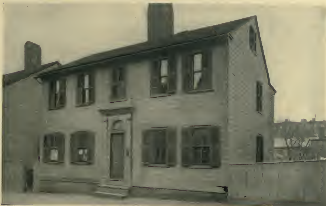
HOUSE ON SOUTH STREET.