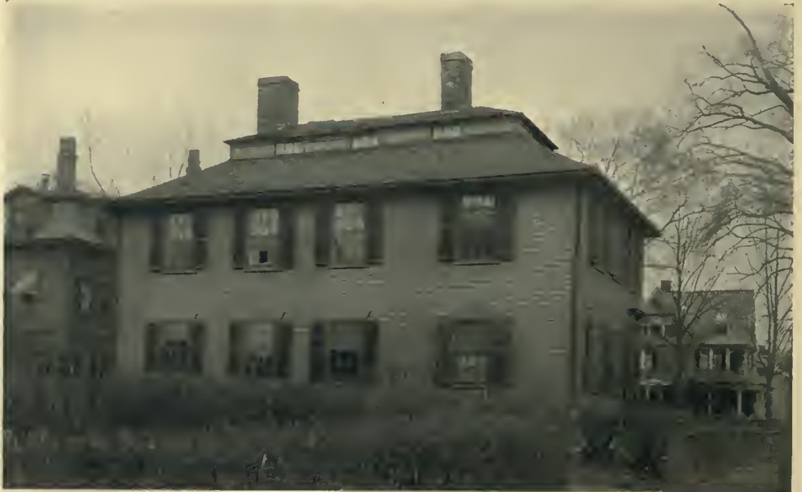
BURROUGH HOUSE. North Side of Power Street. Circa 1820.