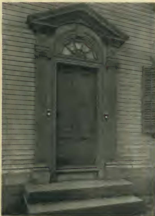
Doorway. SOUTH SIDE OF ARNOLD STREET. Circa 1800. Providence, Rhode Island.

In all these houses we can see that the standard of workmanship was very high in Providence; as it was, indeed, in all Rhode Island. The details, too, are generally very correct and well designed. There is evidence all through the work in the city that skilful and painstaking workmen wrought upon the building of its homes. What they have left behind them ranks high in the architecture of the old Thirteen Colonies.