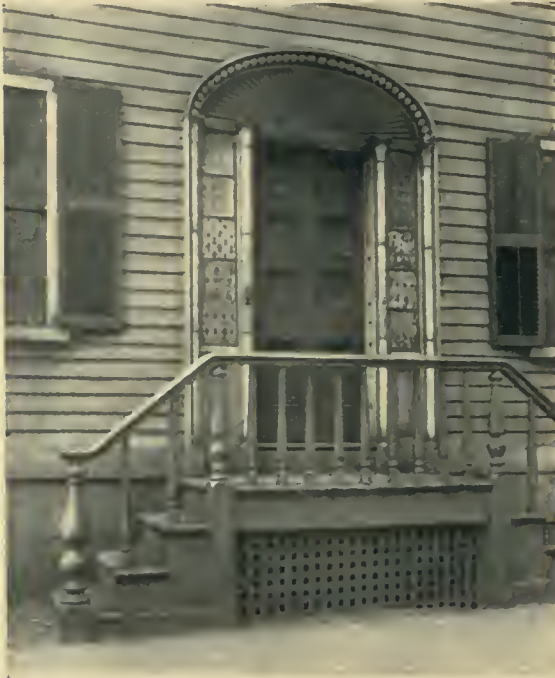
Doorway. HOUSE ON CHESTNUT STREET. Providence, Rhode Island.

exist, as the photographs of this article show, but they are few in number. The reproach, however, comes from lack of observation. There are many types of doorway, all interesting, and the different examples of each type vary more than might be supposed.