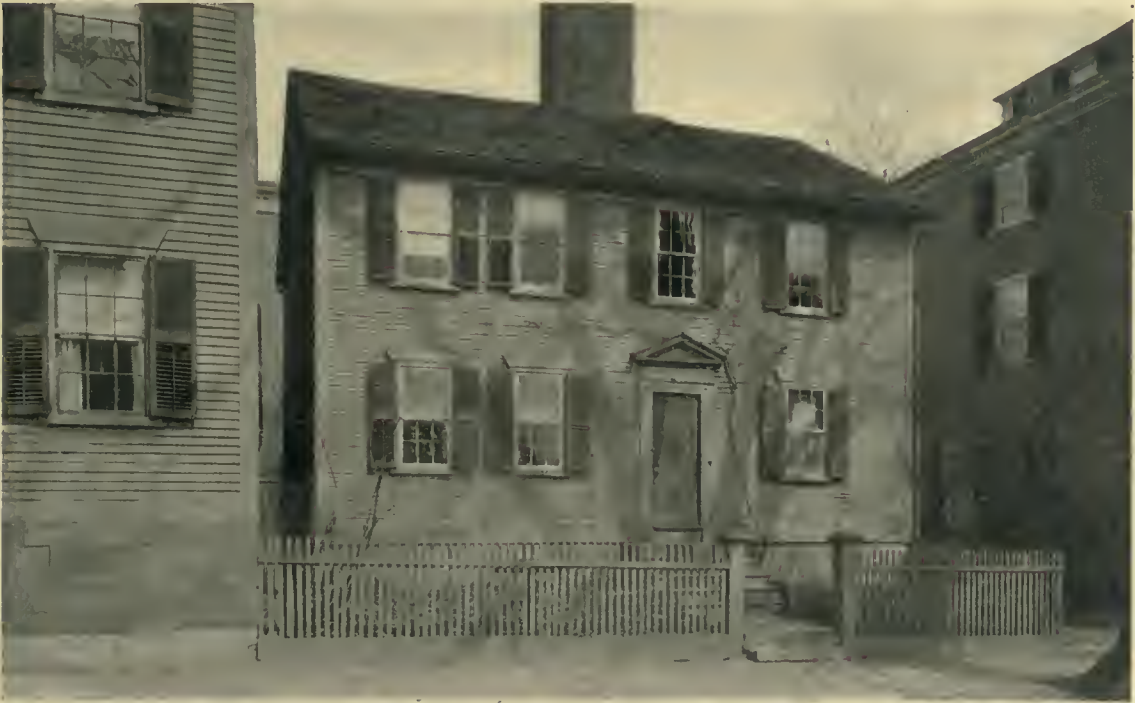
JASON WILLIAMS-CROUCH HOUSE.

The house has a fine front porch with the