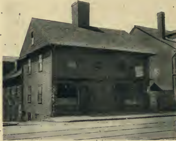
CHRISTOPHER ARNOLD HOUSE. South Main Street. Circa 1735.

The central chimney plan which has just been described remained in fashion almost up to the Greek Revival, though the houses grew larger, lost their quaintness, and acquired more dignity. Dwellings of the type were built even after 1800. The plan was no longer the tip of the fashion, however. The second quarter of the century, especially the years just before 1750, and, of course, even more the years just before the Revolution, when the money from privateering in the Old French War was flowing into the town, saw the rise and spread here, as in the rest of New England, of the central-entry type of plan—that in which a long hall runs through the