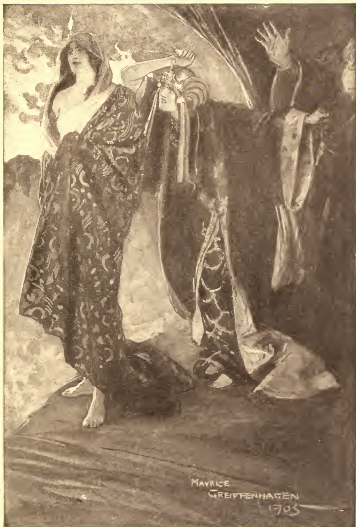
“As Ayesha passed her, the maddened Khania drew a hidden dagger and struck.”