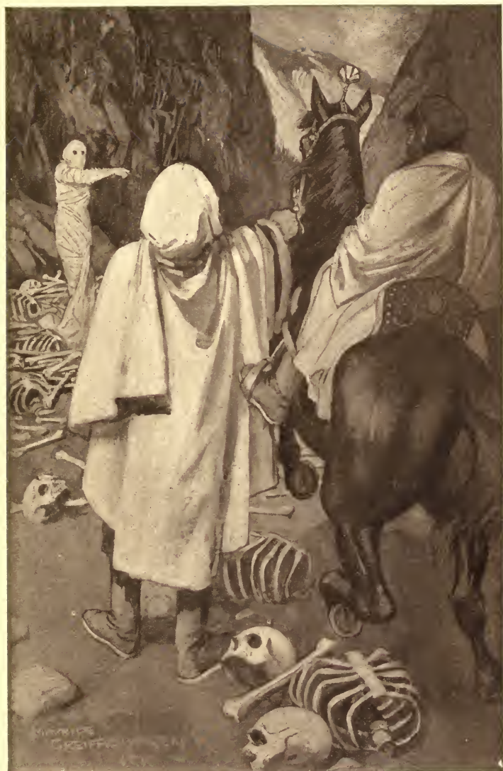
“It was stirring.”