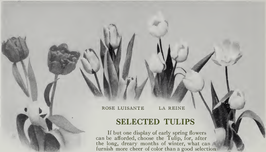
ROSE LUISANTE LA REINE