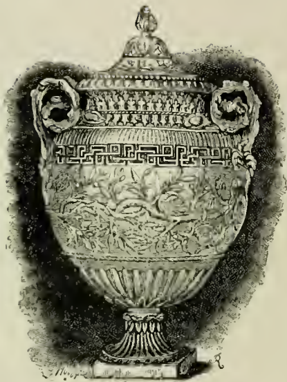
CINERARY URN FROM THE MUSEUM OF THE VATICAN.