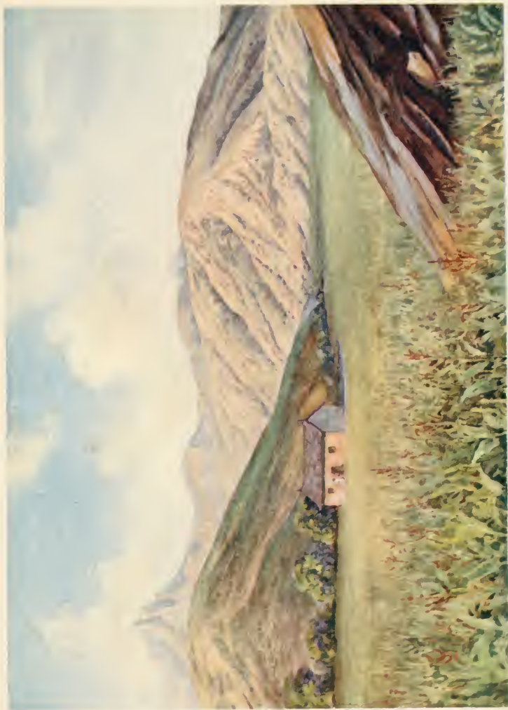
PASS ON THE ROAD FROM SEOUL TO PUKING. (MAY '17)