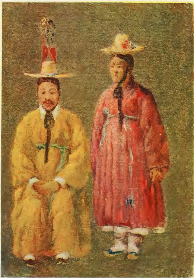
SERVANTS OF THE EMPEROR