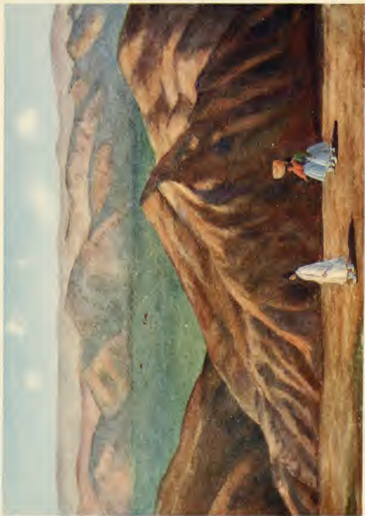
THE PEKING PASS. P. 100-101