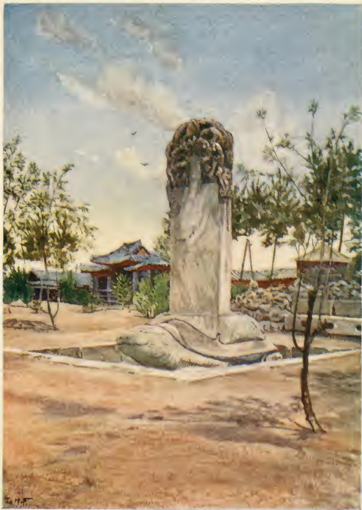
MONUMENT WITH TORTOISE PEDESTAL IN THE PUBLIC GARDENS SEUL