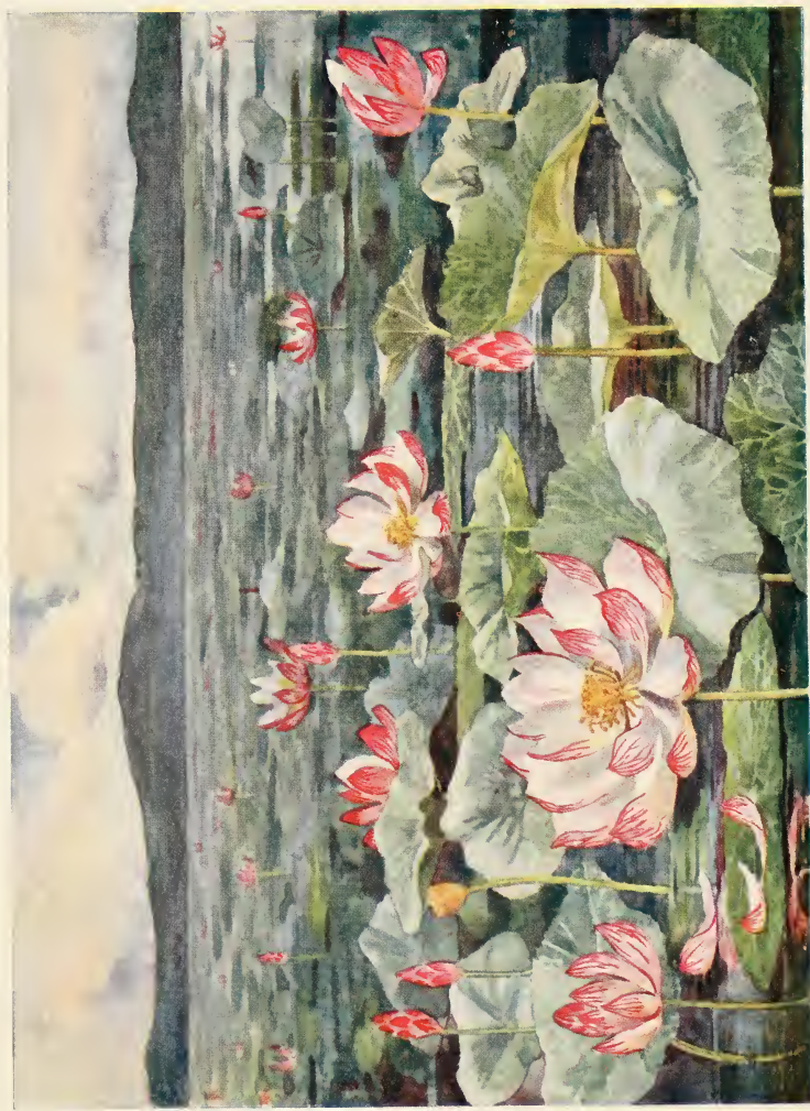
LOTUS POND IN THE PALACE GARDENS, SEOUL