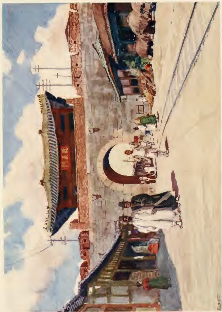
ONE OF THE GATEWAYS ON THE CITY WALL SEUL. PHOTO 72.