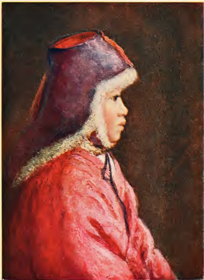
KOREAN GIRL IN WINTER DRESS. Page 39.