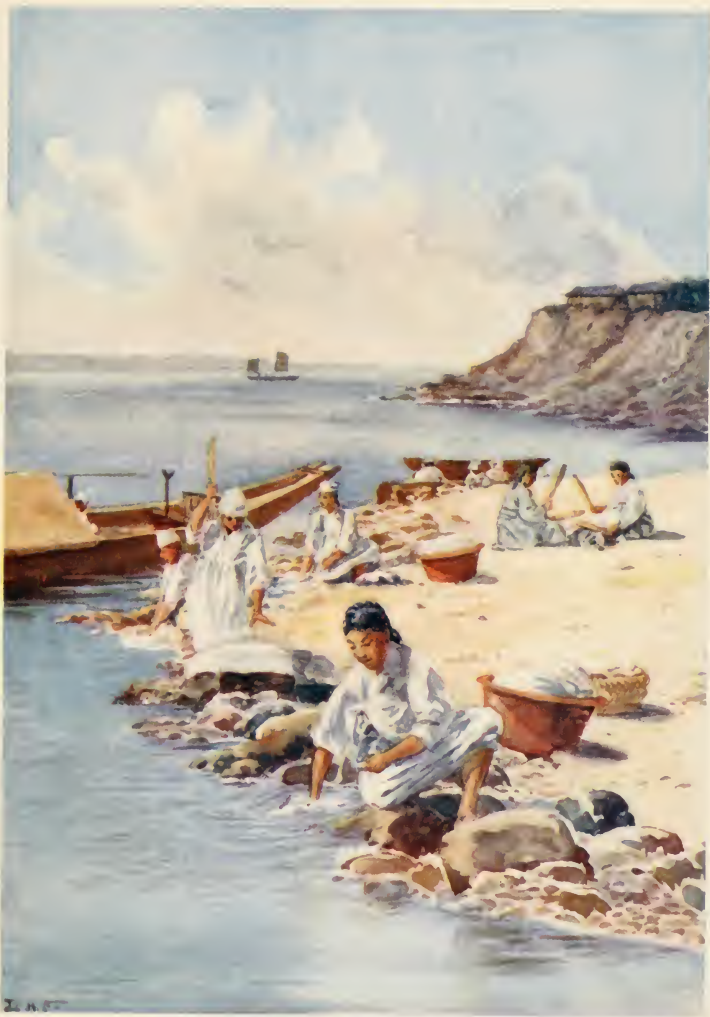
WASHER-WOMEN BY THE RIVER SIDE. Page 37.