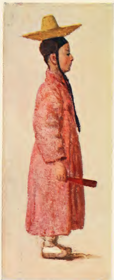
A KOREAN BRIDEGROOM. Page 3.