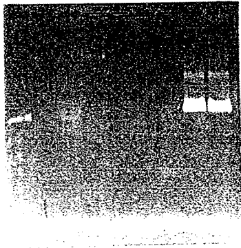
Figure 2 Hybridization Using Spiroplasma PCR Product mrks Different CJD Cases Myc Spir N Alz ! 1 2 3 4 5 6 ! ! ! ! + + + + + +