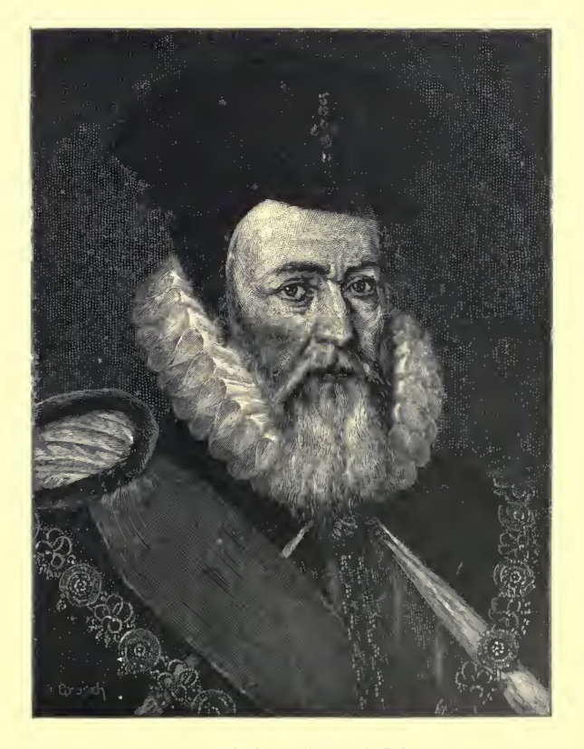
WILLIAM CECIL, LORD BURLEIGH Painted by Marc Gheeraedts, the Elder. In the possession of the Marquis of Salisbury, Hatheld House.