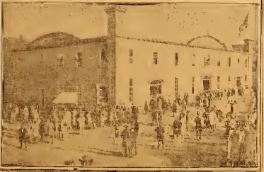
The "Wigwam" Chicago, in which Republican Convention of 1860 Was Held. This building, in which Lincoln was nominated by the President-elect at the national convention of the Republican party, was destroyed by fire on the 10th of October, 1869.

There is a great deal of interest in the Springfield farewells. It is a day of great importance to the world. It is a day of great importance to the world.