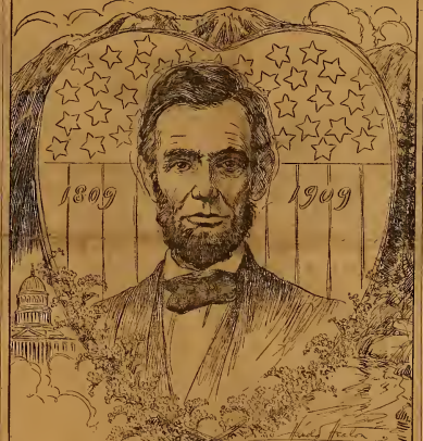
IN THE HEART OF THE NATION

San Francisco, Feb. 11.—The California legislature today passed a resolution expressing its displeasure at the federal government's interference in the state's affairs. The resolution also gave no credit to the white house for the death of legislation.