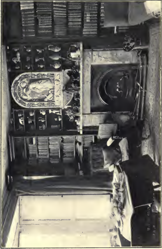
RUSKIN'S STUDY, BRANTWOOD.