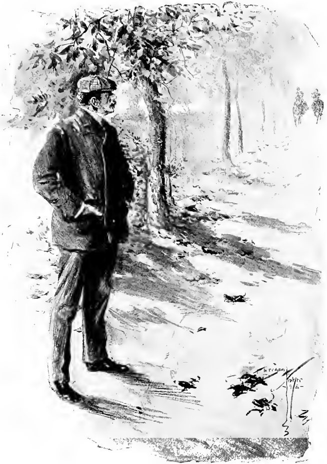
TWO HORSES WITH RIDERS, ADVANCING AT A BRISK CANTER