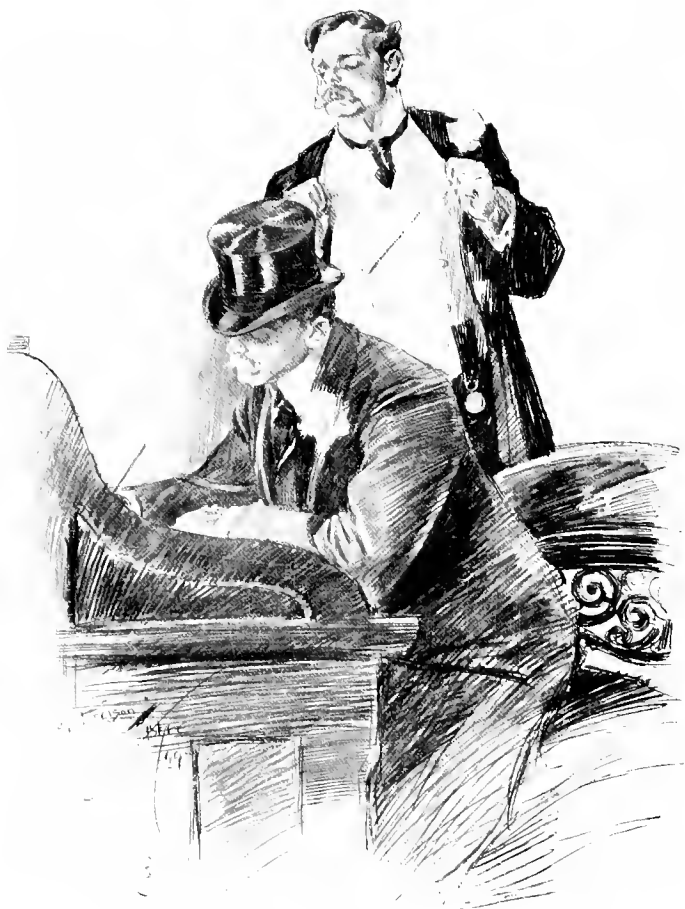
WITHOUT HESITATION WROTE SEVERAL LINES RAPIDLY